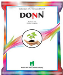
Donn Carbendazim 12% and Mancozeb 63% WP Fungicide