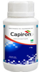
Capiron Tebuconazole 10% and Sulphur 65% WG Fungicide