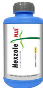
Hexzole Plus Hexaconazole 5% SC Fungicide