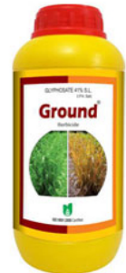
Ground Glyphosate 41% SI Herbicide