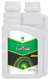
Teboride Tebuconazole 25.9% EC Fungicide