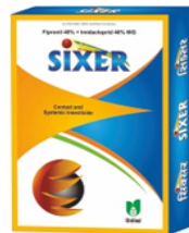
Sixer Fipronil 40% and Imidacloprid 40% WG Insecticide