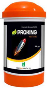
Proking Emamectin Benzoate 5% SG Insecticide