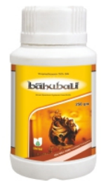
Bahubali Thiamethoxam 75% SG Insecticide