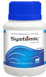
Systemic Hexaconazole 75% WG Fungicide