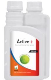
Active + Silicon Based Spreader