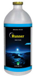
Runner Bifenthrin 10% EC Insecticide