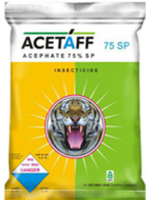
Acetaff Acephate 75% SP Insecticide