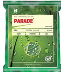
Parade Acetamiprid 20% SP Insecticide