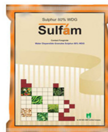
Sulfam Sulphur 80% WDG Fungicide