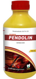
Super Pendolin Pendimethalin 38.7% CS Herbicide