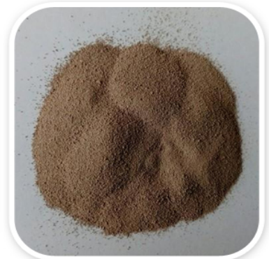
Sulfam Gold Sulphur 90% WDG Fertilizer