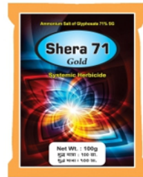
Shera 71 Gold Ammonium Salt of Glyphosate 71% SG Herbicide