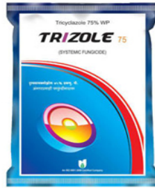
Trizole 75 Tricyclazole 75% WP Fungicide