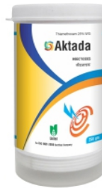
Aktada Thiamethoxam 25% WG Insecticide