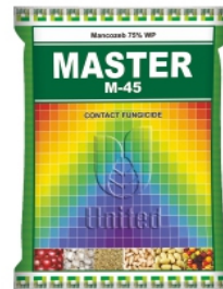
Master M-45 Mancozeb 75% WP Fungicide