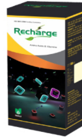
Recharge Amino Acid & Vitamins Liquid Fertilizer