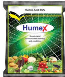
Humex Humic Acid 95% WS