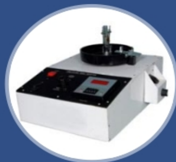
Seed Counter (Economy)