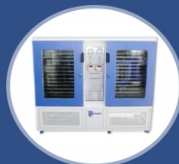
Seed Germinator (Dual Chamber)