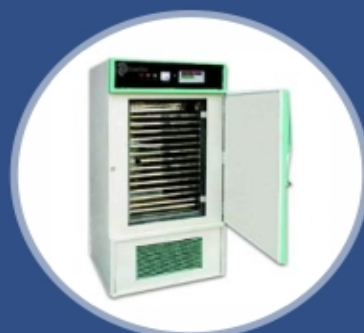
Seed Germinator (Single Chamber)