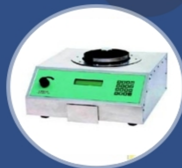
Seed Counter (Computerized)