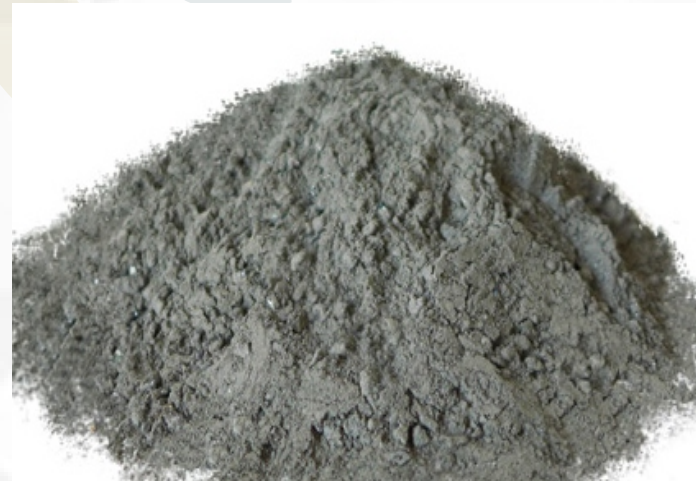
Copper / Brass Ramming Mass