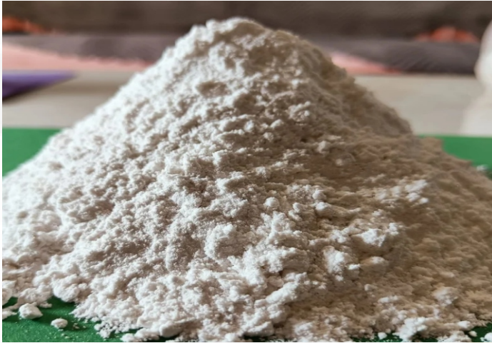
Neutral Ramming Mass