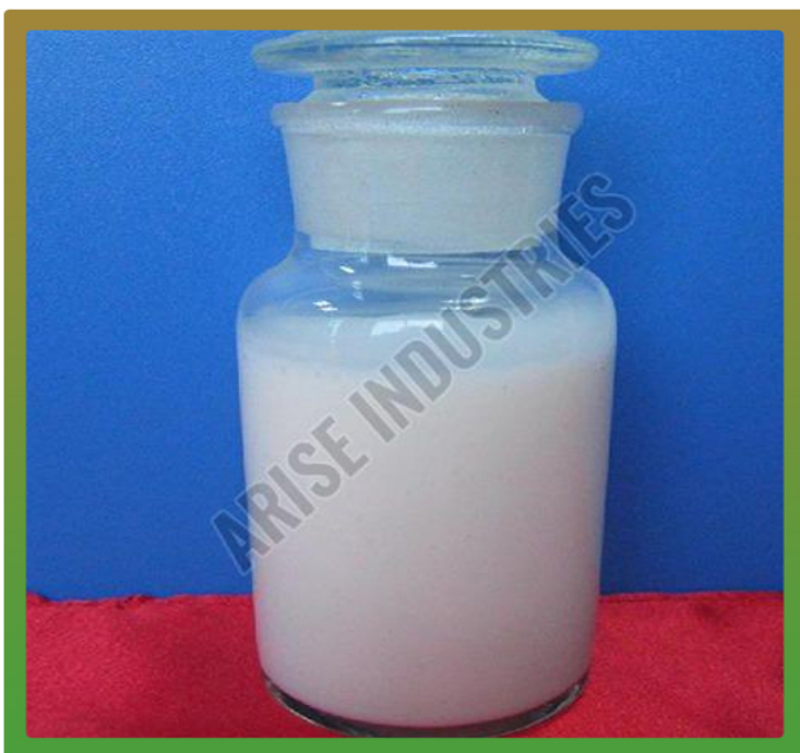
PU Release Agent