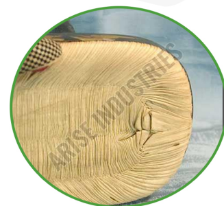
Shoes Soles Finishing Lacquers 01