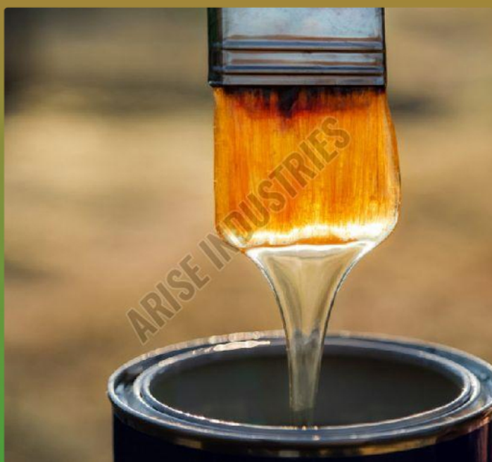
TPR Sole and Polyurethanes Sole Lacquer