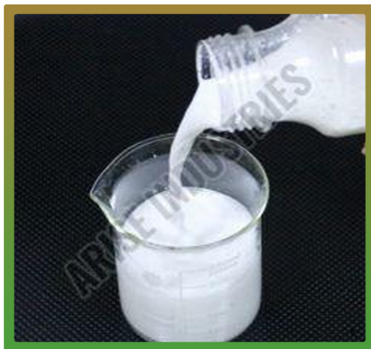
PU Filters Release Agent