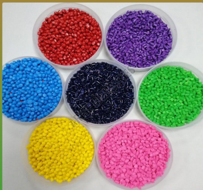
Multicolor Polyurethane Based Masterbatch