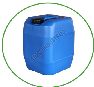
PU Sandals and Slippers Release Agent