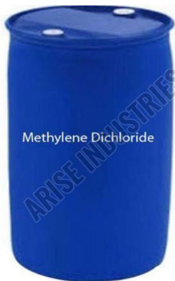
Methylene Di Chloride