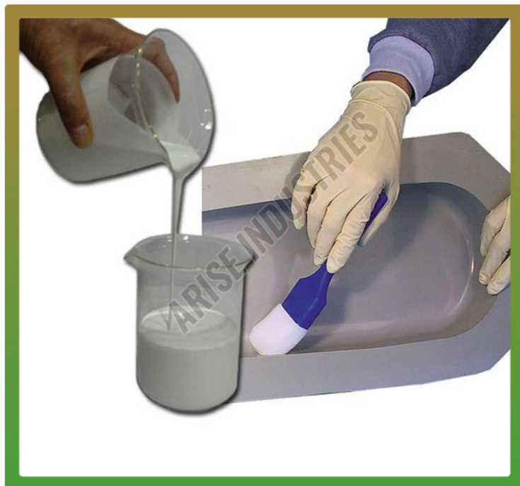
PU Puf Panels Release Agent