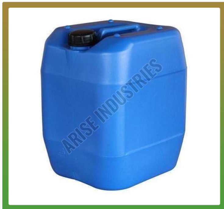
PU Sandals and Slippers Release Agent