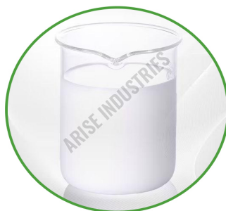
Water Based Release Agent For PU Sole