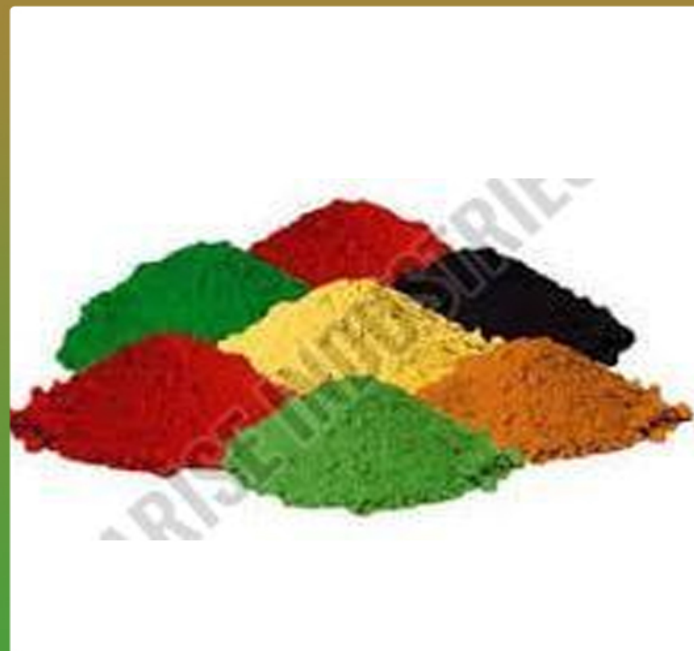
All Types Polyurethane Pigments