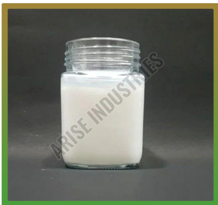
PU Tiles Solvent Based Release Agent