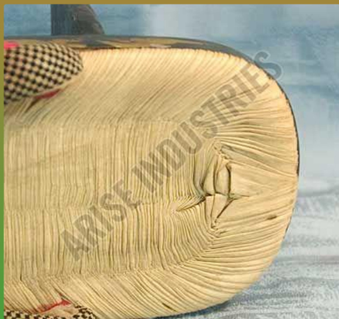
Shoes Soles Finishing Lacquers 01