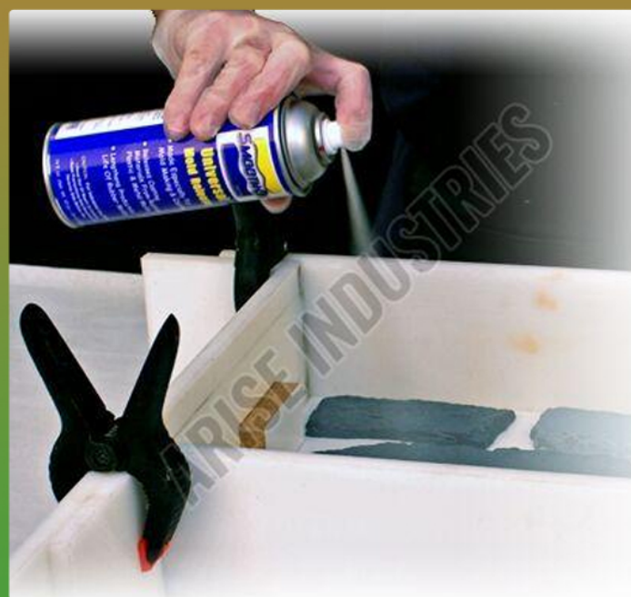
PU Soles and Sleepers Water Based Release Agent