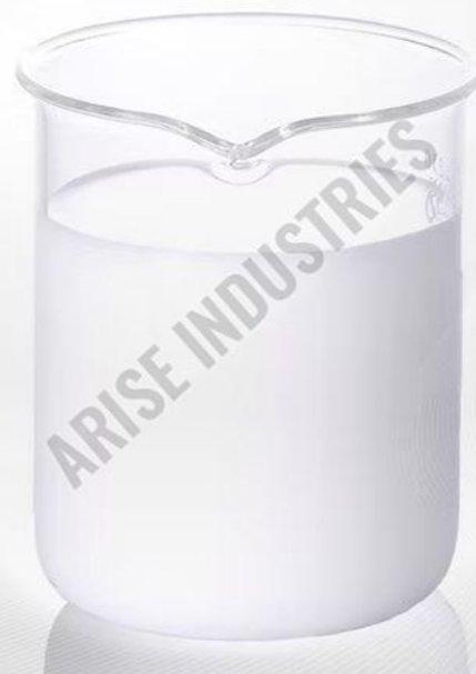
Water Based Release Agent For PU Sole