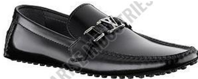
Shoes Soles Finishing Lacquers 02