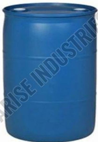
Safety Shoes Matt Finish Release Agent