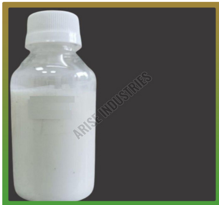
High Gloss Finish Water Based Release Agent