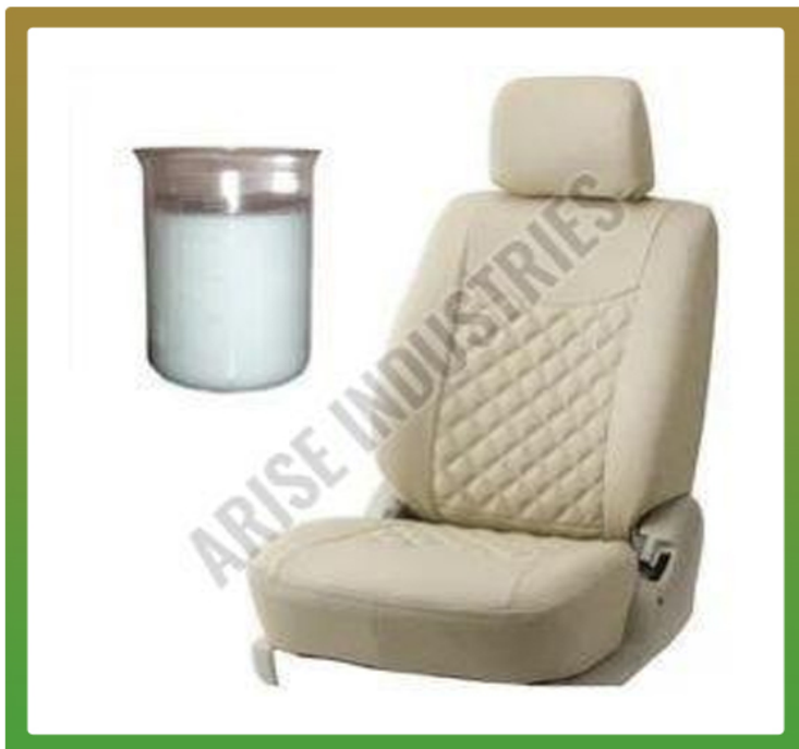
Automotive PU Seat Release Agent