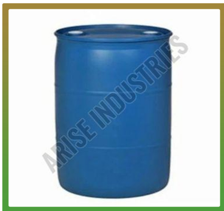
Puff Panel Solvent Based Release Agent