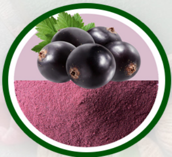
Black Currant Powder