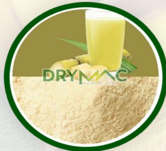
Sugarcane Juice Powder