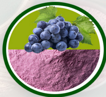
Black Currant Powder