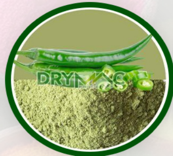
Green Chilli Powder