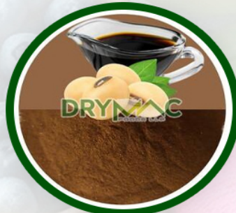
soya soas powderer