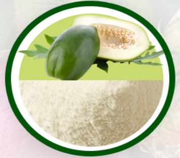
Green Papaya Powder