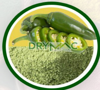
Jalapeno Chili Powder