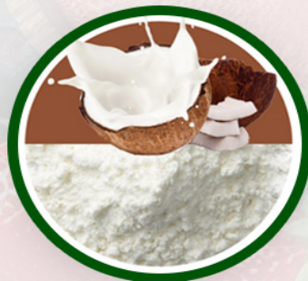
Coconut Milk Powder