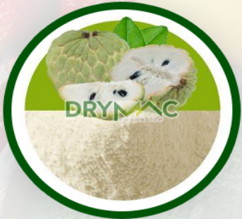
Custard Apple Powder