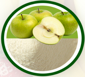
Green Apple Powder