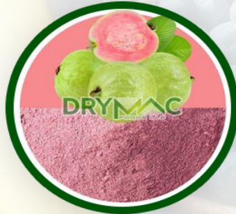
Pink Guava Powder