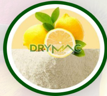
Fresh Lemon Powder