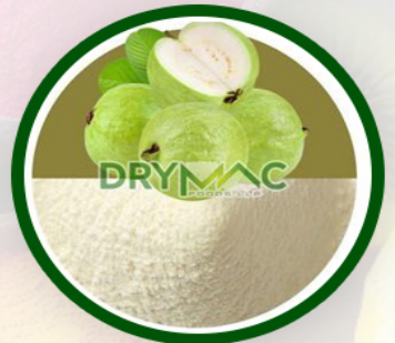
White Guava Powder