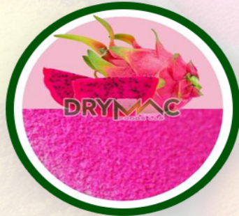
Dragon Fruit Powder