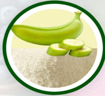
Green Banana Powder