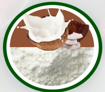
Vegan Coconut Milk Powder

+91-9099771954, +91-7859852843, 08048777881