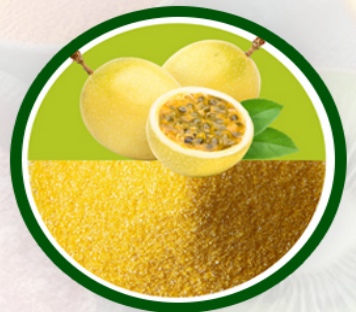
Passion Fruit Powder