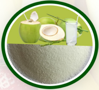
Coconut Water Powder