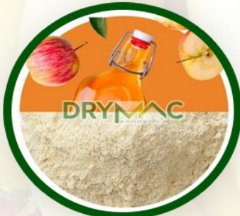
Apple Cider Vinegar Powder