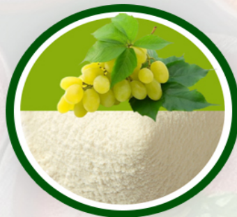
Green Grapes Powder