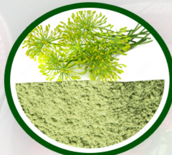
Green Fennel Powder