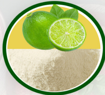
Lime Powder (Green Lemon)