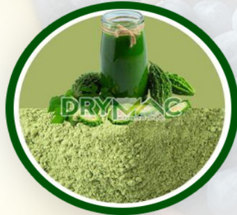
Bitter Gourd Powder