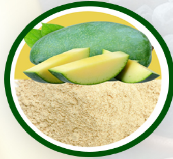
Green Mango Powder