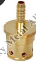
Brass Automotive Parts