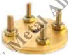
Brass Electrical Parts