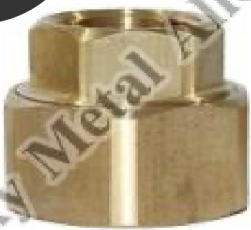
Female Union Connector