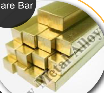
Brass Square Bar