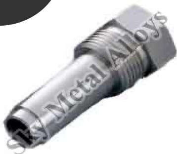
Brass Turned Components