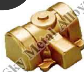
Brass forging components