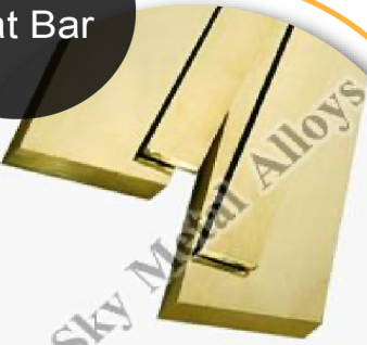
Brass Flat Bar