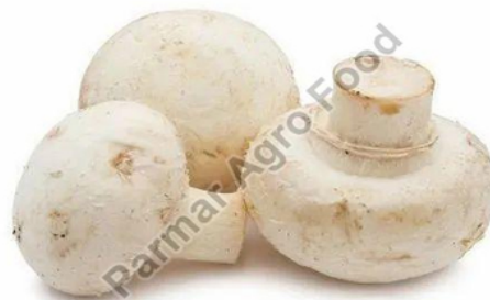
Fresh Button Mushroom