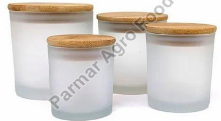
Decorative Candle Jar