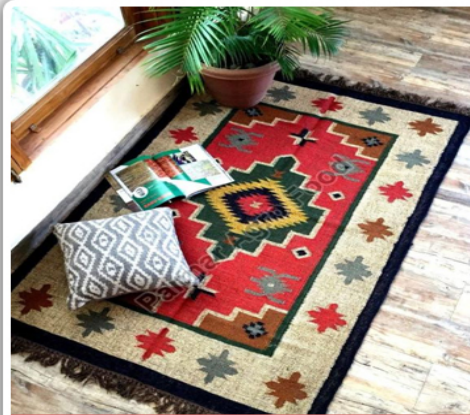
Printed Jute Carpet