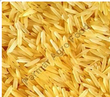
1121 Golden Sella Basmati Rice