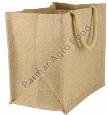
Plain Jute Bag