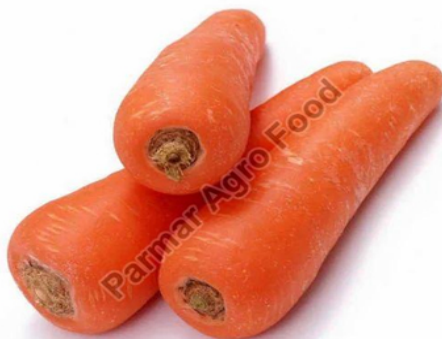
Fresh Baby Carrot