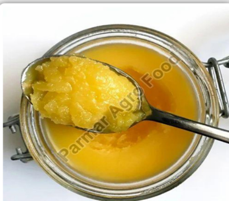
Organic Desi Cow Ghee