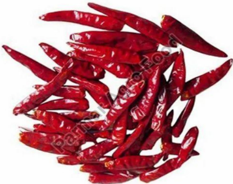
Whole Red Chilli