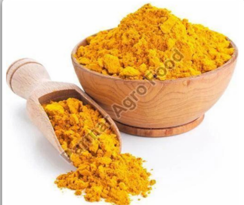
Organic Turmeric Powder