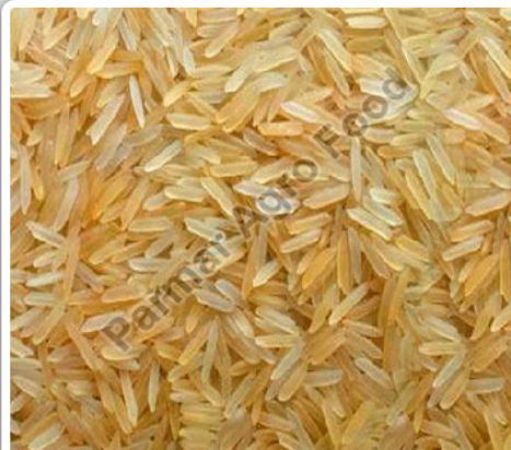
1509 Golden Sella Basmati Rice