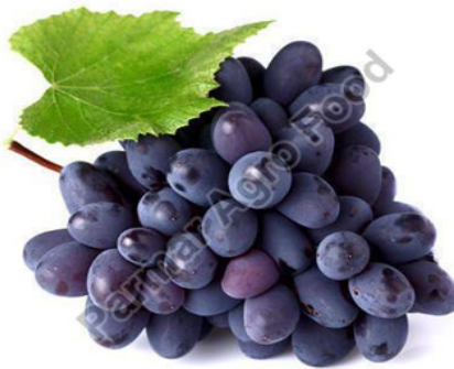
Fresh Purple Grapes