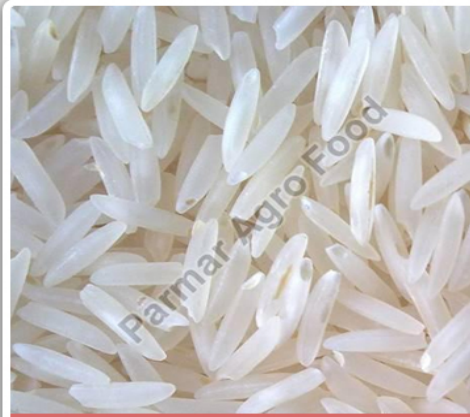
Sugandha Basmati Rice