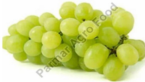
Fresh Green Grapes