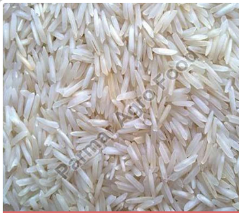
Creamy Basmati Rice