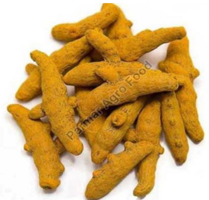
Organic Whole Turmeric