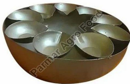
Round Iron Diya