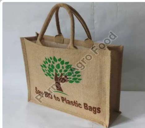
Printed Jute Bag