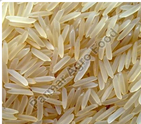
1401 Golden Sella Basmati Rice