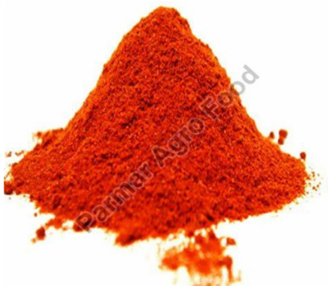
Red Chili Powder