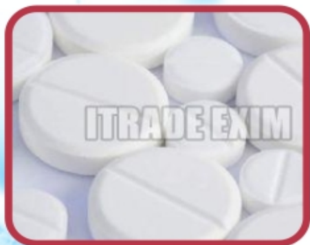
Valclovir 500mg Tablets