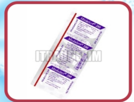
Modalert 200mg Tablets