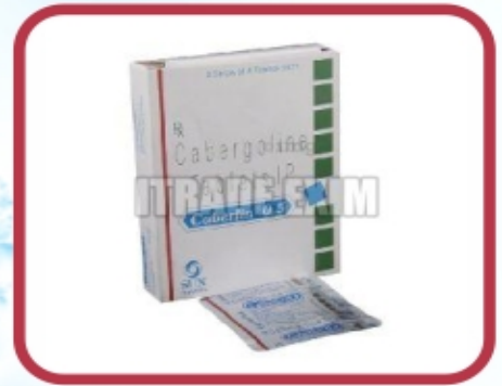
Caberlin 0.5mg Tablets