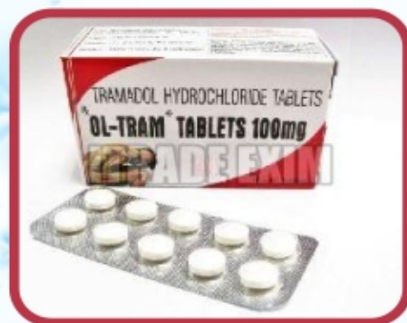
Ol Tram 100mg Tablets