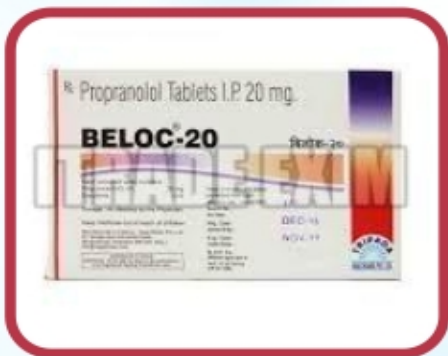
Beloc 20mg Tablets