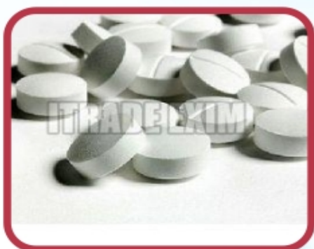
Azit 500mg Tablets