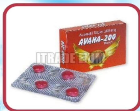
Avana 200mg Tablets