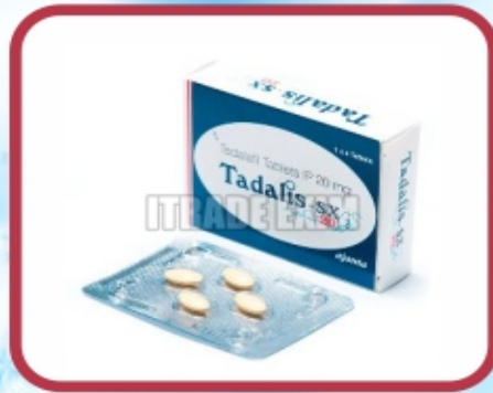
Tadalis SX 20mg Tablets