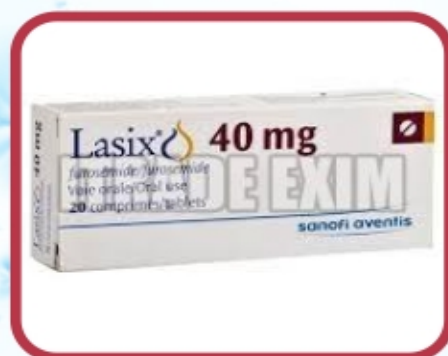
Lasix 40mg Tablets