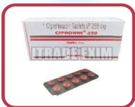
Ciprowin 250mg Tablets