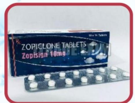
Zopisign 10mg Tablets