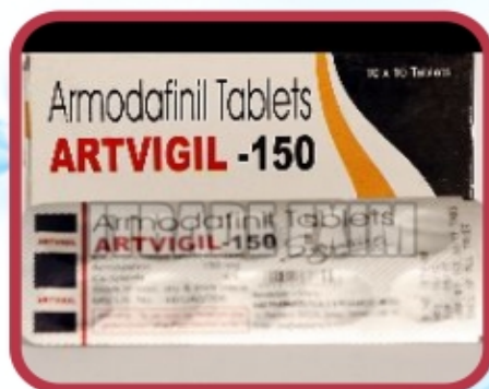
Artvigil 150mg Tablets