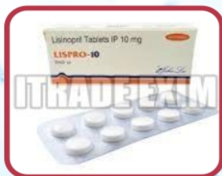
Lispro 10mg Tablets