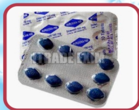
Aurogra 100mg Tablets