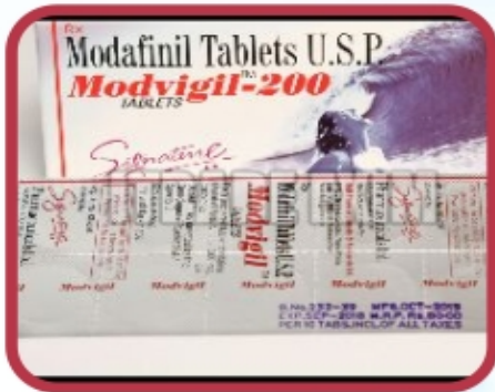
Modvigil 200mg Tablets