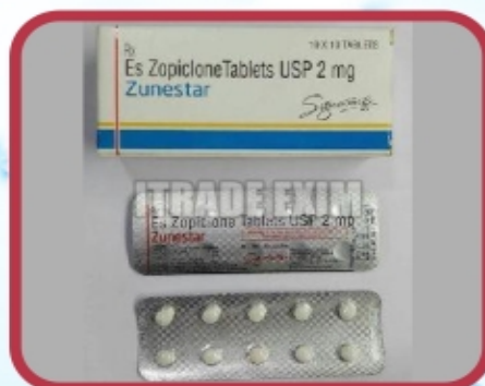
Zunestar 2mg Tablets