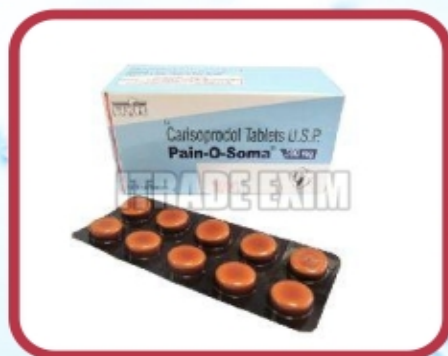
Pain O Soma 500mg Tablets