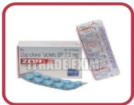
Zop 7.5mg Tablets