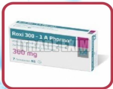
Roxid 300mg Tablets