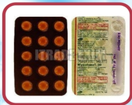
Wysolone 20mg Tablets