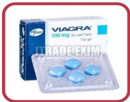
Viagra 100mg Tablets