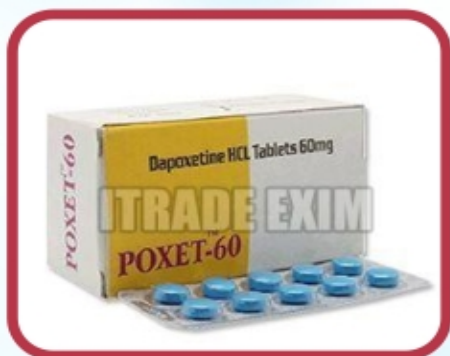
Poxet 60mg Tablets