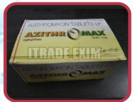
Azithromax 500mg Tablets