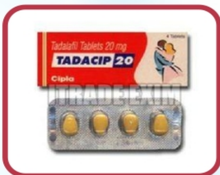
Tadacip 20mg Tablets