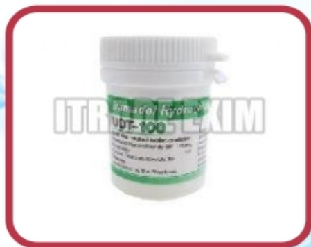
UDT 100mg Tablets