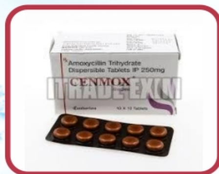
Cenmox 250mg Tablets