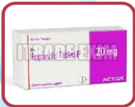
Migabet 20mg Tablets