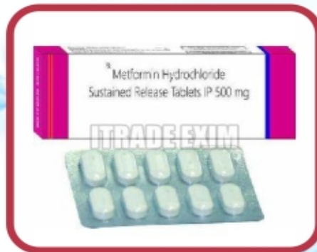
Metford 500mg Tablets