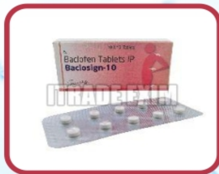
Baclosign 10mg Tablets