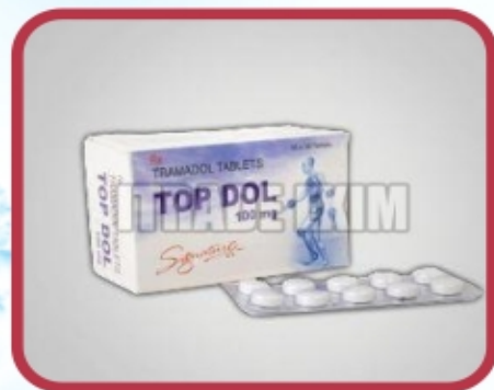
Top Dol 100mg Tablets