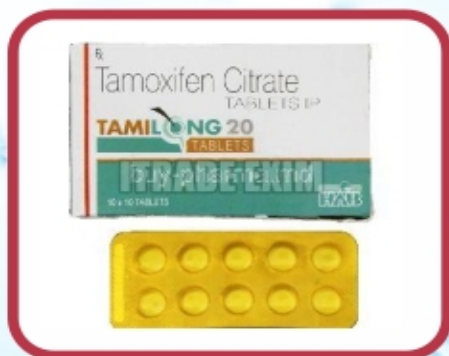
Tamilong 20mg Tablets