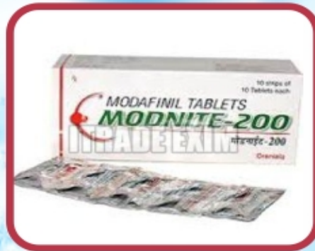
Modnite 200mg Tablets