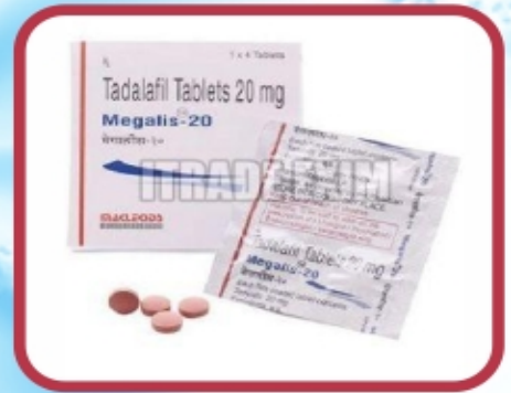
Megalis 20mg Tablets