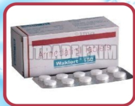
Waklert 150mg Tablets