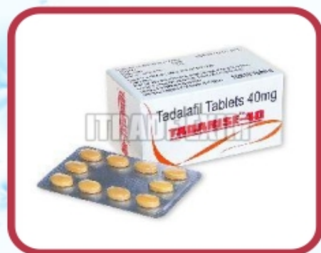
Tadarise 40mg Tablets