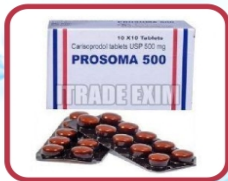
Prosoma 500mg Tablets