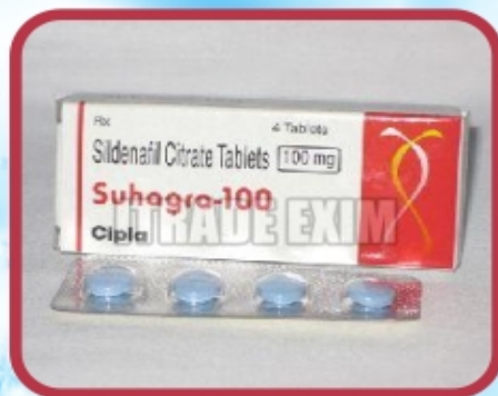
Suhagra 100mg Tablets