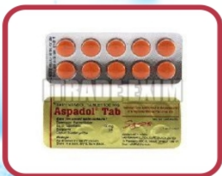
Aspadol 100mg Tablets