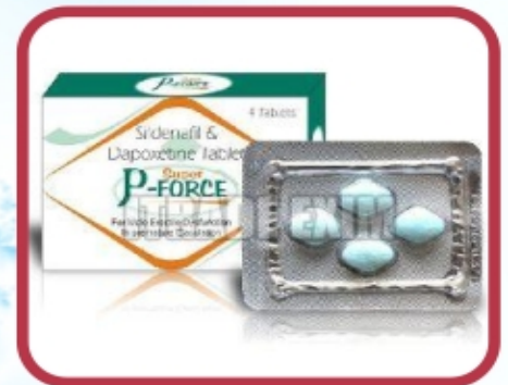
Super P Force Tablets