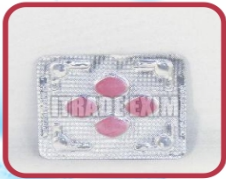
Lovegra 100mg Tablets