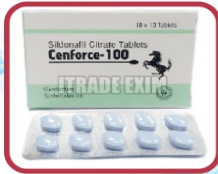
Cenforce 100mg Tablets