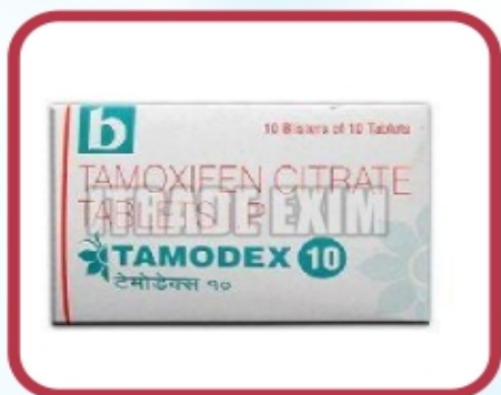
Tamodex 10mg Tablets