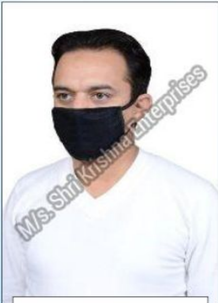
Anti Pollution Mask