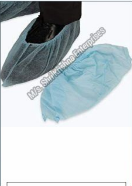
Non Woven Shoe Cover