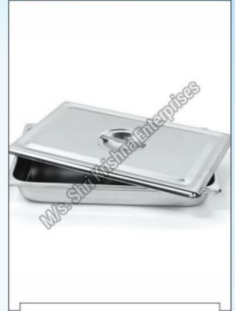
Hospital Instrument Tray