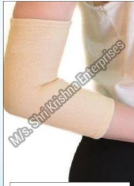
Classic Elbow Support