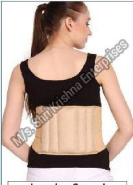
Lumbo Sacral Support Belt