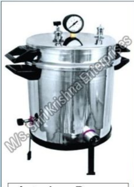
Autoclave Pressure Cooker