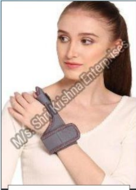
Thumb Spica Splint