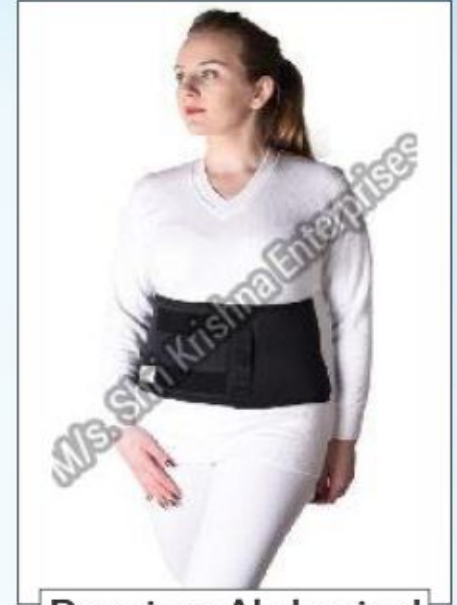
Premium Abdominal Support Belt