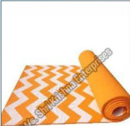
Printed Yoga Mat