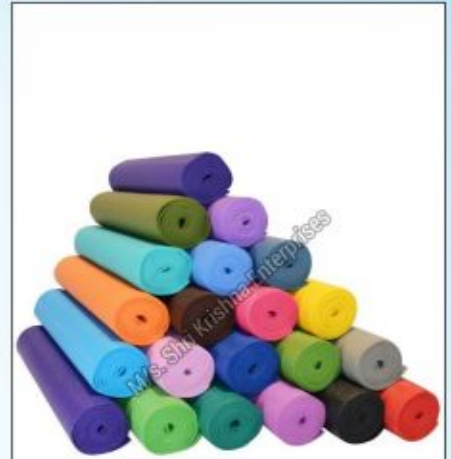
Solid Yoga Exercise Mat