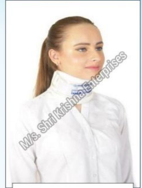
Cervical Collar Hard