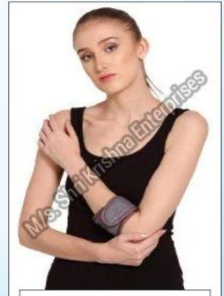
Tennis Elbow Support