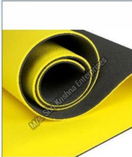
Double Colour Yoga Mat