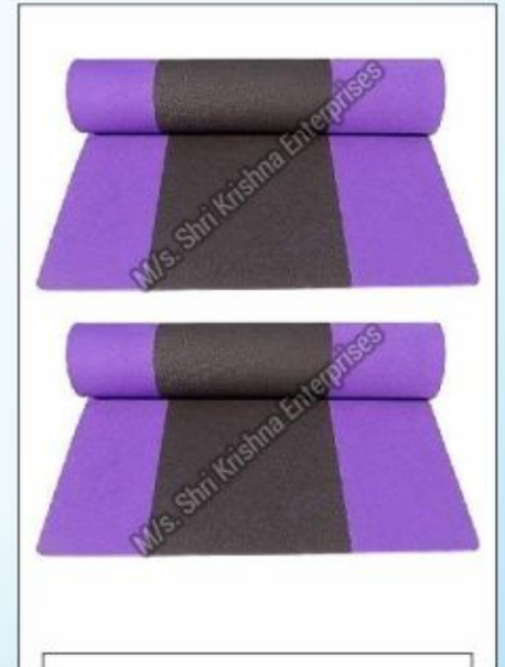
Stripe Yoga Mat