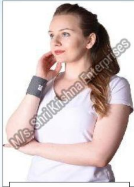
Wrist Support Band