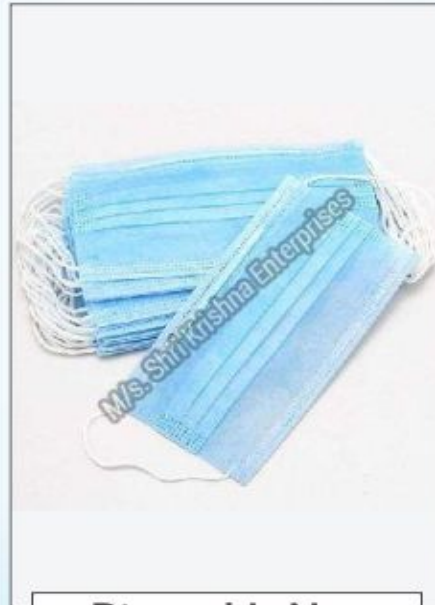
Disposable Non Woven Face Mask