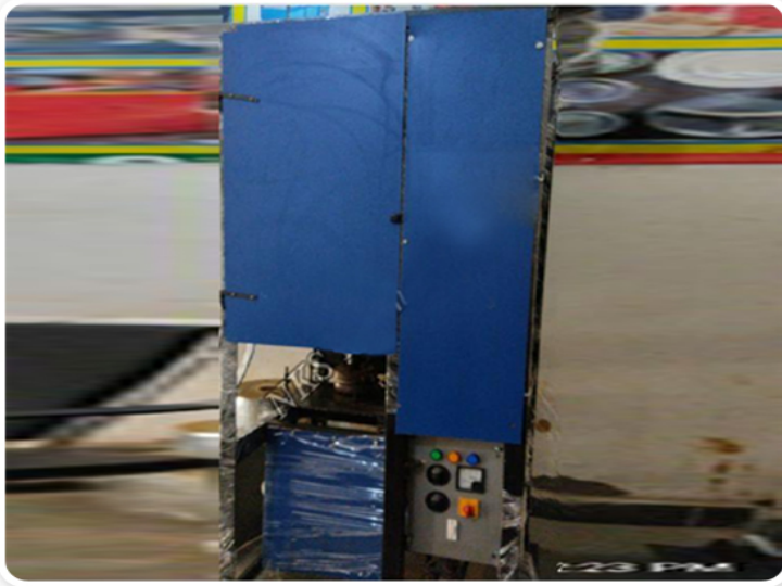
Fully Automatic Single Die Paper Plate Making Machine