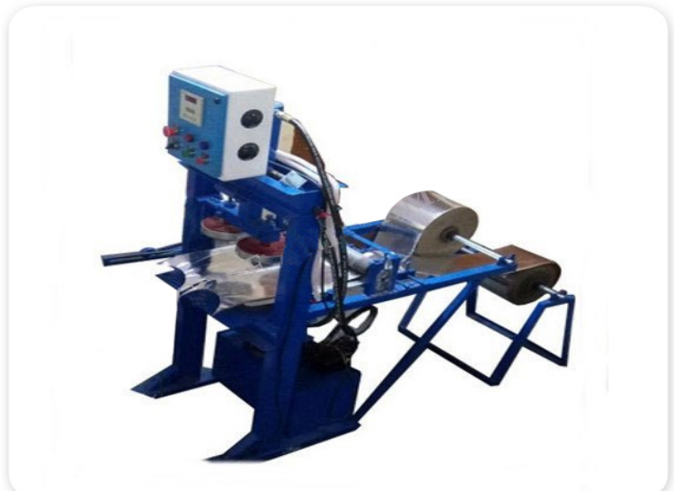
Fully Automatic Hydraulic Double Die Dona Making Machine