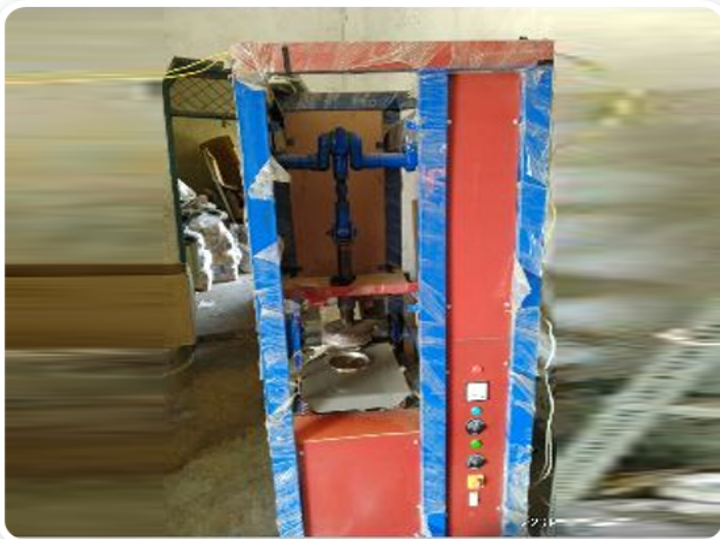
Fully Automatic Hydraulic Single Die Dona Making Machine