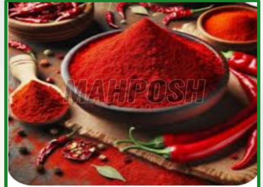
MAHPOSH Red Chilli Powder