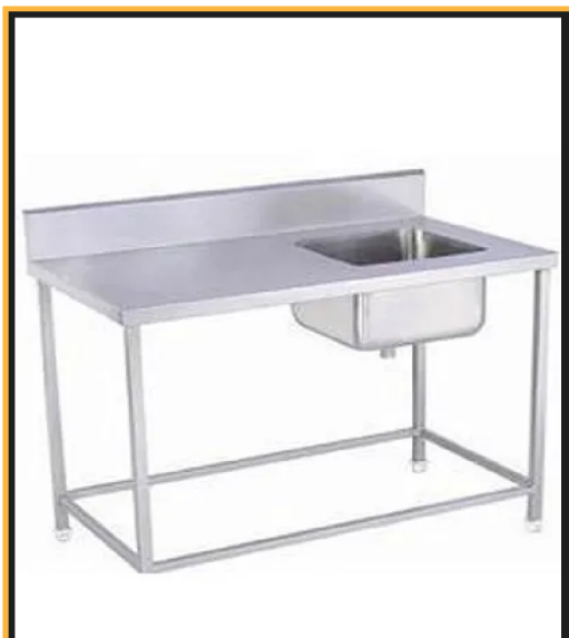
TABLE WITH SINK