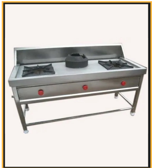
CHINESE BURNER RANGE