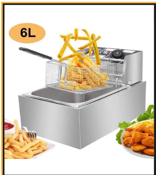
ELECTRIC DEEP FRYER