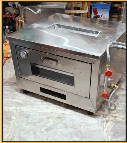
INDIAN PIZZA OVEN