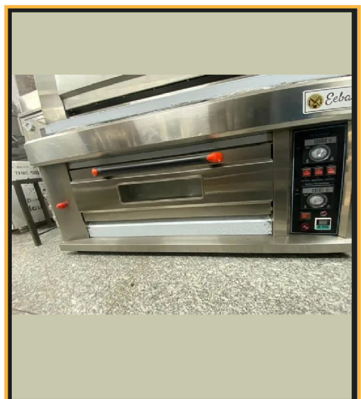
IMPORTED PIZZA OVEN