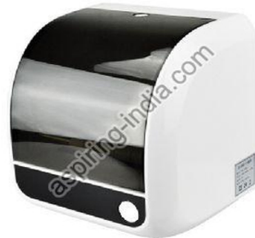
AUTOMATIC TOILET PAPER DISPENSER