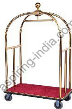
HOTEL LUGGAGE CART