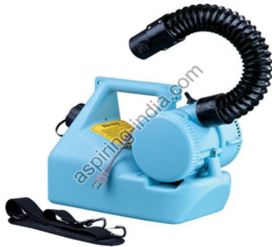
ULV COLD FOGGING MACHINE