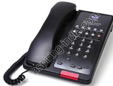
BEETEL LANDLINE PHONE