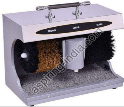
SHOE SHINE MACHINE

ASPIRING INDIA HOSPITALITY SOLUTIONS PVT LTD.