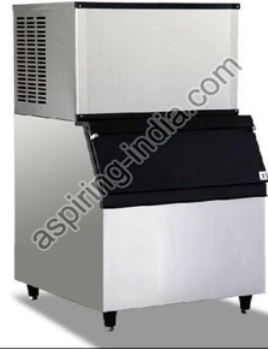
ICE CUBE MAKING MACHINE