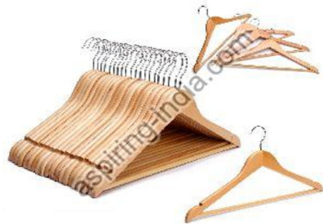
WOODEN CLOTH HANGER