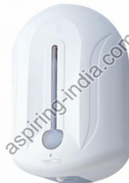
AUTOMATIC SOAP DISPENSER