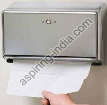
AUTOMATIC TISSUE PAPER DISPENSER