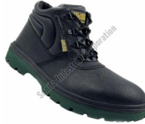
JAMA Double Density PU Safety Shoes