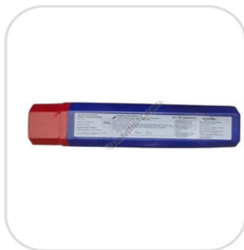
L&T EWAC Welding Rod