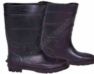
Industrial Safety Gumboots