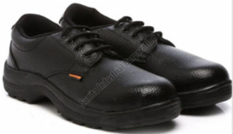
PVC Sole Safety Shoes