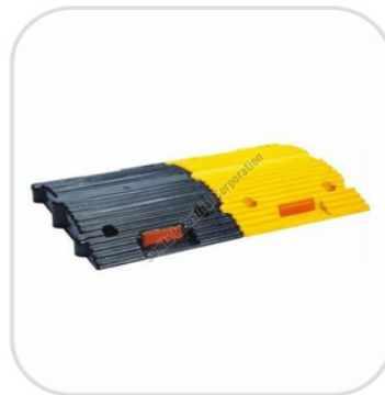
Plastic Road Bumper