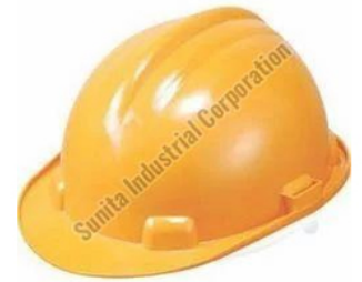
Nape Strap Safety Helmet