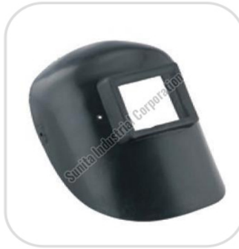
Welding Head Screen