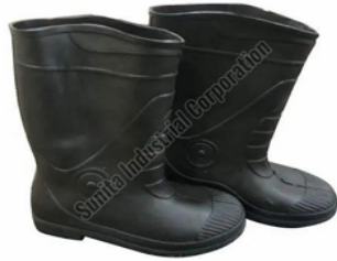
11 Inch Safety Gumboots