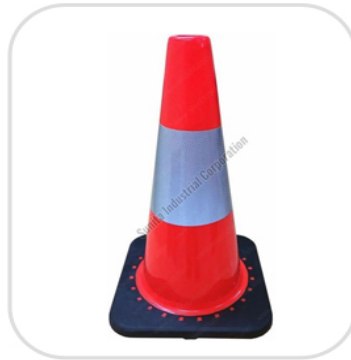
Reflective Traffic Cone