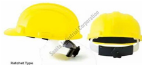
Ratchet Type Safety Helmet