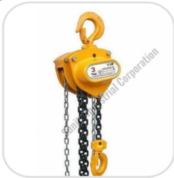
Chain Pulley Block