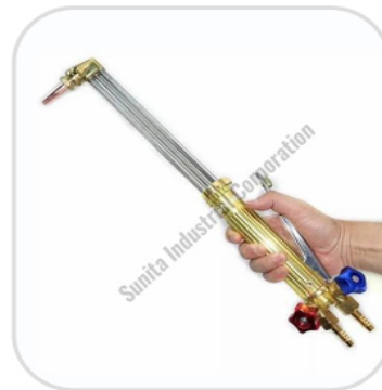
Gas Cutting Torch