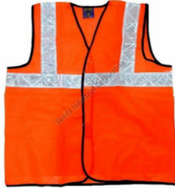
Reflective Safety Jacket