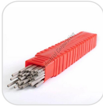
Lotherme 468 Electrodes