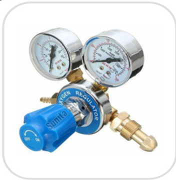
Industrial Oxygen Regulator