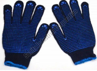
Dotted Hand Gloves