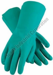
PVC Coated Hand Gloves