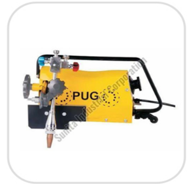
Pug Cutting Machine