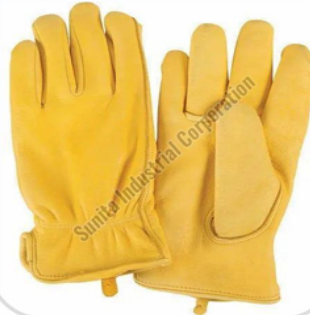
Safety Hand Gloves