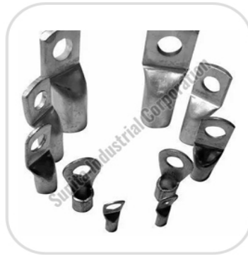
Stainless Steel Cable Sockets