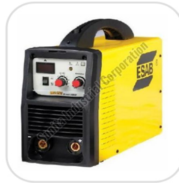
Esab Welding Machine