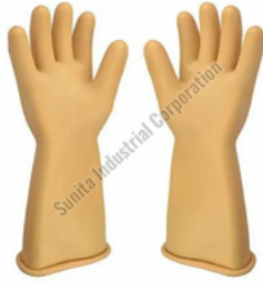
Electrical Safety Glove