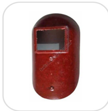
Welding Hand Shield