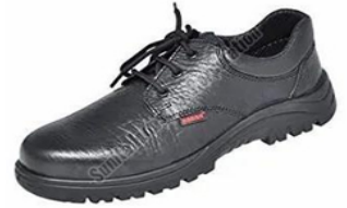
Karam Safety Shoes