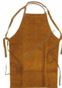
Safety Leather Apron