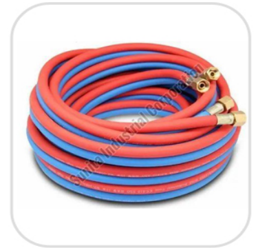
Welding Hose Pipe