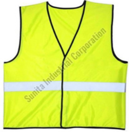
Industrial Reflective Safety Jacket