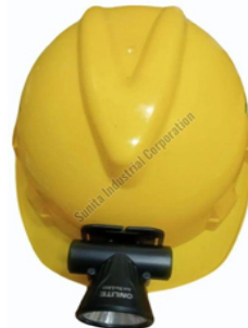
Safety Helmet With Headlamp