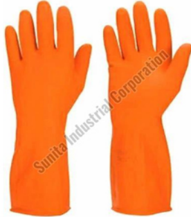
Rubber Hand Gloves