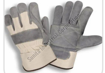
Split Canadian Double Palm Gloves