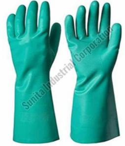
Nitrile Examination Gloves