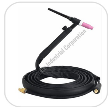
Tig Welding Torch