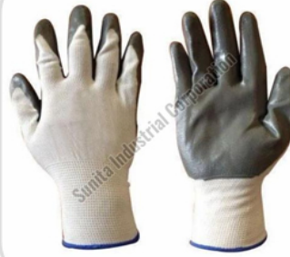
Nitrile Coated Hand Gloves