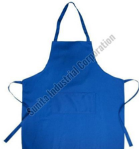
Fabric Safety Apron