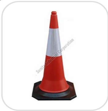
Red Plastic Traffic Safety Cone