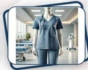
Scrub Suit (Doctor Suit)