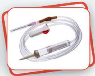
Infusion Set (IV Set)