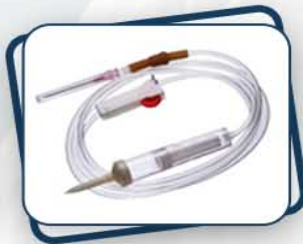
Blood Administration Set (BT Set)