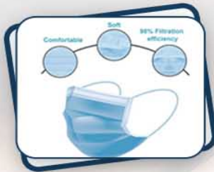
3 Ply Face Masks