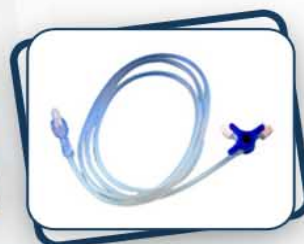
High-Pressure Monitoring Line