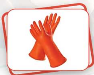
Industrial Rubber Gloves