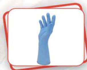
Long-Cuff Surgical Gloves