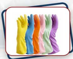
Industrial Rubber Gloves