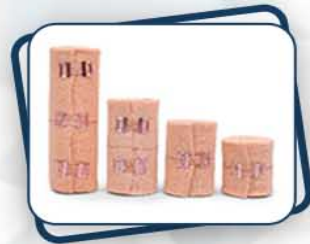
Cotton Crepe Bandages