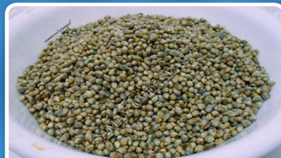
Pearl Millet Seeds