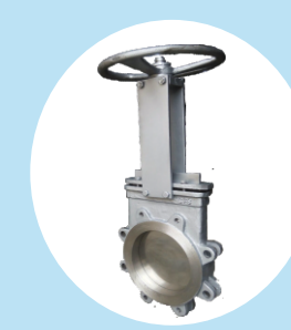
Knife Gate Valve