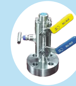
DB & B Valve