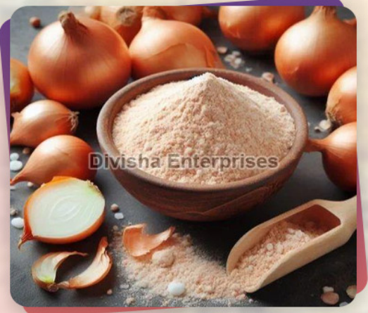
Spray Dried Pink Onion Powder