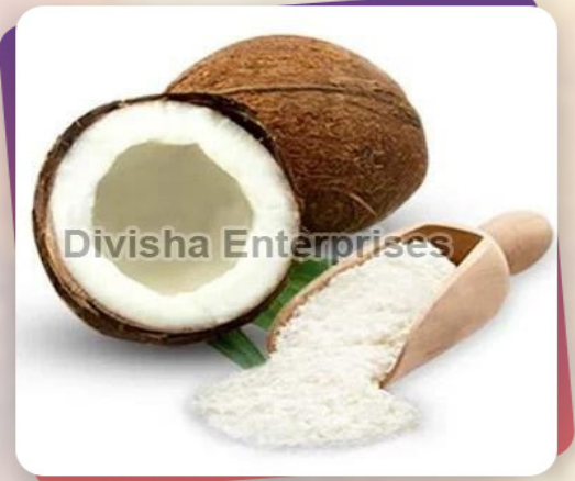
Spray Dried Coconut Powder