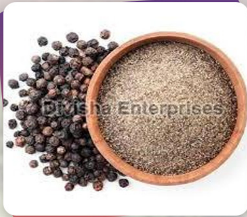
Dried Black Pepper Powder