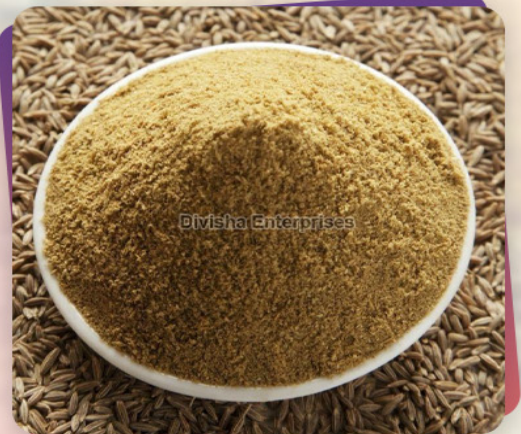
Dried Cumin Powder