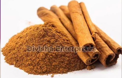
Spray Dried Dalchini Powder