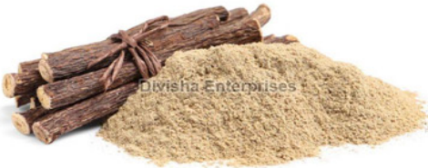
Spray Dried Mulethi Powder