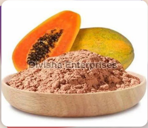
Spray Dried Papaya Powder