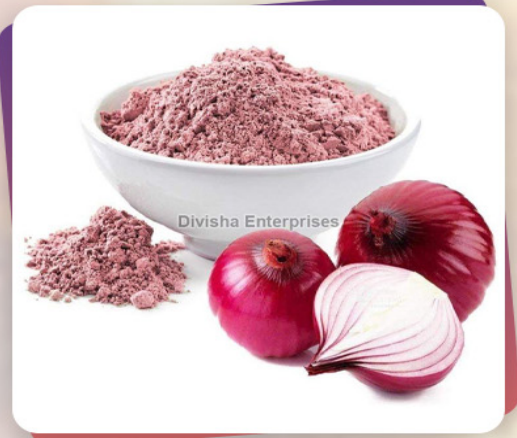
Spray Dried Red Onion Powder