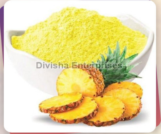
Spray Dried Pineapple Powder