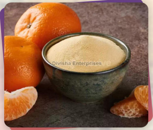
Spray Dried Orange Powder