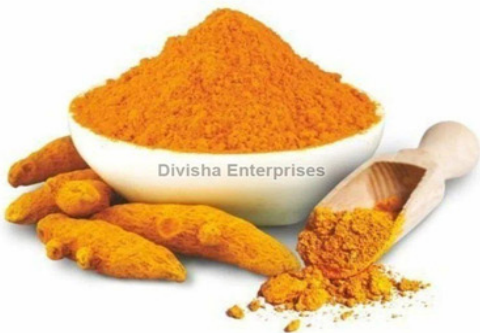
Spray Dried Turmeric Powder