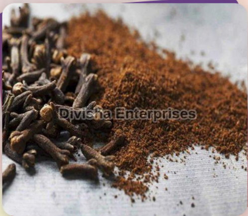
Dried Clove Powder