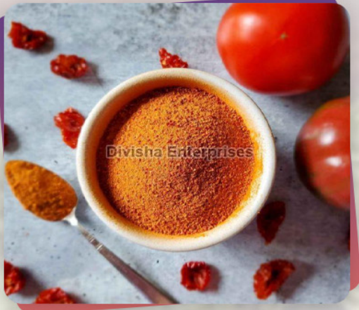
Spray Dried Tomato Powder