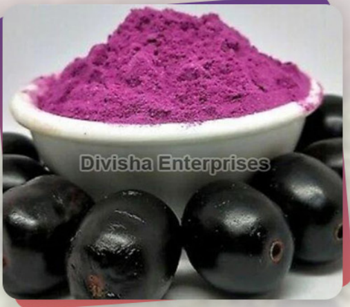
Spray Dried Jamun Powder