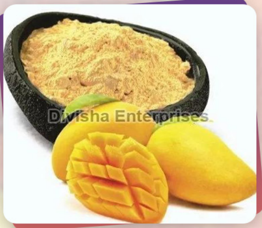
Spray Dried Mango Powder