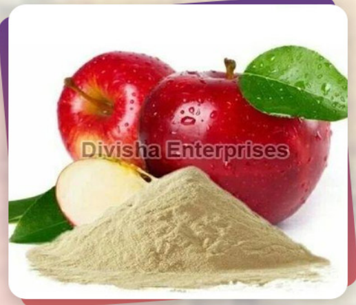
Spray Dried Apple Powder