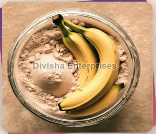
Spray Dried Banana Powder