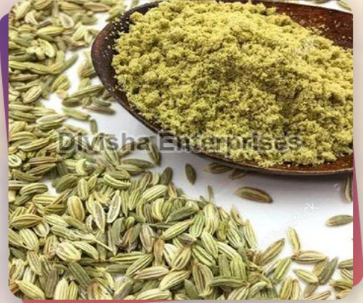
Spray Dried Green Fennel Powder