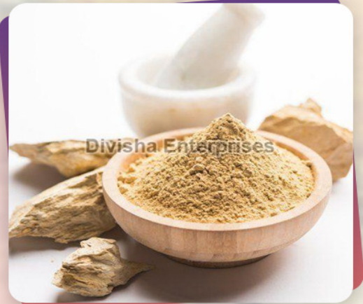
Dried Multani Mitti Powder