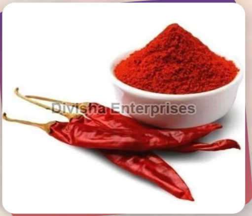
Spray Dried Red Chilli Powder