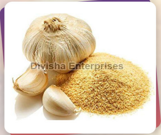
Spray Dried Garlic Powder