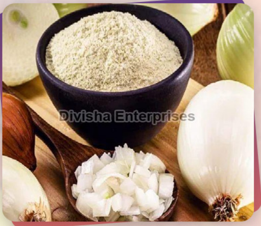
Spray Dried White Onion Powder