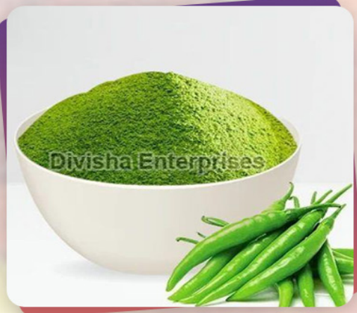
Spray Dried Green Chilli Powder