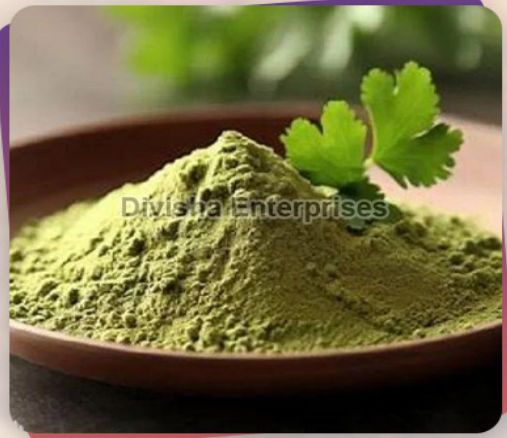
Spray Dried Coriander Powder