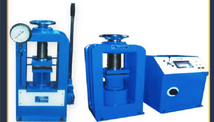
Cube Testing Machine