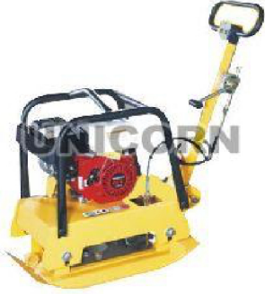
Reversible Plate Compactor