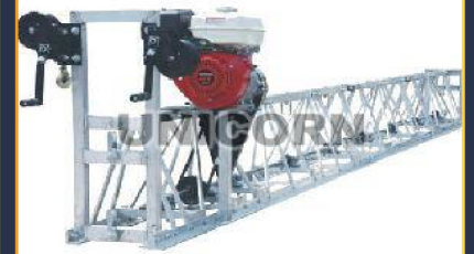
Concrete Truss Sced Machine