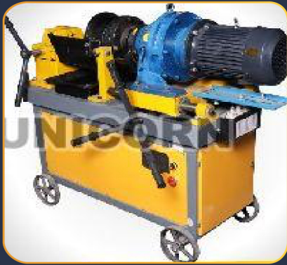
Bar Threading Machine