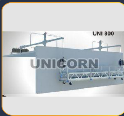
UNI 800 Suspended Platform