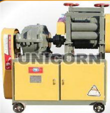
Scrap Straightening Machine