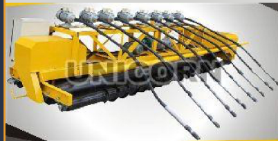
Concrete Vibrator Paver Machine