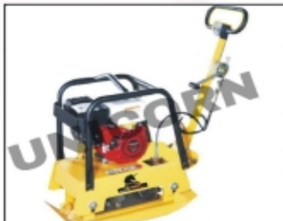
Plate Compactor Machine