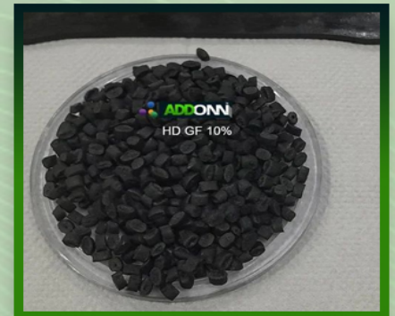
HD Plastic Granules