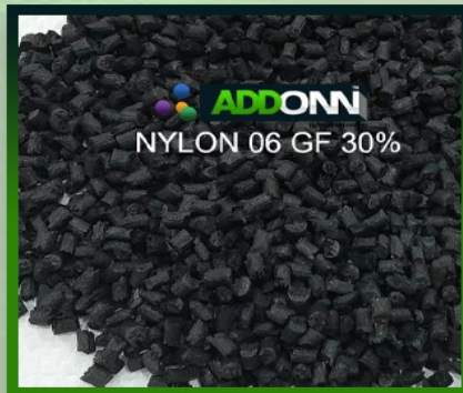
Black Nylon Glass Filled Granules