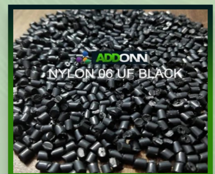
Reprocessed Nylon 6 Plain Granules