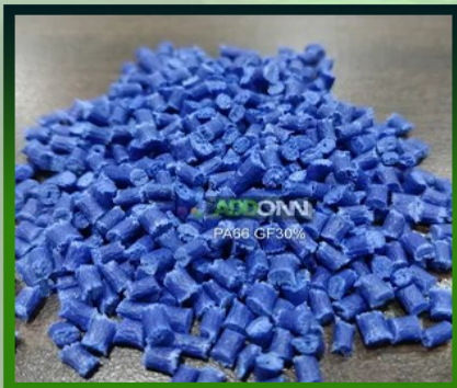
Blue Nylon 66 Granules