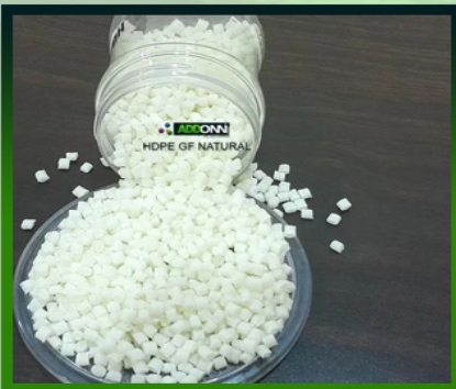
White HDPE Granules