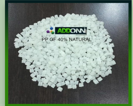
White Glass Filled Polypropylene Granules