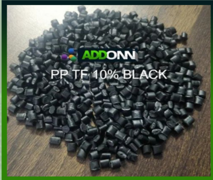
Polypropylene Compound Granules