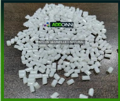
White Nylon 66 Granules