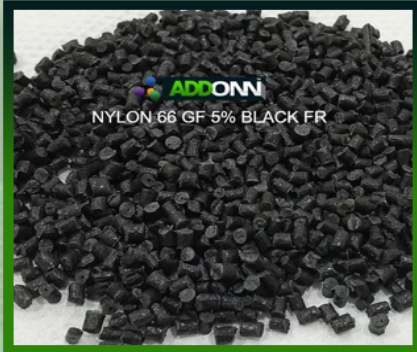
5% Nylon 66 Glass Compound Granules