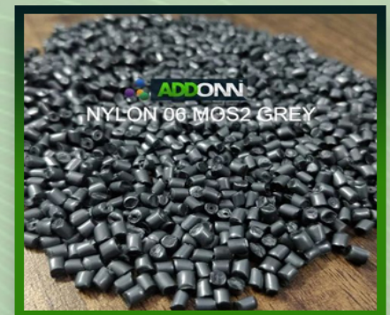
Nylon MOS2 Filled Granules