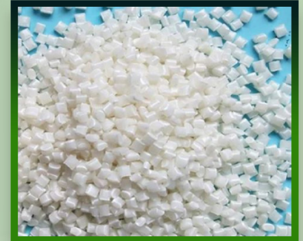
White PC PBT Alloy Granules