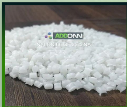
White Nylon Glass Filled Granules