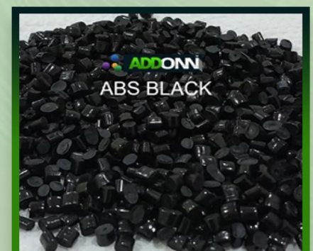
Black ABS Plastic Granules