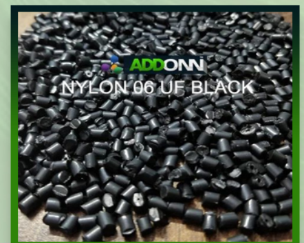
Nylon 6 Plain FR Fire Retardant Grades Granules