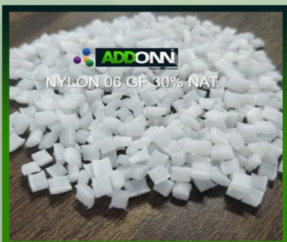
White 30% Nylon 6 Glass Filled Granules