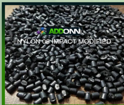
Nylon 6 Impact Modified Grades Granules