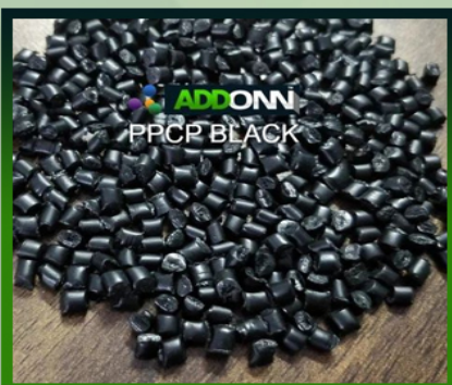
Black PPCP Granules