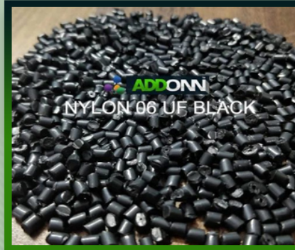
Black Nylon 6 Heat Stabilized Grades Granules