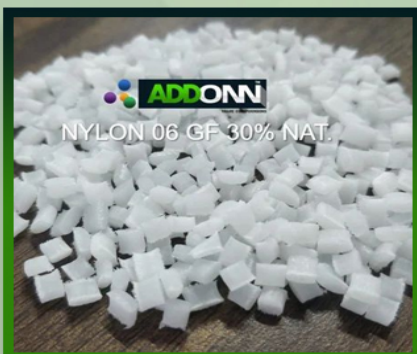
Nylon 6 Glass Filled Compound Granules