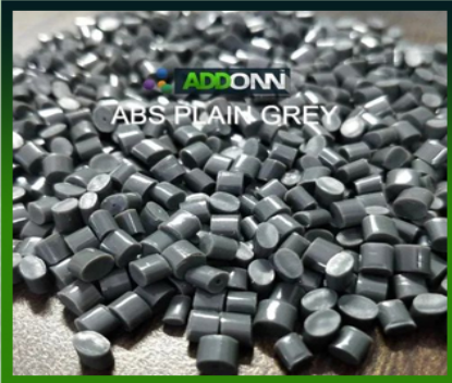
Reprocessed ABS Granules