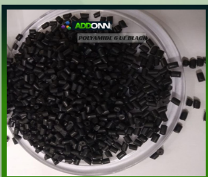
NYLON PLAIN BLACK GRANULE