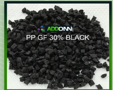
Glass Filled Polypropylene Compound