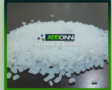
Nylon 66 Heat Stabilized Grade Granules