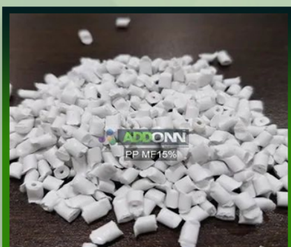
PP Talc Mineral Calcium Filled Compound