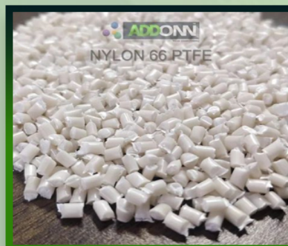
Nylon 66 PTFE Granules