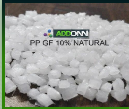
Polypropylene Glass Filled Granules