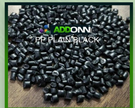
Black PP Granules