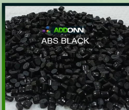
Black ABS Glass Filled Granules