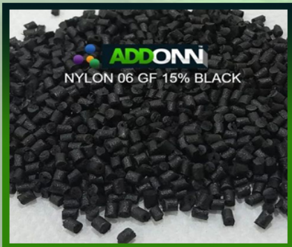
Black 15% Nylon 6 Glass Filled Granules