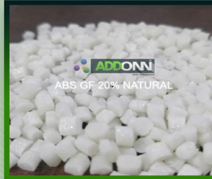
White ABS Glass Filled Granules