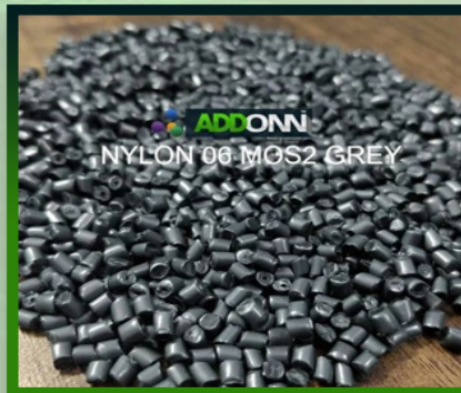
MOS2 Nylon 6 Granules