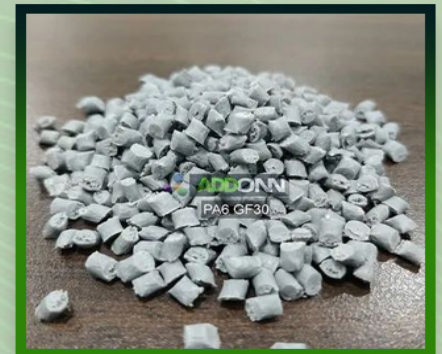
Nylon 6 Glass Filled Plastic Granules