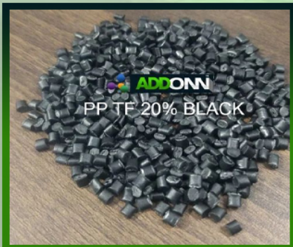
20% PP Talc Filled Compound