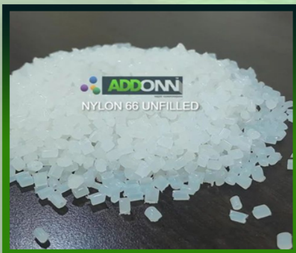
Nylon 66 Hydrolysis Resistant Grades Granules