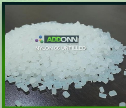
Nylon 66 Unfilled Natural Granules