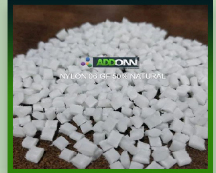
50% Nylon 06 Glass Filled Granules