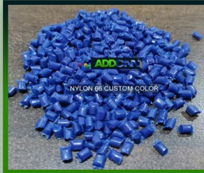
Nylon 66 FR Flame Retardant Grades Granules