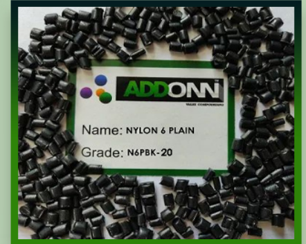
Black Reprocessed Nylon 6 Plain Granules