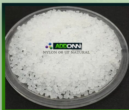
PA6 Nylon Granules