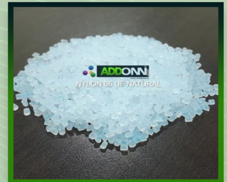
Natural Plain Nylon 6 Granules