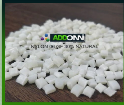
30% Recycled Nylon Glass Filled Granules