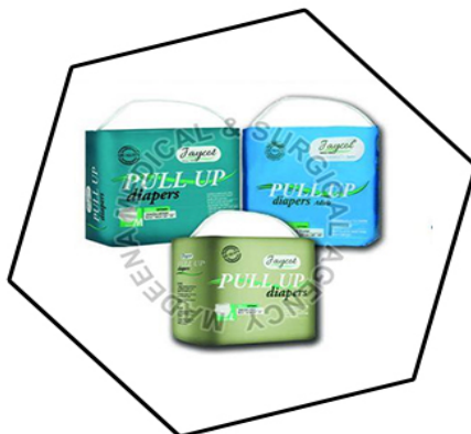
Adult Diaper Pants