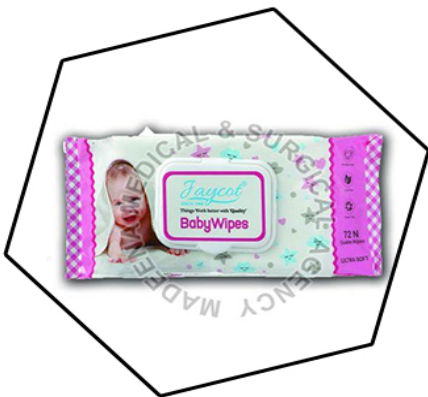
Baby Wet Wipes