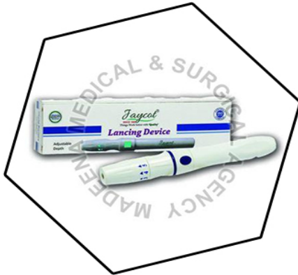
Blood Lancing Device