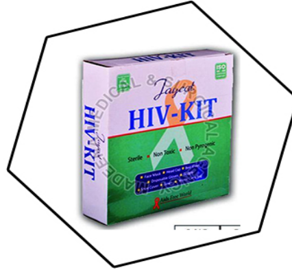
Disposable HIV Kit