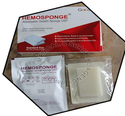
Cotton Blue Absorbable Gelatin Sponge