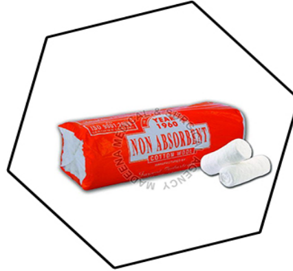
Bleached Non Absorbent Cotton Wool