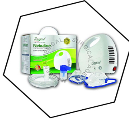
Classic Nebulizer Kit