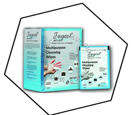
Multi Purpose Cleansing Wipes