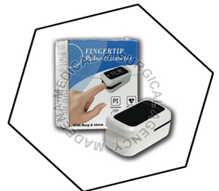
Pulse Oximeter Machine