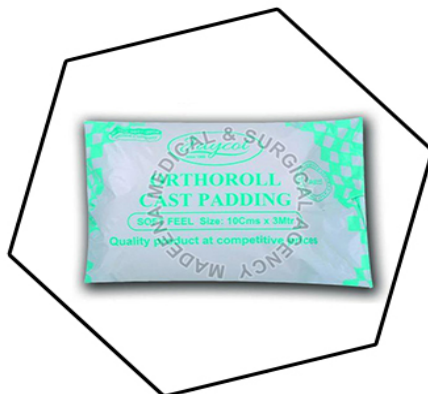
Orthopaedic Cast Padding