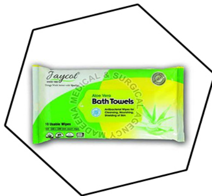
Bed Bath Towel Wipes