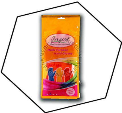
Multi Purpose Rubber Gloves