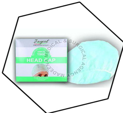
Surgeon Head Cap