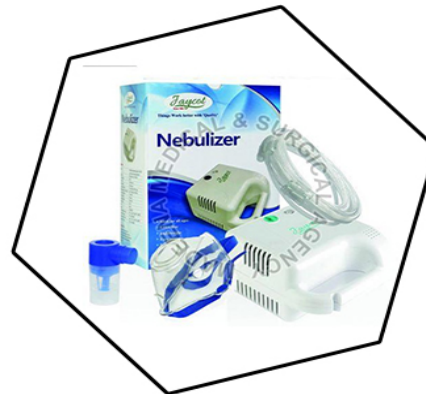
ECO Nebulizer Kit