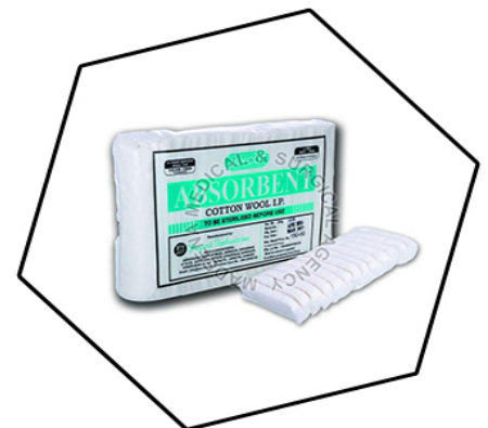
Zig Zag Absorbent Cotton Wool