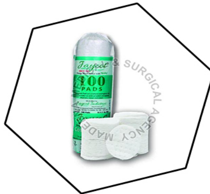
Round Cotton Pads