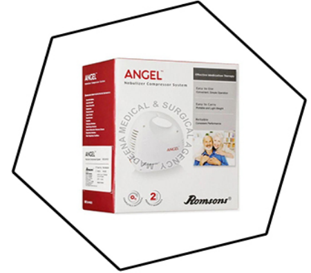
Angel Nebulizer Compressor System