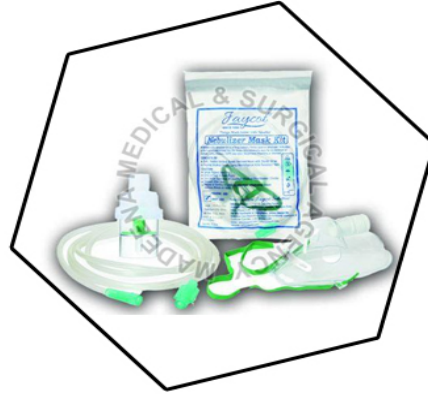
Nebulizer Mask Kit