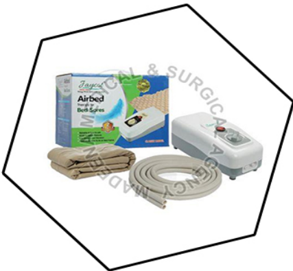
Anti Decubitus Air Mattress