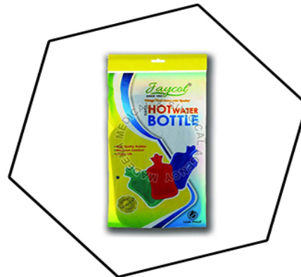
Rubber Hot Water Bottle