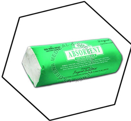
Absorbent Cotton Wool