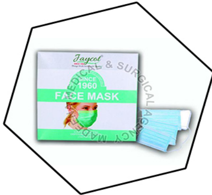
Surgical Face Mask