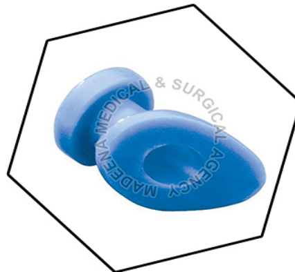
Plastic Ear Ventilation Tubes