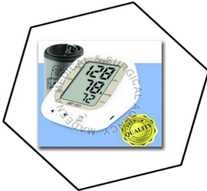
Fully Auto Digital Blood Pressure Monitor