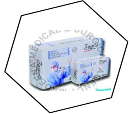
Latex Examination Gloves