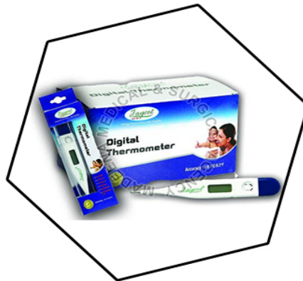
Dual Scale Digital Thermometer