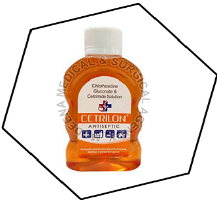
Cetrilon Antiseptic Liquid