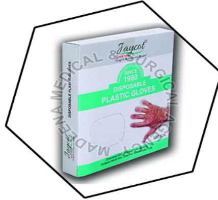
Disposable Plastic Gloves