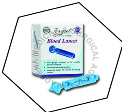
Plastic POC 31G Round Blood Lancet