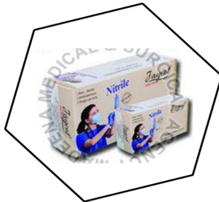
Nitrile Examination Gloves