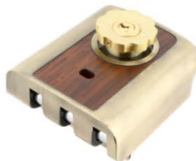
Leo 2CK (Both side key) Finish : AB, NS Double Door / Sliding Door