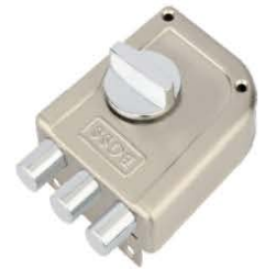
Nano Three Dead Bolt

Finish : AB, SS, NS Main Door Lock / Lockable Knob