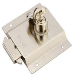
Sliding Cupboard Lock

Finish : SS Suitable for 20-38MM Panel Thickness