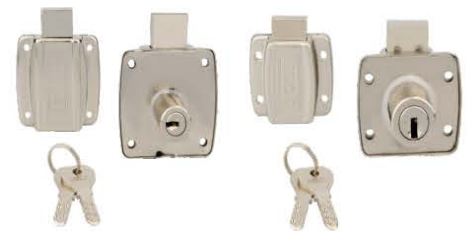
Cupboard Lock / Drawer Lock

Finish : AB, SS, NS Double / Sliding Door Lock