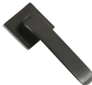
Rose Handle (Zinc) Finish : SS , AB, JB