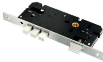
45 X 85 MM Lockbody Finish : AB, SS Mortise Lock Body Brass & Zinc