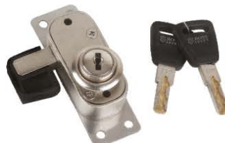
Sliding Cupboard Lock