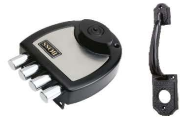
Ultra SuperBolt 2Ck With Classic Pull Handle Finish : AB, JB, SN, RG Main Door Lock