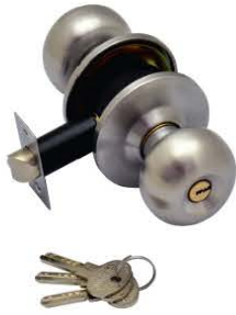
Round Cylindrical Bedroom Lock with Computer Key (SS304) Finish : SS