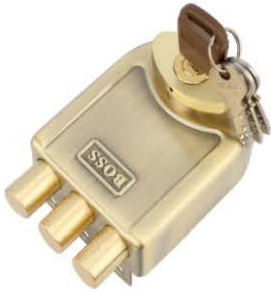
Three Dead Bolt 2CK (Both side key)

Finish : AB, SS, IV, NS Main Door Lock / Lockable Knob