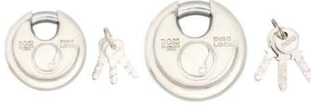
Pad Lock 70 MM / 90 MM Finish : SS Rust Proof SS 304 Body