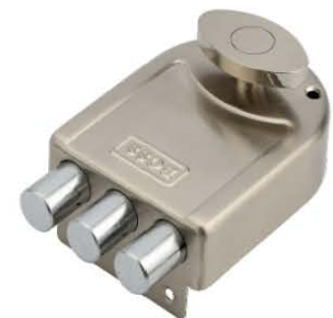
Three Dead Bolt Finish : AB, SS, IV, NS Main Door Lock