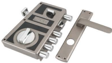
Ultra Titan Bolt 1ck Finish : JB,UT,PS Main Door Lock Brass Dead Bolt