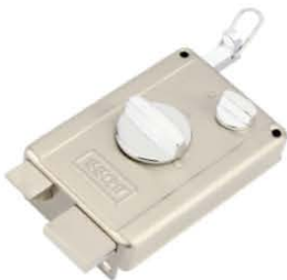
Night Latch with Dimple Key