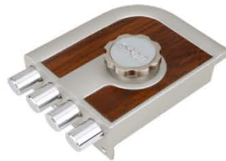
Tetrabolt Finish : AB, NS Main Door Lock Brass Dead Bol