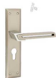
Plate Handle (Zinc) Finish : SN, AB, BL, RG, JB