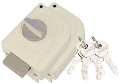
Rim Dead Bolt

Finish : AB, SS, IV Main Door Lock / Rim Latch