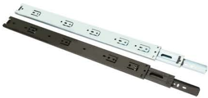
TeleScopic Drawer Channels