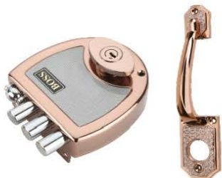
Roller Latch Ultra SuperBolt 2CK With Classic Pull Handle Finish : AB, JB, SN, RG Main Door Lock