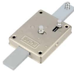
3/4/6 Stroke InterLock