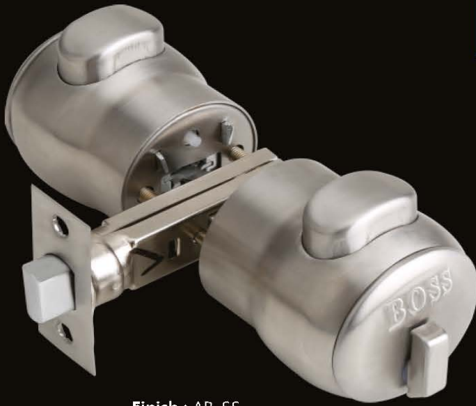
Finish : AB, SS