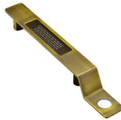
Italian Pull Handle (Main Door) With Night Latch Cylinder Hole Finish : AB, SS,SN