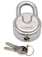
Long Shackle Padlock Finish : SS Rust Proof SS 304 Body