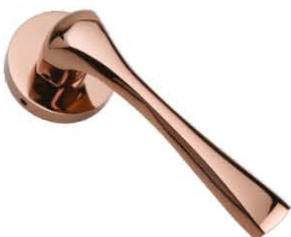
Rose Handle (Brass) Finish : SN, AB, BL, RG, JB