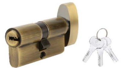
One Side Knob One Side Key Finish : AB, SS Europrofile Cylinder