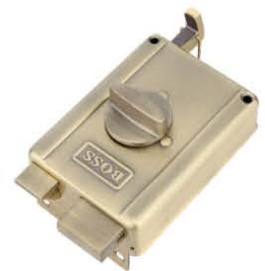
Mini Night Latch

Finish : AB, SS, IV Main Door Lock / Rim Latch