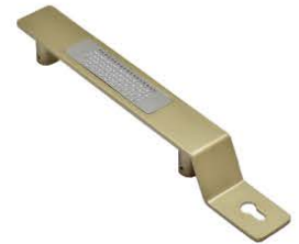
Italian Pull Handle (Main Door) With Mortise Cylinder Hole Finish : AB, SS,SN