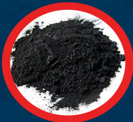
Bamboo Activated Charcoal Powder