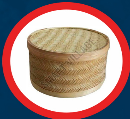
Plain Bamboo Round Box