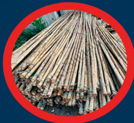
RAW BAMBOO POLES