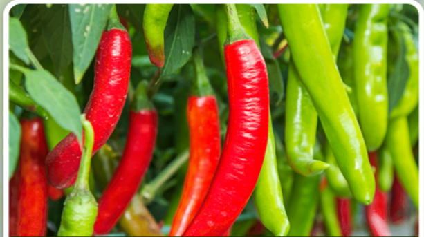
Fresh Green Chilli