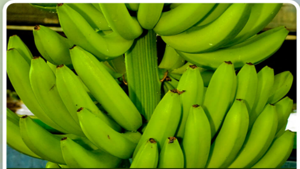
Fresh Green Banana

Type : Fresh Fiber : 3.1 Grams. Potassium : 12% of the RDI. Vitamin B6 : 20% of the RDI. Vitamin C : 17% of the RDI. Copper : 5% of the RDI. Manganese : 15% of the RDI.