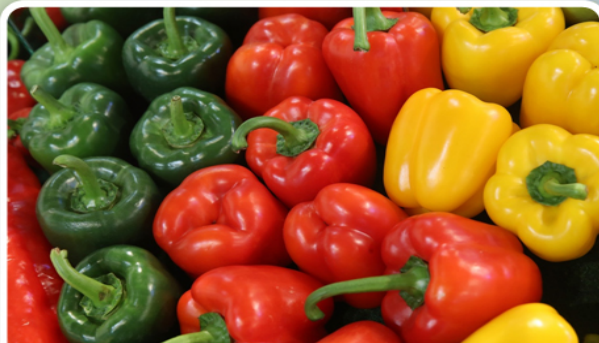
Fresh Green Capsicum