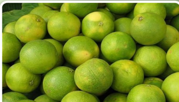
Fresh Sweet Lime