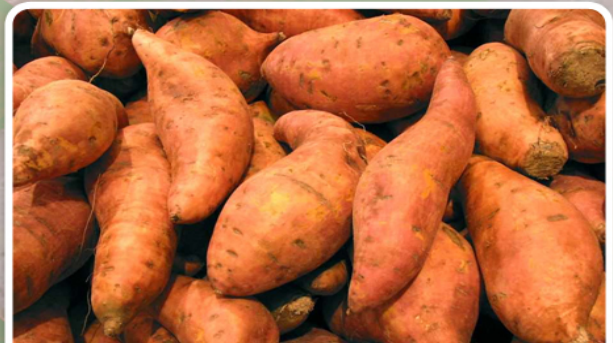
Fresh Sweet Potato