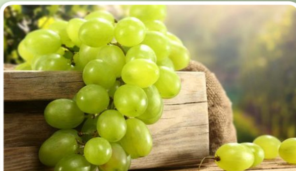
Fresh Green Grapes

Type : Fresh Cultivation Type : Natural Shelf Life : 3-5days Feature : Good For Health, Pesticide Free Calories : 67/100gms Total Fat : 0.4 g/100gms Sodium : 2 mg/100gms Potassium : 191 mg/100gms Total Carbohydrate : 17 g /100gms Protein : 0.6 g/100gms