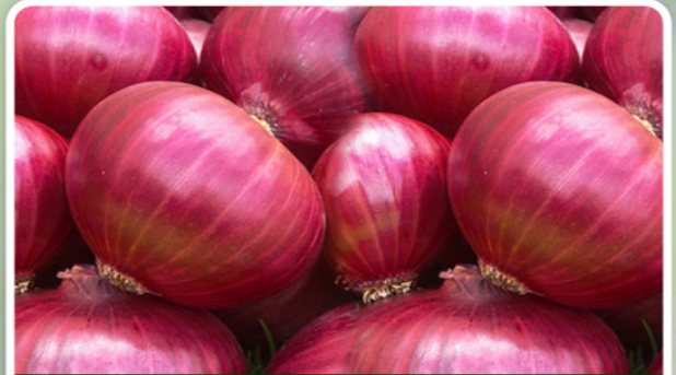
Fresh Red Onion