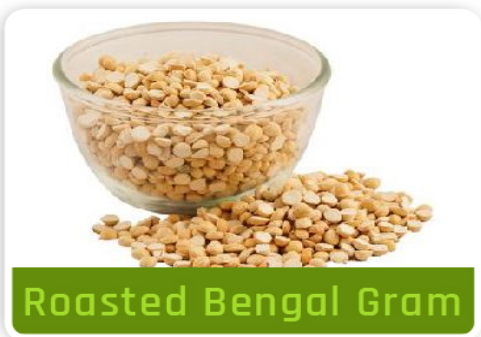
Roasted Bengal Gram