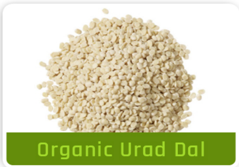
Organic Urad Dal