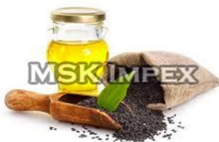
Organic Gingelly Oil