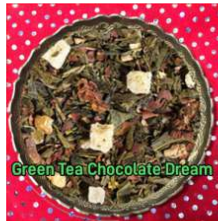
Green Tea Chocolate Dream