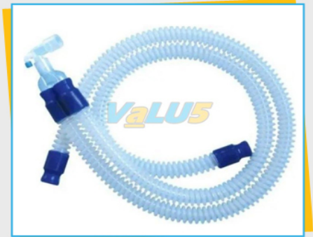
Ventilator Circuit Plain