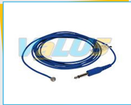
Skin Temperature Probe