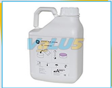
Amsorb Plus Jerry Can