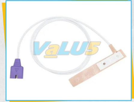
Disposable SPO2 Probe