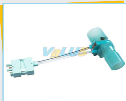
ABS Anesthesia Flow Sensor