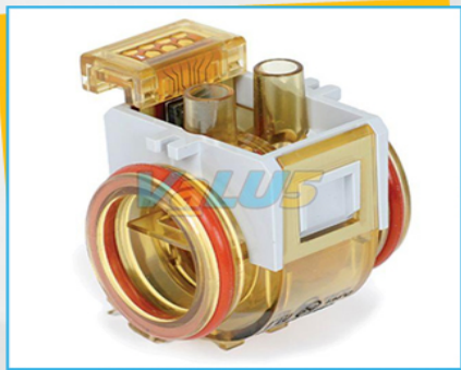
Carestation Anesthesia Flow Sensor