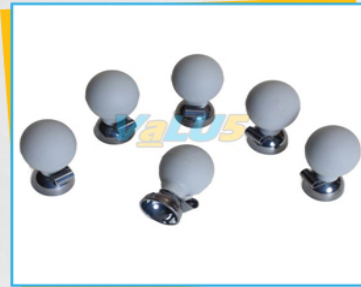
Value Bulb Electrode