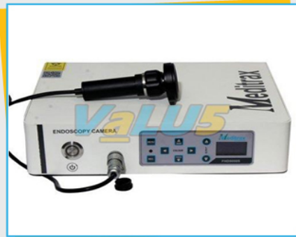
Surgical Endoscopy Camera