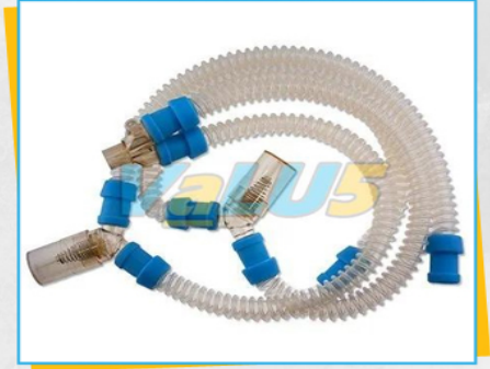
Reusable Anesthesia Circuit