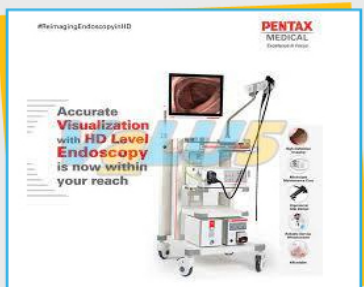
Pentax Endoscopy Camera System