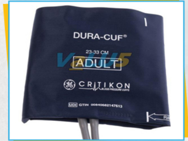
Critikon Dura-Cuf Blood Pressure Cuff