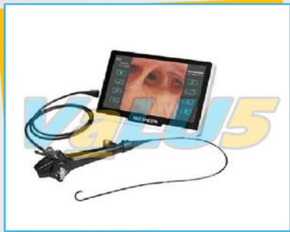
Flexible Video Bronchoscope