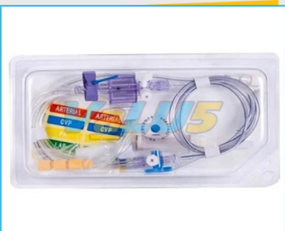
Disposable IBP Transducer Kit