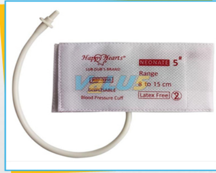
Disposable BP Cuff Neonatal