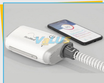
ResMed CPAP Machine