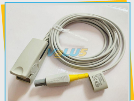
Reusable SPO2 Sensor