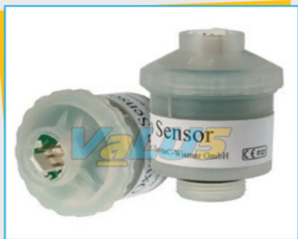
Ventilator Oxygen Sensor