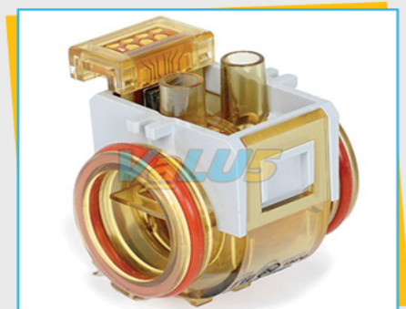
Carestation Anesthesia Flow Sensor