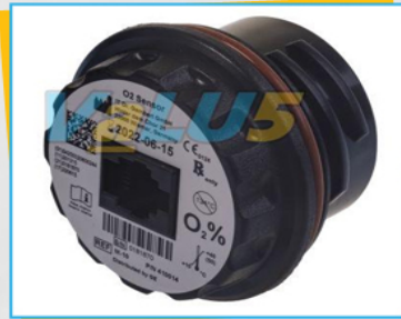
O2 Sensor without Adaptor