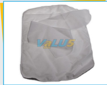
BiliSoft Pad Cover