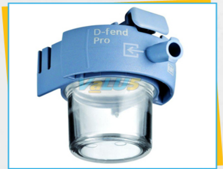
D-Fend Pro Water Trap