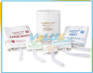
Critikon Classic-Cuf Blood Pressure Cuff