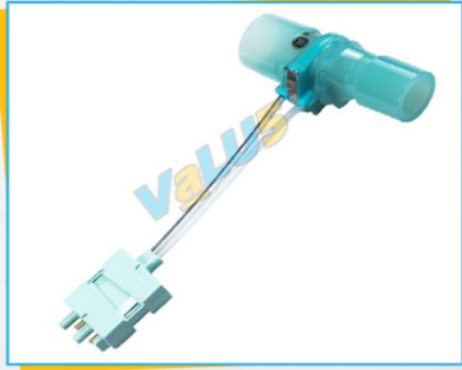
ABS Anesthesia Flow Sensor