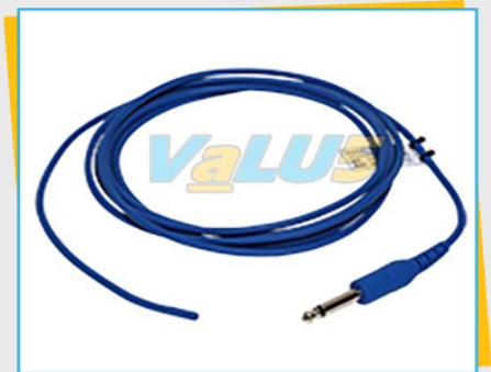
Adult Temperature Probe