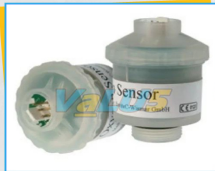
Ventilator Oxygen Sensor