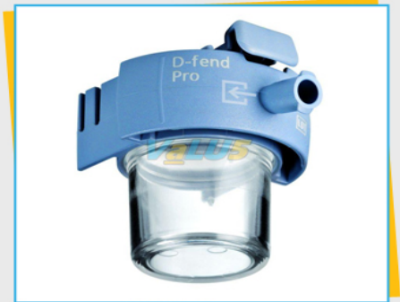
D-Fend Pro Water Trap