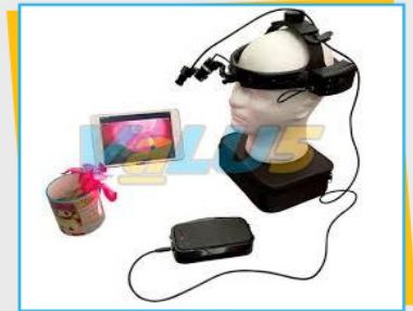
Surgical Video Camera