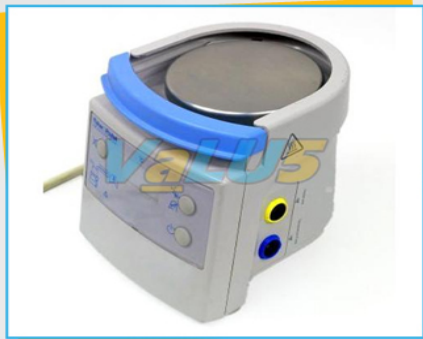
Humidifier for Ventilator