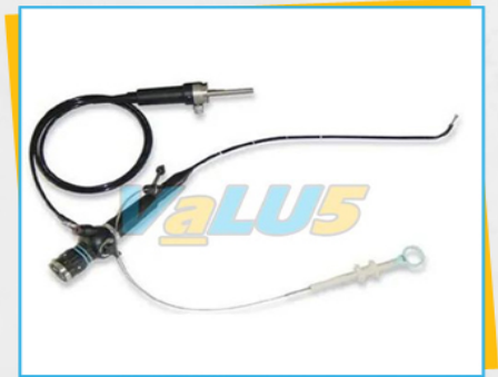
Fiber Optic Gastroscope