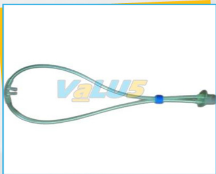
Neonatal Curved Prong Ram Cannula Pediatric