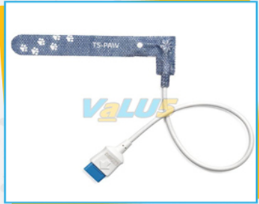
Pediatric Adhesive Wrap Sensor