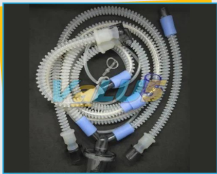
Reusable HFO Circuit