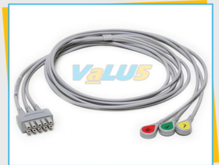
Grouped ECG Leadwire Set