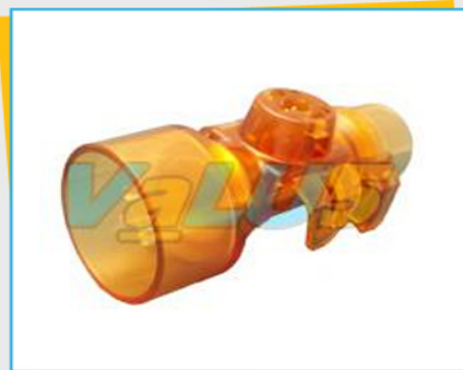
XDCR Flow Sensor