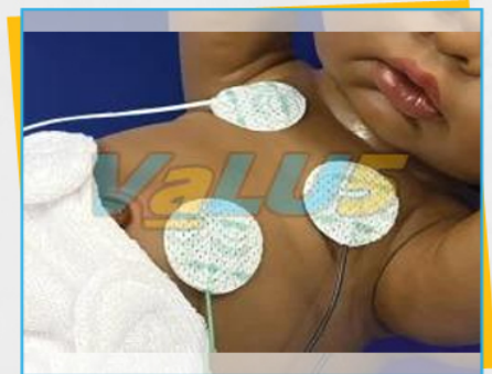
Radiolucent Neolead ECG Electrode