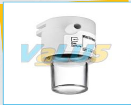
D-Fend Mini Water Trap