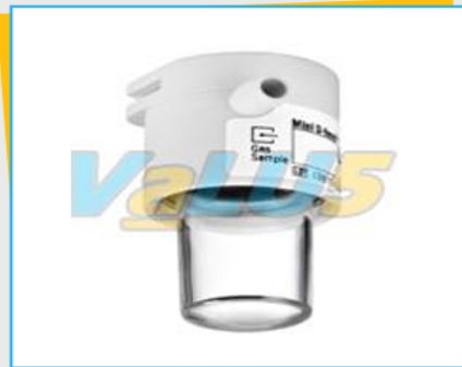
D-Fend Mini Water Trap