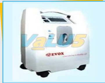
Evox Oxygen Concentrator