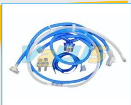
Wire Neonatal Ventilator Circuit