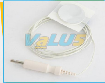
Lullaby Patient Probe