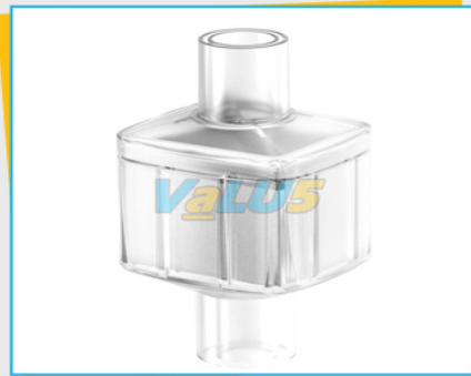
Inspiratory Safety Guard