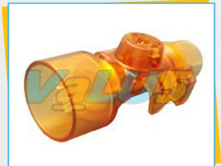
XDCR Flow Sensor