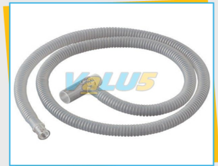
T Piece Resuscitator Circuit