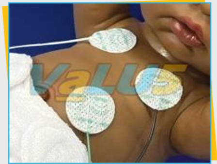
Radiolucent Neolead ECG Electrode