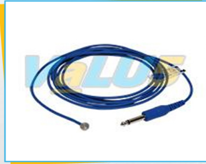
Skin Temperature Probe