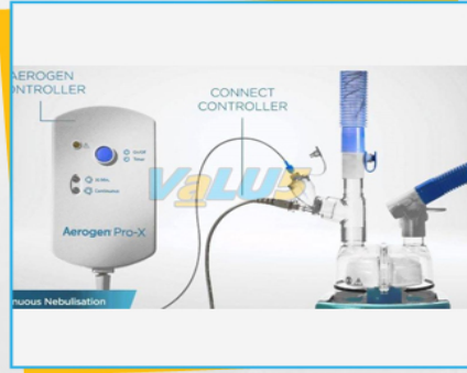
Aerogen Nebulizer Kit