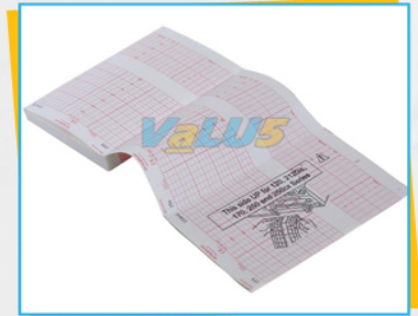
Fetal Monitor Paper