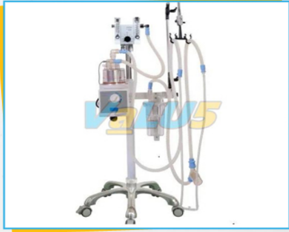
Bubble CPAP System