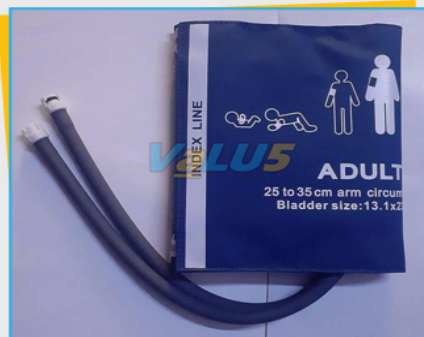
Double Tube NIBP Cuff