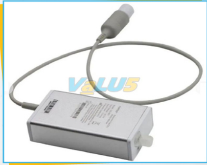
Sidestream ETCO2 Module