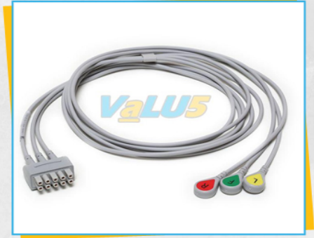
Grouped ECG Leadwire Set