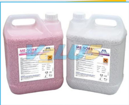
Sodalime CO2 Absorbent