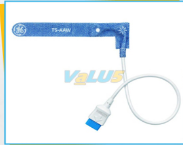
Adult Adhesive Wrap Sensor