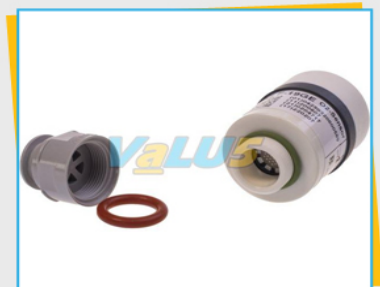
O2 Sensor with Adaptor