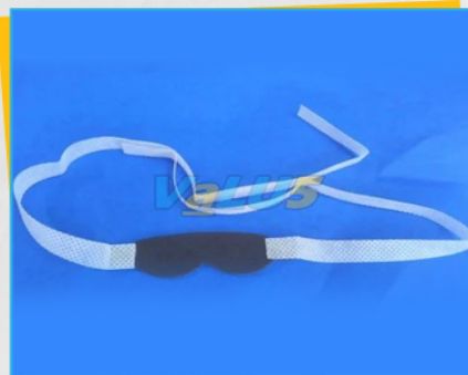
Non Woven Neonatal Phototherapy Goggles