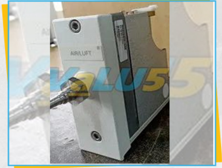
Air Module for Maquet Ventilator