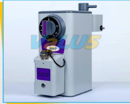
Isoflurane Anesthetic Vaporizer