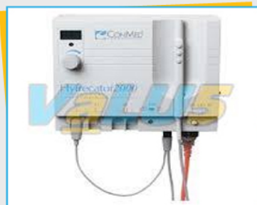
Hyfrecator Electrosurgical Unit