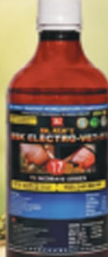
DR. BSK ELECTRO VET-17 INCREASE UDDER