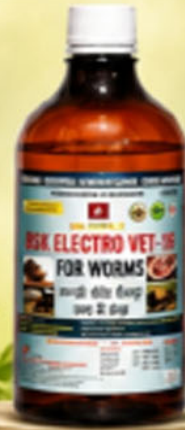
DR. BSK ELECTRO VET-16 FOR FOR WORMS