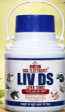
DR. BSK LIV DS FOR LIVER TONIC