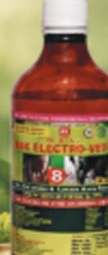
DR. BSK ELECTRO VET-8 FIBROSIS & LUMPS