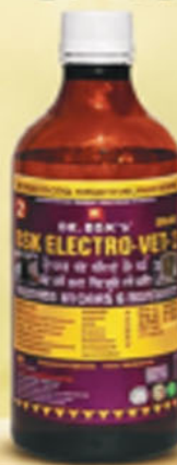
DR. BSK ELECTRO VET-2 FOR ANESTRUS