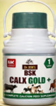
DR. BSK CALX GOLD + CALCIUM SUPPORT