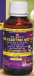
DR. BSK ELECTRO VET-S2 FOR REPEAT BREEDING