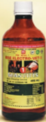
DR. BSK ELECTRO VET-1 FOR MASTITIS