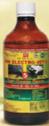
DR. BSK ELECTRO VET-5 FIVER CARE