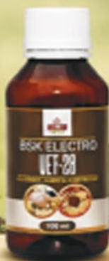
DR. BSK ELECTRO VET-28 FOR UDDER HARDER & CYSTO RELIEF