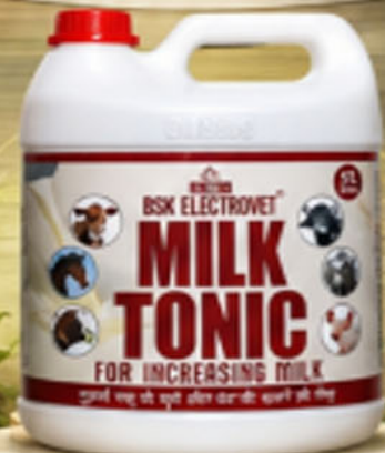
DR. BSK MILK TONIC FOR INCREASING MILK