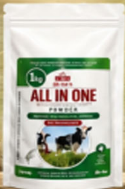
DR. BSK ALL IN ONE COMPLETE MINERAL MIXTURE