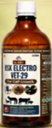
DR. BSK ELECTRO VET-29 FOR CALF GROWTH