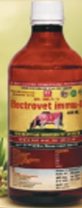
DR. BSK ELECTRO VET-26 IMMUNITY BOOSTER