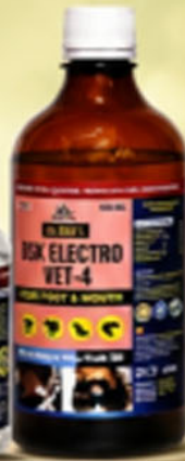
DR. BSK ELECTRO VET-4 FOR FOOT & MOUTH