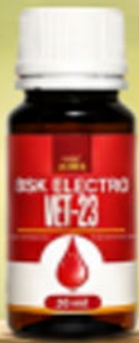
DR. BSK ELECTRO VET-23 FOR BLOOD STOP