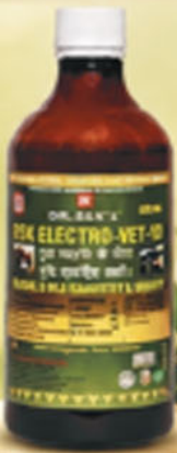
DR. BSK ELECTRO VET-10 INCREASE MILK