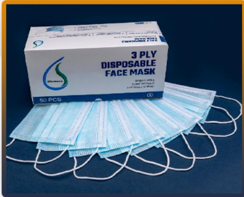
3ply Disposable face mask