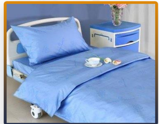
Disposable Bedsheet and Pillow Cover