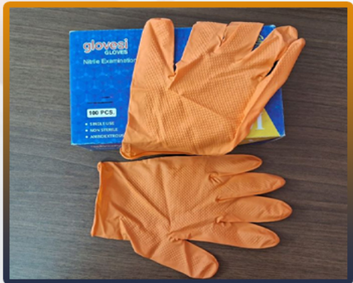
latex coated gloves