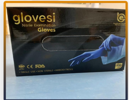
Nitrile Exam Gloves