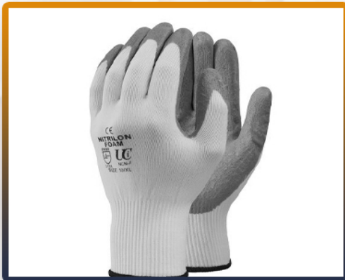
Nitrile Coted Hand Gloves