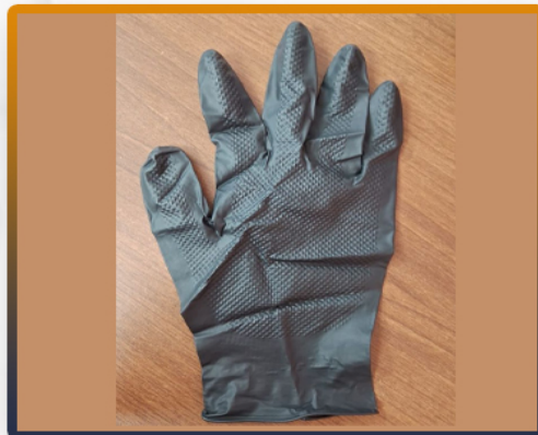
Diamond Texture Gloves