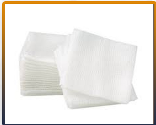
STERILE GAUZE SWAB