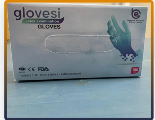
LATEX EXAMINATION POWDER FREE GLOVES