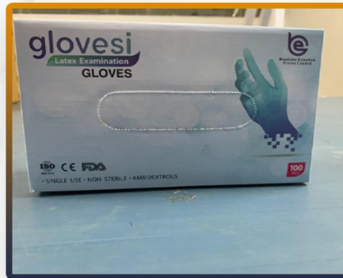
LATEX EXAMINATION POWDERED GLOVES