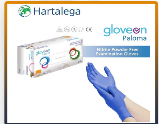
12 Inches Nitrile Gloves