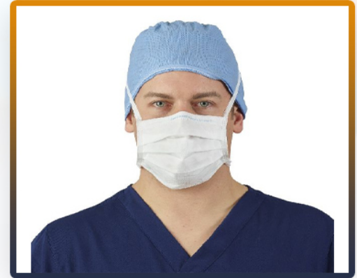
DISPOSABLE 3PLY TIE EARLOOP FACE MASK