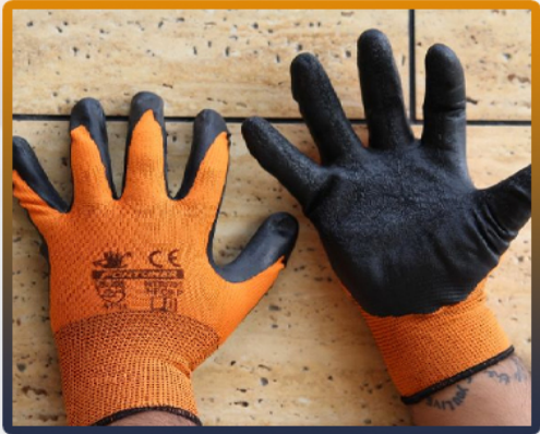
latex coated gloves