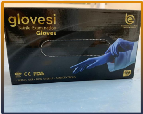
BLACK NITRILE EXAMINATION GLOVES