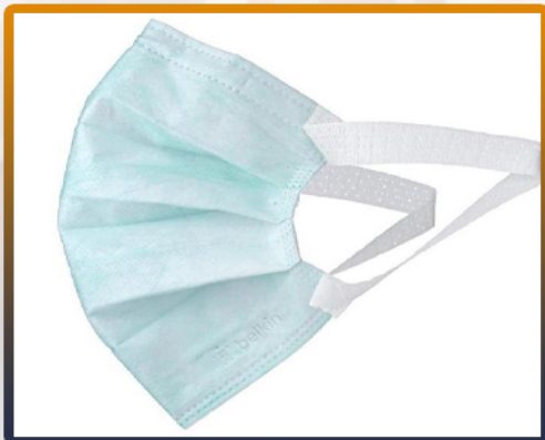
Pull Out Face Mask