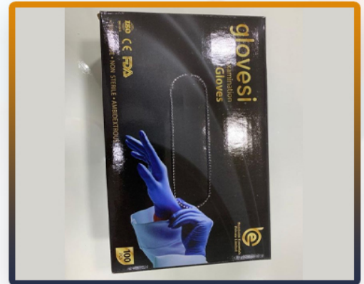
BLUE DIAMOND TEXTURED NITRILE