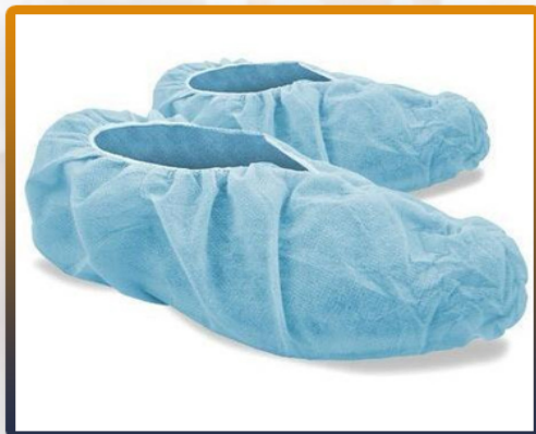
Non Woven Shoe Cover