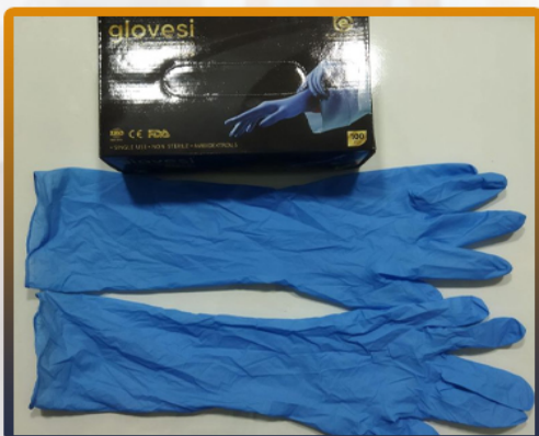
Elbow Length Nitrile Gloves