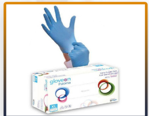
Gloveon Nitrile Gloves