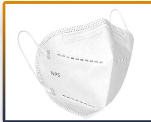
N95 Surgical Face Mask