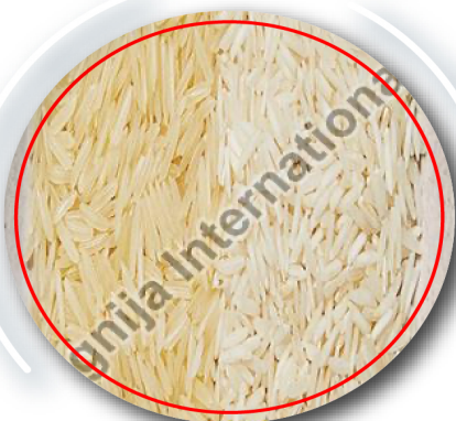
1121 Basmati Rice