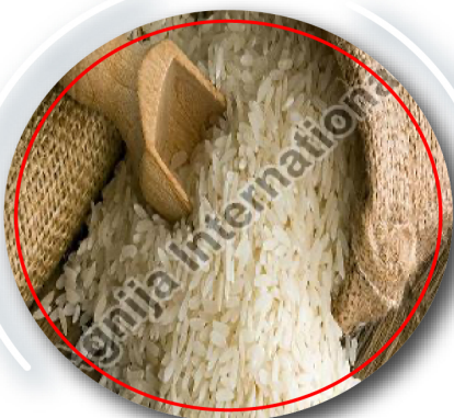
Sharbati Basmati Rice