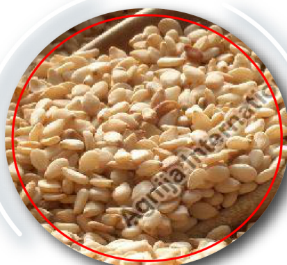
Natural White Sesame Seeds