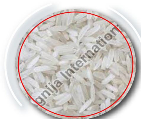
IR 64 Non Basmati Rice