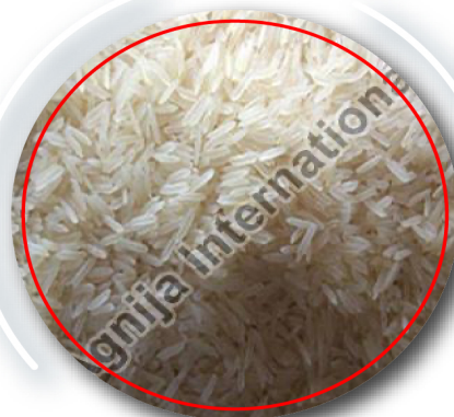
PR 11 Non Basmati Rice