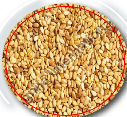
Roasted Sesame Seeds