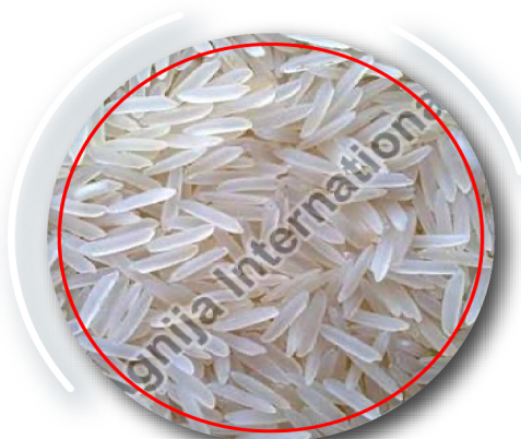
IR 8 Rice