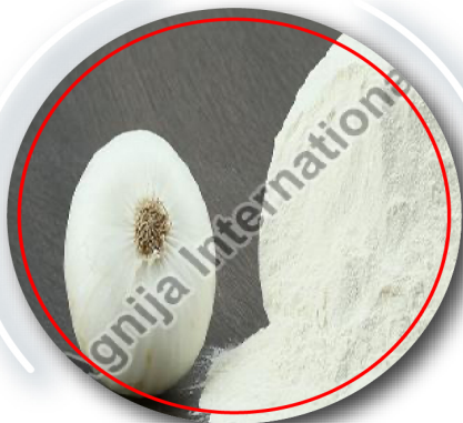
Dehydrated White Onion Powder