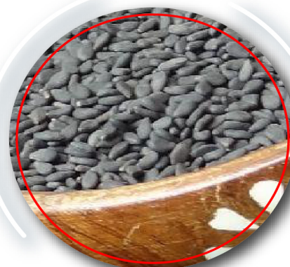
Black Sesame Seeds