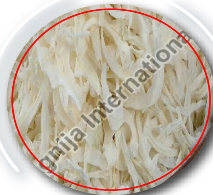
Dehydrated White Onion Flakes