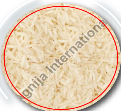
Sugandha Basmati Rice