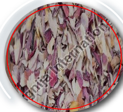
Dehydrated Red Onion Chopped