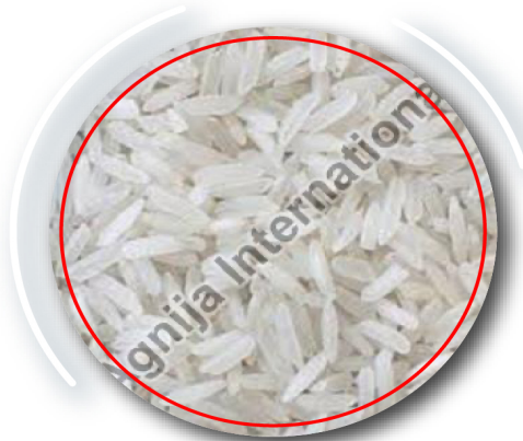
IR 36 Non Basmati Rice