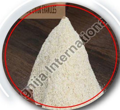
Dehydrated White Onion Granules