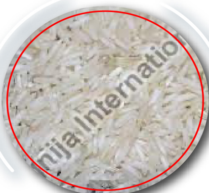
PR 14 Non Basmati Rice