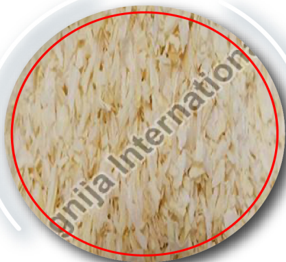
Dehydrated White Onion Chopped