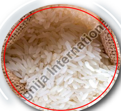
Sona Masoori Non Basmati Rice