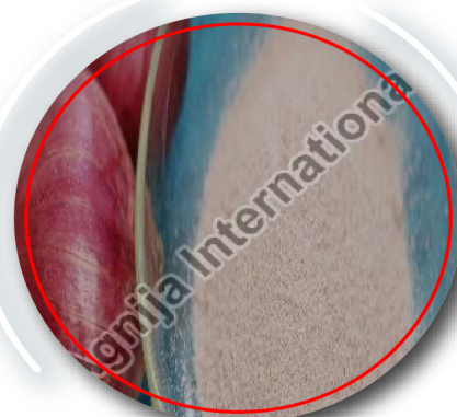
Dehydrated Red Onion Powder