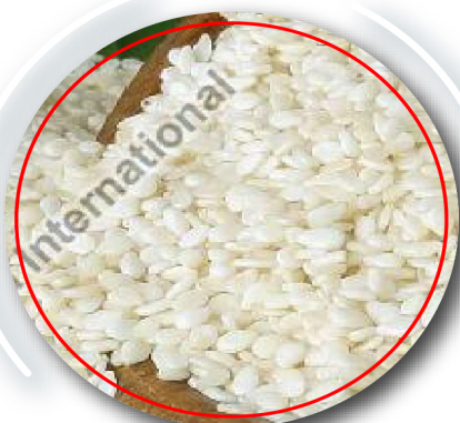
Hulled Sesame Seeds