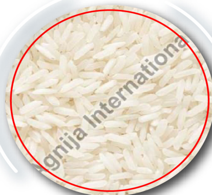
Pusa Basmati Rice