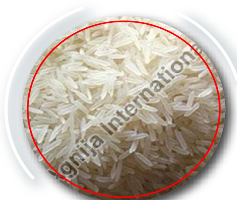
Jeera Samba Rice