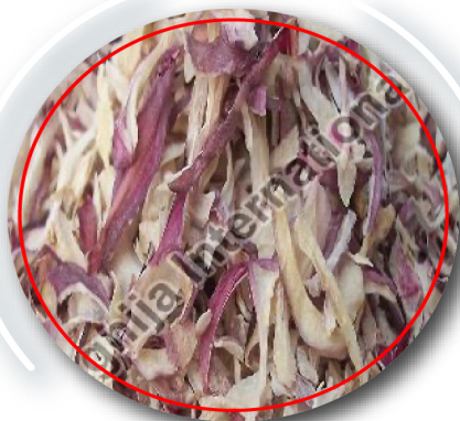
Dehydrated Red Onion Flakes