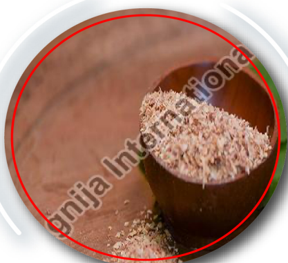
Dehydrated Red Onion Granules