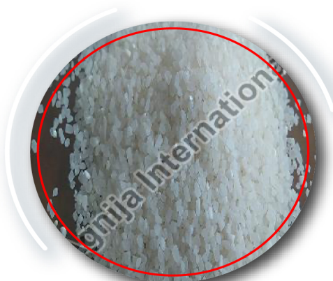
100% Broken Rice