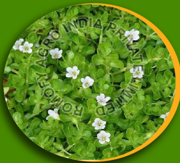
Bacopa Monnieri Leaves