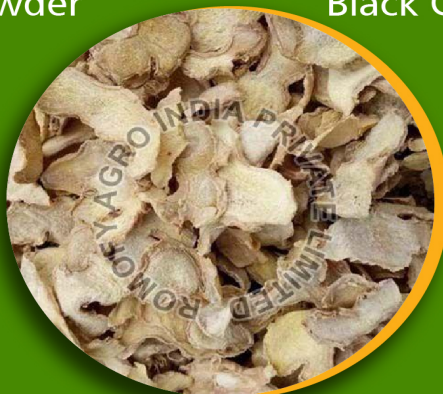
Dried Ginger Slice