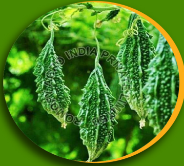
Fresh Bitter Gourd