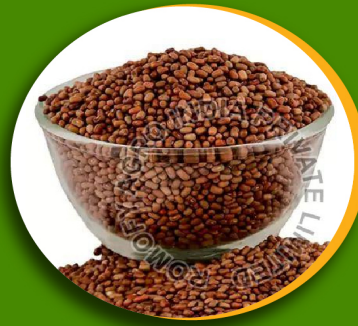
Brown Moth Dal