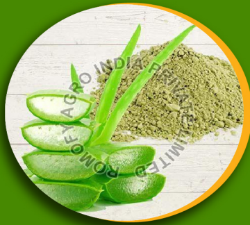
Aloe Vera Powder