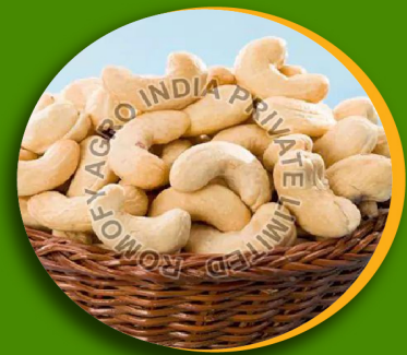
Whole Cashew Nuts