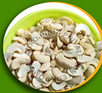
Split Cashew Nuts