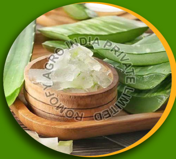
Aloe Vera Gel