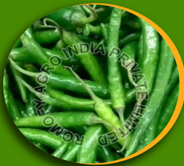
Fresh Green Chilli