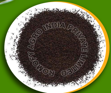
Herbal CTC Tea

Manufacturer, Exporter, Supplier India FSSAI Certified Black