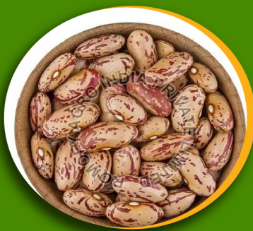
Chitra Kidney Beans