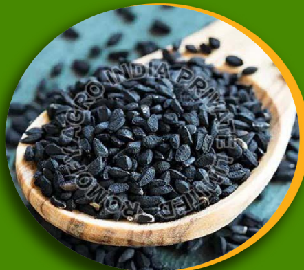
Black Cumin Seeds