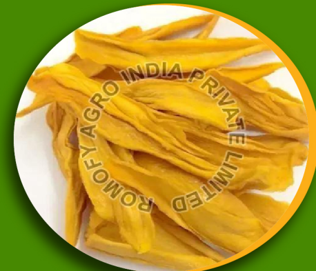
Dried Mango Slices