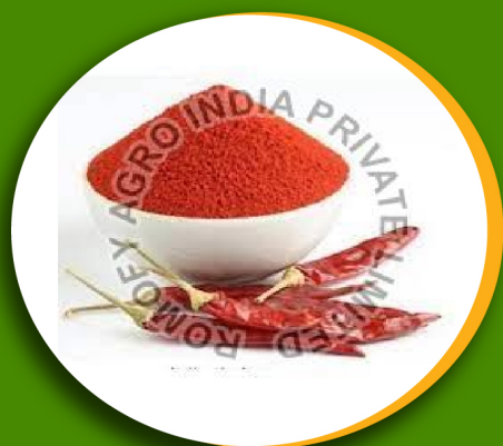
Red Chilli Powder