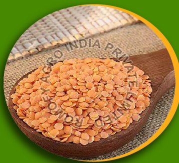
Dhuli Masoor Dal