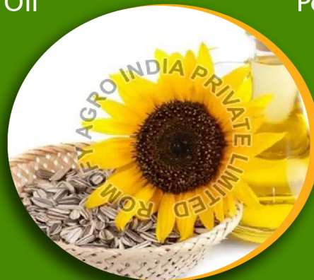
Sunflower Seed Oil