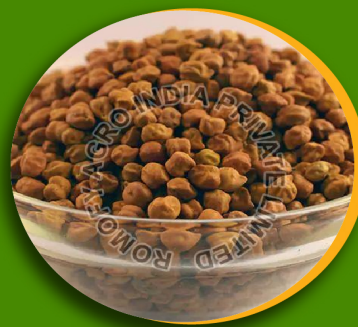
Whole Bengal Gram