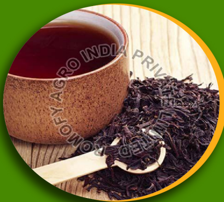
Herbal Black Tea

Business Type Country of Origin Color Storage Condition