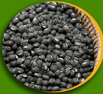
Black Whole Urad Dal