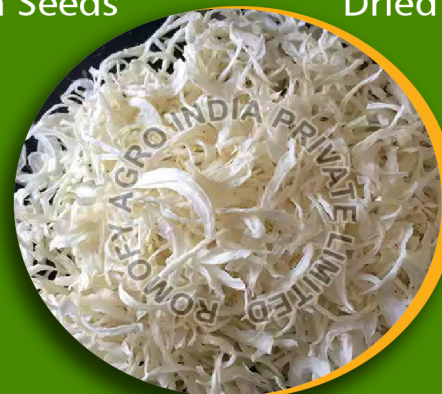
Dehydrated Onion Flakes