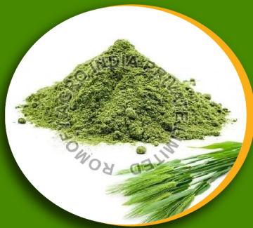
Barley Grass Powder