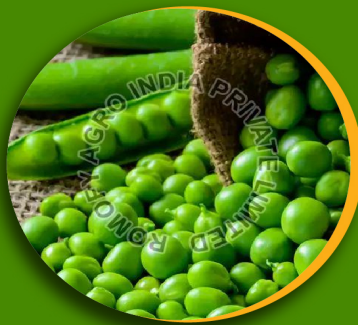
Fresh Green Peas