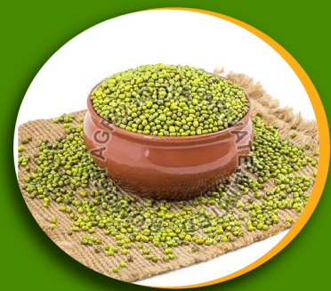
Whole Green Moong Dal