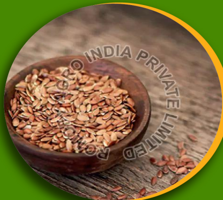
Brown Flax Seeds