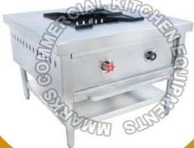
Stock Pot Stove