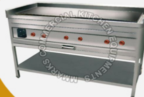
Dosa Plate Flat Top