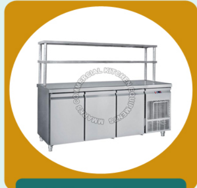
3 Door Deep Freezer