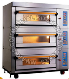
Commercial Bakery Oven