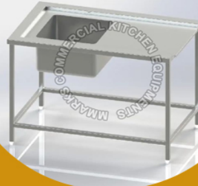
Stainless Steel Sink with Work Table