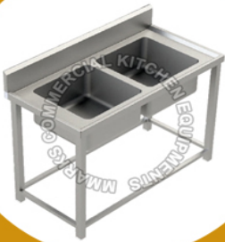
Two Sink Unit