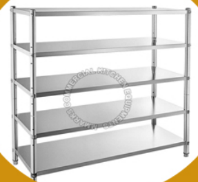
Stainless Steel Rack