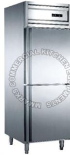
Two Door Vertical Refrigerator