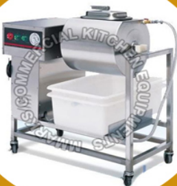
Commercial Vacuum Marinator