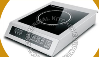
Commercial Induction Cooktop