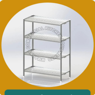
Perforated Storage Rack