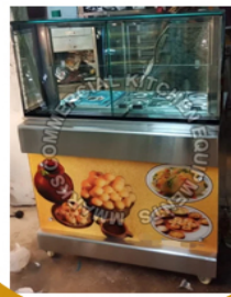
Golgappa Display Counter