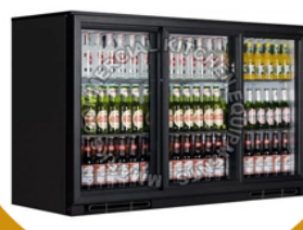
Back Bar Chiller