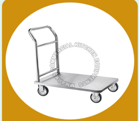
Luggage Barrow Trolley