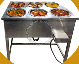
Bain Marie Counter