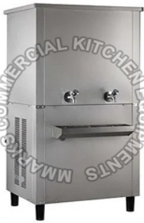
Stainless Steel Water Cooler