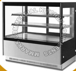
Cake Display Counter