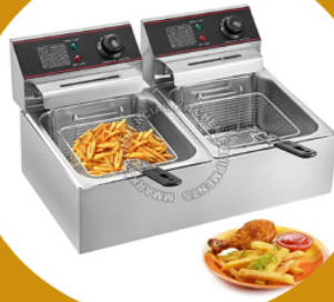
Double Deep Fat Fryer