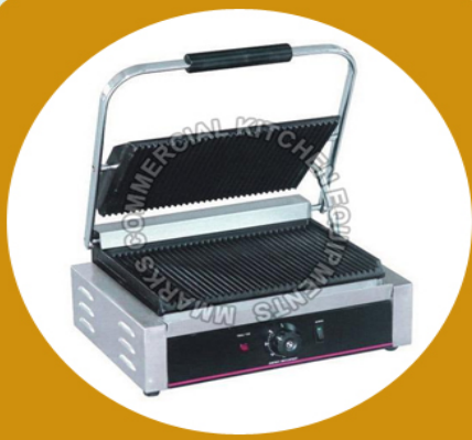
Jumbo Sandwich Griller