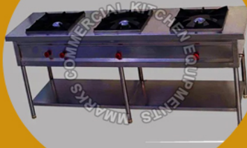
Three Burner Cooking Range