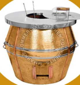
Stainless Steel Tandoor