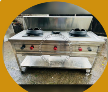
Chinese Cooking Range