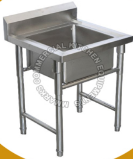
Stainless Steel Kitchen Sink