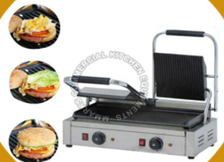
Commercial Sandwich Griller