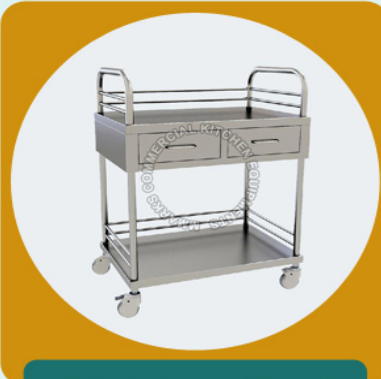
Stainless Steel Trolley