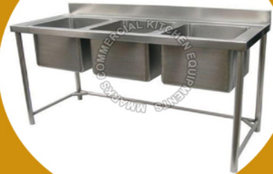
Three Sink Unit