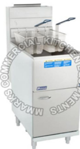
Single Deep Fat Fryer