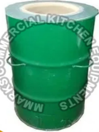
Mild Steel Tandoor