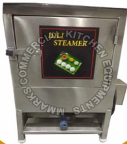
Stainless Steel Idli Steamer