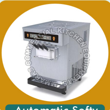
Automatic Softy Vending Machines