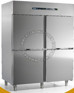
Four Door Vertical Refrigerator