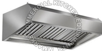
Commercial Kitchen Chimney