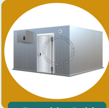
Portable Cold Storage