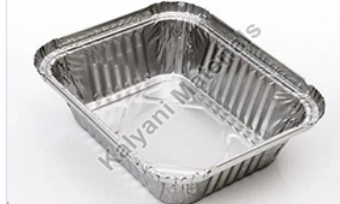
Aluminium Food Container