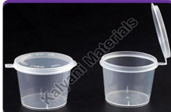
Hinged Sauce Container