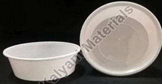
250ml Plastic Container