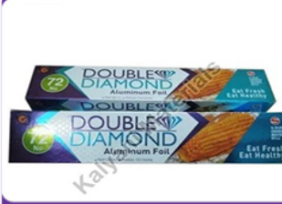
Double Diamond Aluminium Foil