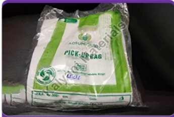
Biodegradable Carry Bag