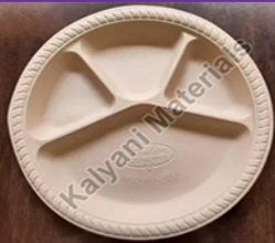
Disposable Corn Starch Plates