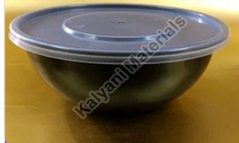
Plastic Rice Storage Container