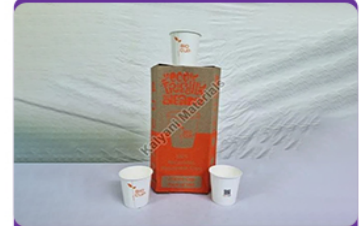
Biodegradable Paper Cups