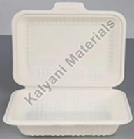
600 ML Corn Starch Clamshell