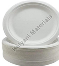
Disposable Bagasse Plates