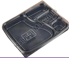
4 Compartment Meal Tray