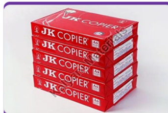
A4 Self Adhesive Labels