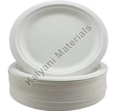
Round Bagasse Plates