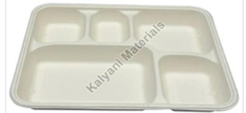
Bagasse Meal Tray