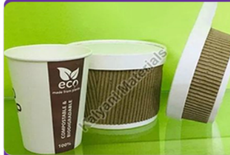
Ripple Paper Container