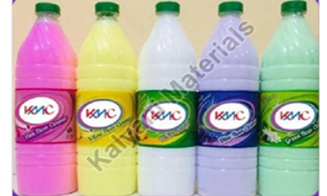
Liquid Tile Cleaner