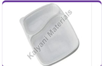
2 Compartment Meal Tray