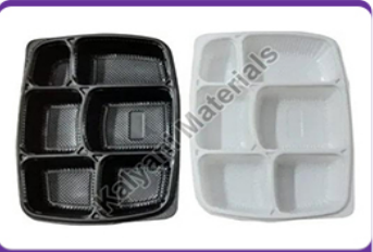
6 Compartment Meal Tray