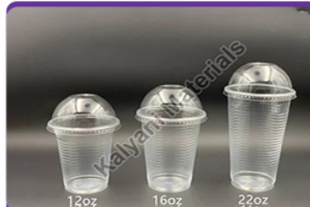
Plastic Glass with Lid