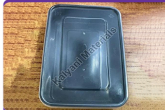
Rectangular Plastic Container