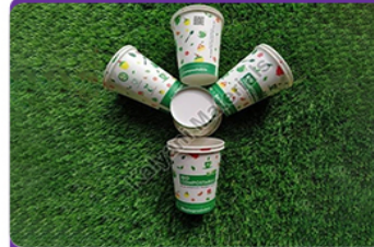
Bio Compostable Paper Cups