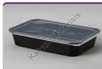
Rectangular Plastic Lunch Box