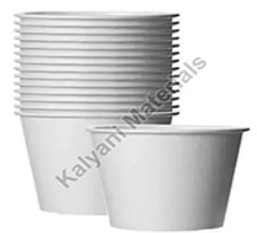
100 ML Disposable Paper Cups