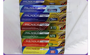
Paladius Aluminium Foil