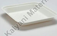
Bagasse Square Plates