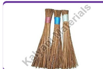
Coconut Broom Stick