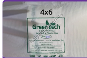
U Cut Carry Bag