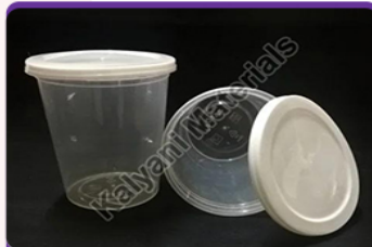
Biodegradable Plastic Glass