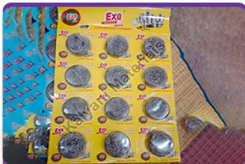
Stainless Steel Scrubber