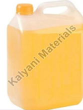
Liquid Phenyl Concentrate