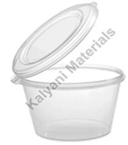
Plastic Dip Container