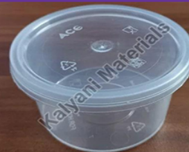
120ml Plastic Container