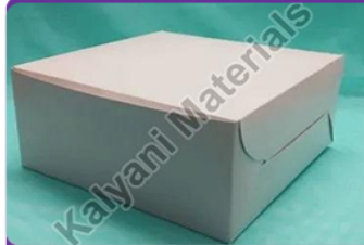
Bakery Paper Cake Box