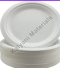
White Bagasse Plates