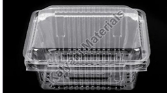
Transparent Disposable Fruit Container