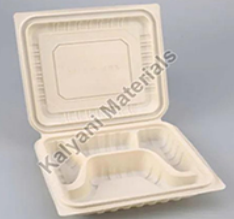
Biodegradable Cornstarch Tray