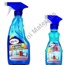
Liquid Glass Cleaner