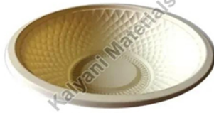
Round Corn Starch Bowl