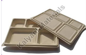
Cornstarch Meal Tray