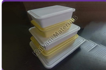
Plastic Sweet Box