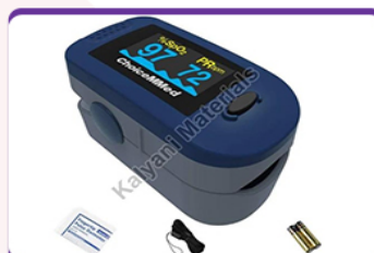
Fingertip Pulse Oximeter