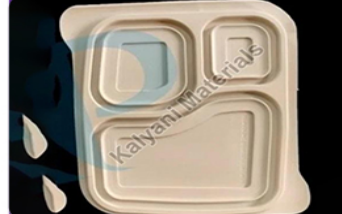
Cornstarch Meal Tray With Lid