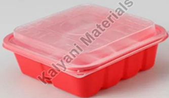
Blister Lunch Box