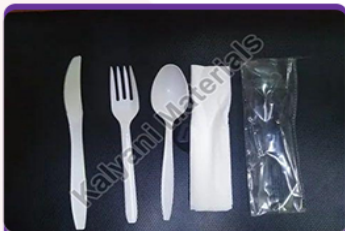
Plastic Cutlery Set