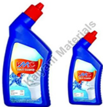
Liquid Toilet Cleaner