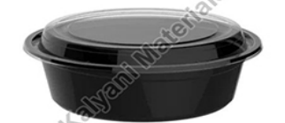
Round Plastic Lid Container