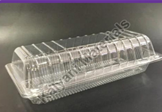
Plastic Cake Storage Box