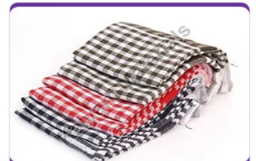
Cotton Kitchen Cloth