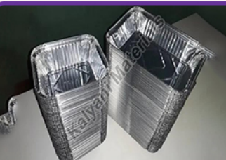
Rectangular Aluminium Container