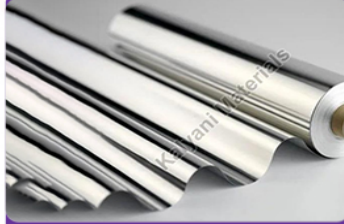
Aluminium Silver Foil Roll