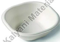
Bagasse Square Bowl