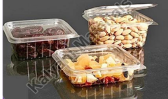
Plastic Hinged Lid Container