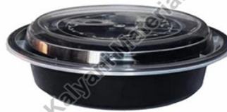
Plastic Food Storage Container