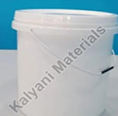
SP 5 KG CONTAINER