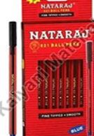
Nataraj Classic Ball Pen