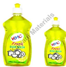
Liquid Dishwash Cleaner