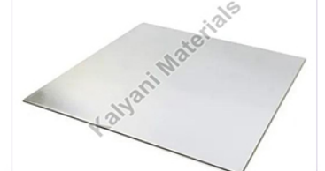
Cake Base Boards