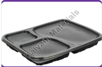
3 Compartment Meal Tray