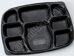
8 Compartment Meal Tray