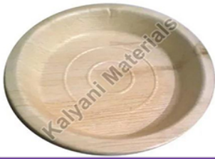
8 inch Area Leaf Plates