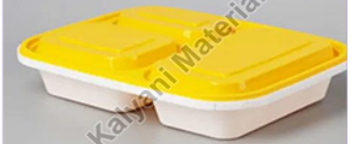
Plastic School Lunch Box