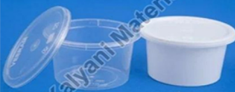
500ml Plastic Container