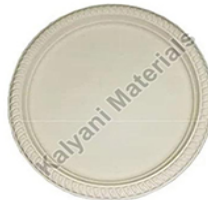
Round Corn Starch Plates