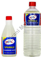
Liquid Cleaning Acid