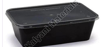
Black Plastic Food Container