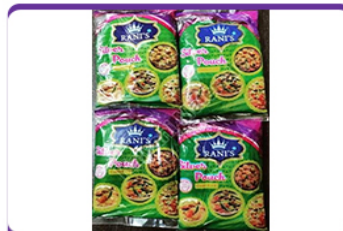
Stand Up Packaging Pouch