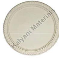
Biodegradable Cornstarch Plates