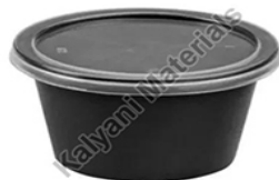
100ml Plastic Container