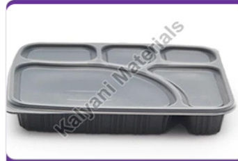
5 Compartment Meal Tray