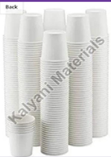
250 ML Disposable Paper Cups