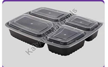
Regular Lunch Box