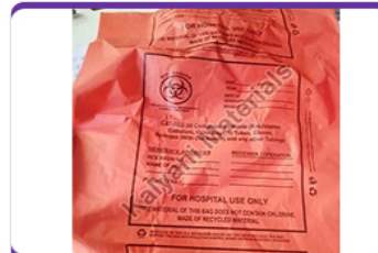
Biohazard Garbage Bag