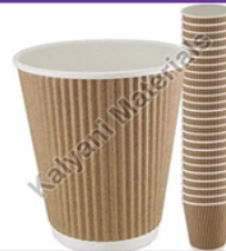
Ripple Paper Cups