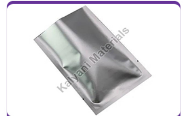
Silver Packaging Pouch