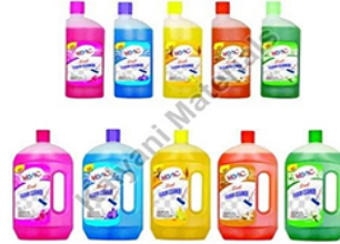
Liquid Floor Cleaner