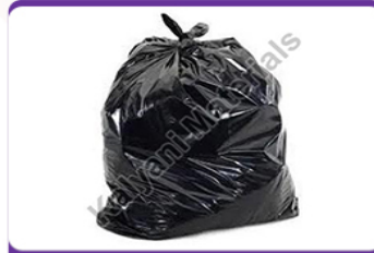
Compostable Garbage Bag