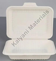
750 ML Corn Starch Clamshell