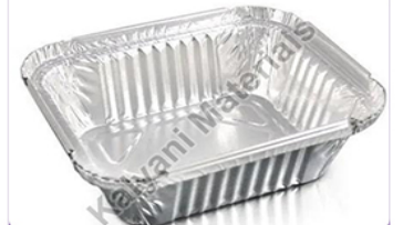
Aluminum Foil Container