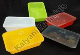
750 ML Plastic Container