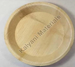
10 Inch Areca Leaf Plates