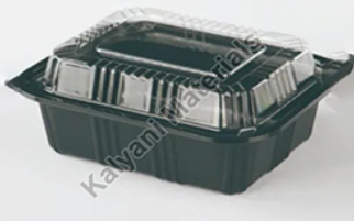
Plastic Sushi Box