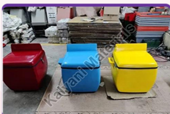
Bike Delivery Box