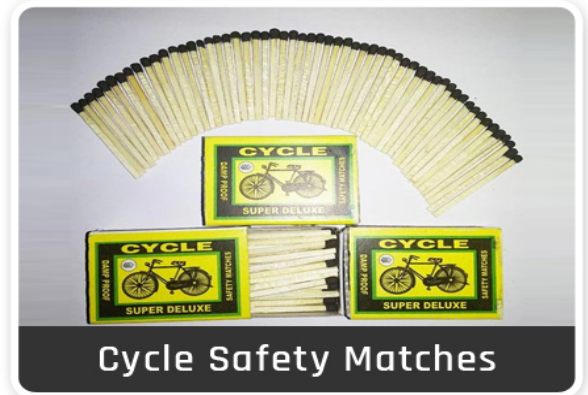
Cycle Safety Matches