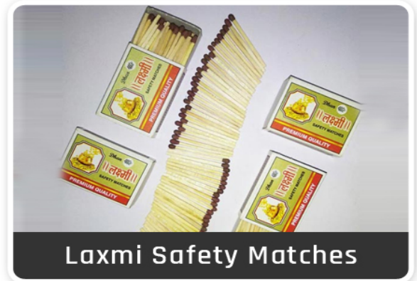
Laxmi Safety Matches