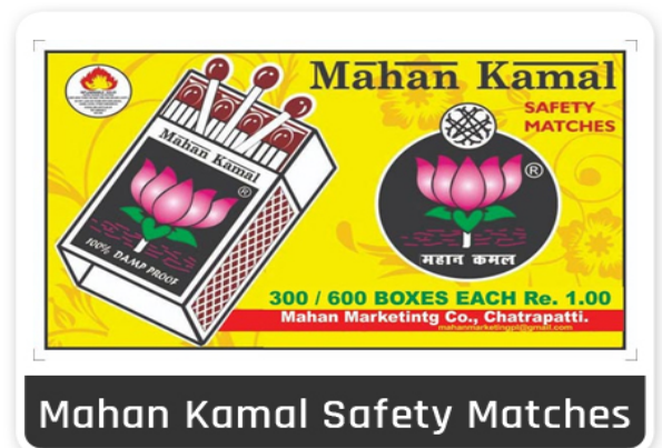
Mahan Kamal Safety Matches