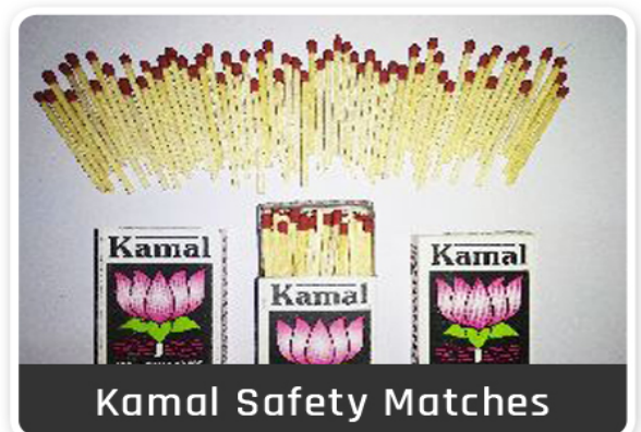
Kamal Safety Matches