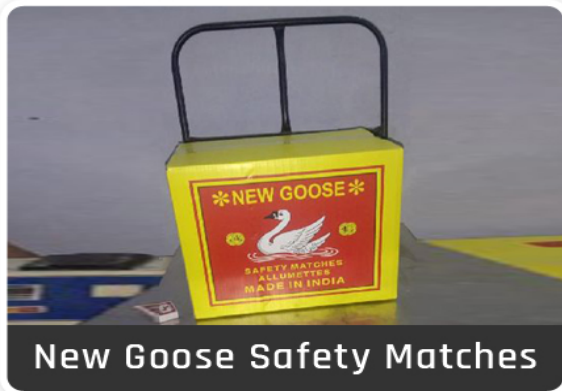
New Goose Safety Matches