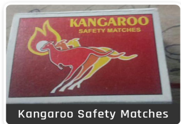
Kangaroo Safety Matches