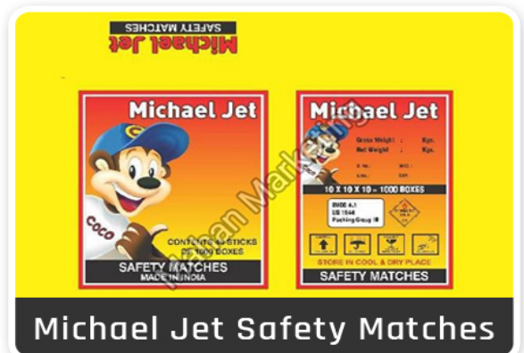
Michael Jet Safety Matches