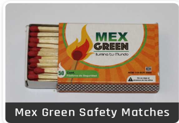
Mex Green Safety Matches