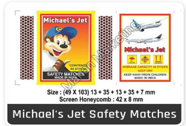
Michael's Jet Safety Matches