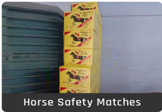
Horse Safety Matches