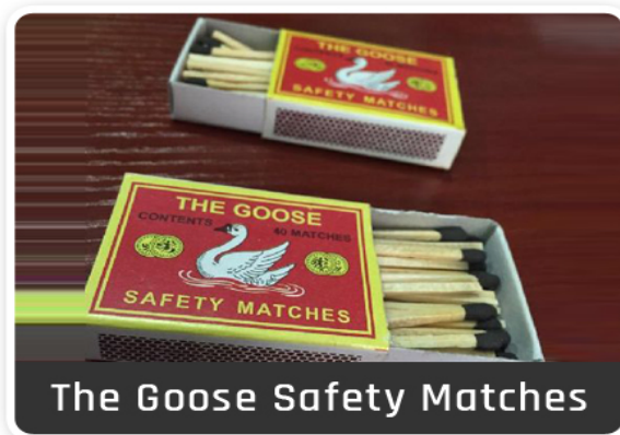
The Goose Safety Matches