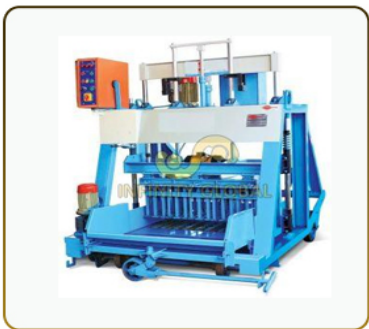
Concrete Block Making Machine