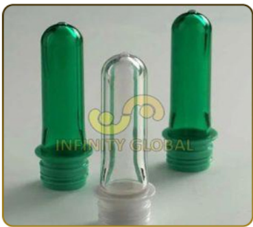
Hot Fill PET Preforms