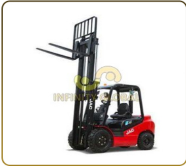
3 Ton Diesel Forklift