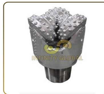
Tricone Drilling Bit