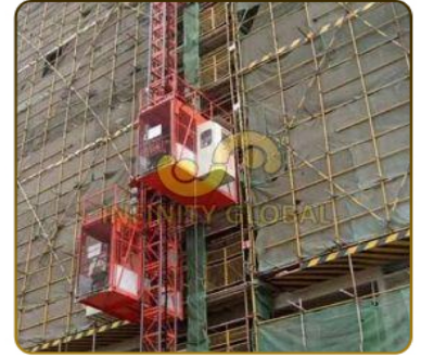
Construction Hoist Lift