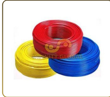
Electric Power Cable