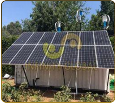
Off Grid Solar Plant