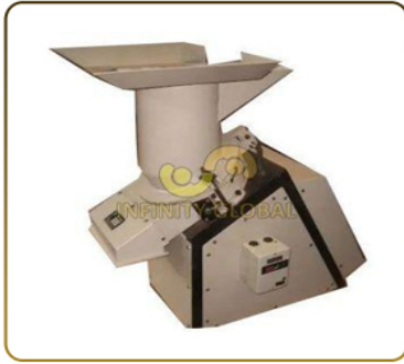
Industrial Crusher Machine