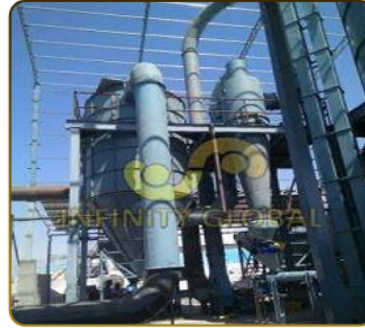
Cobalt Hydroxide Dryer