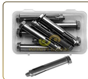
Stainless Steel Fastener