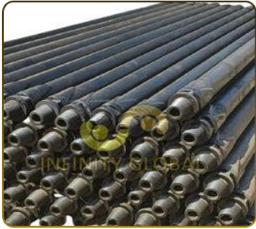
Heavy Weight Drill Pipe