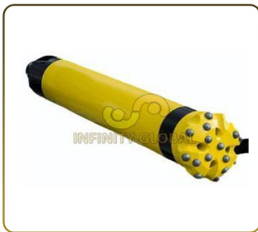
DTH Hammer Bit