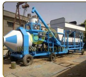
Diesel Automatic Mobile Concrete Batching Plant