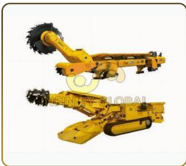
Continuous Miner Machine