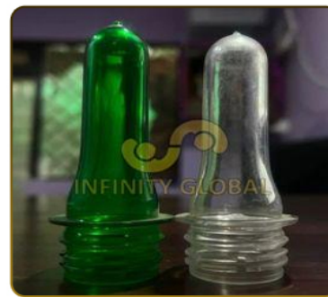
PET Preforms for Juice Bottles