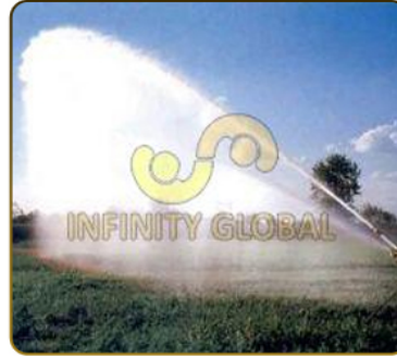
Center Pivot Irrigation System