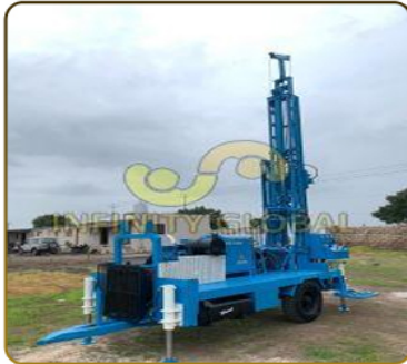
Hydraulic Core Drilling Rig