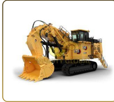
Hydraulic Mining Shovel