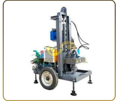
Portable Mini Drilling Machine