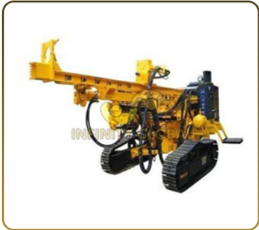
Crawler Mounted Drilling Rig