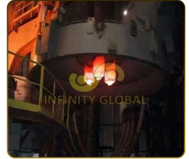
Electric ARC Furnace