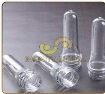
PET Bottle Preforms