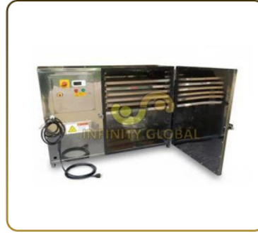
Industrial Dehydration Machine