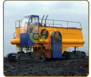
Surface Mining Machine