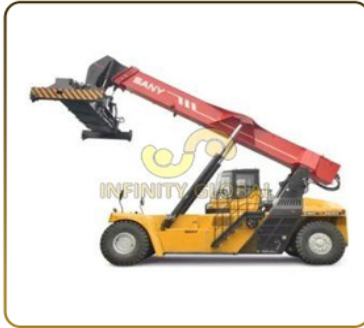
45 Ton Reach Stacker