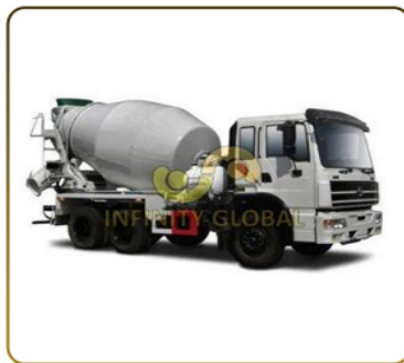
Concrete Mixer Truck