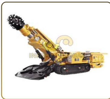
Heavy Road Header Machine