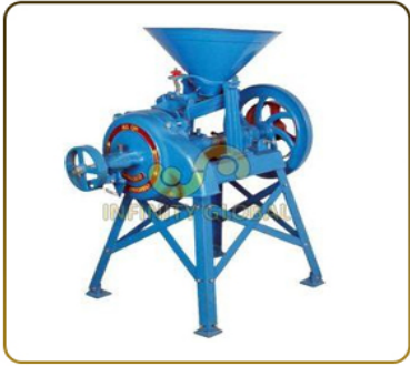
Grinding Mill Machine