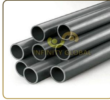
Mild Steel Drill Pipes