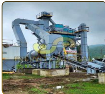
Automatic Asphalt Drum Mix Plant