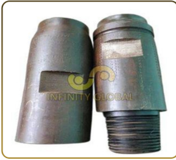
Mild Steel Drill Pipe Coupling