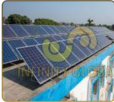
On Grid Solar Plant