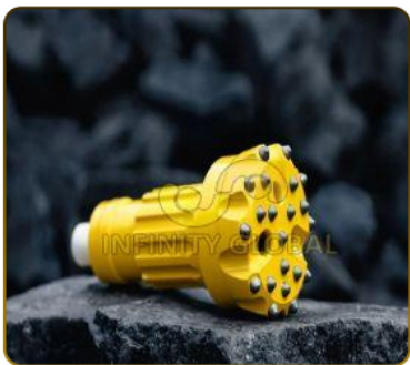
DTH Drill Bit