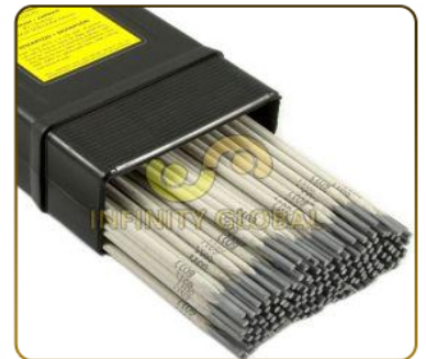
Stainless Steel Welding Rod