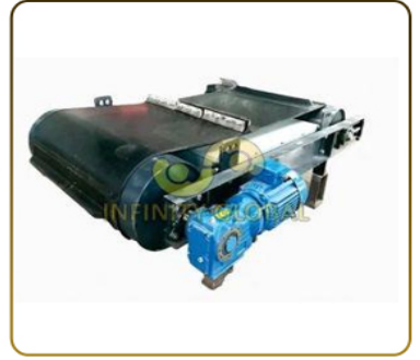
Magnetic Separator Machine