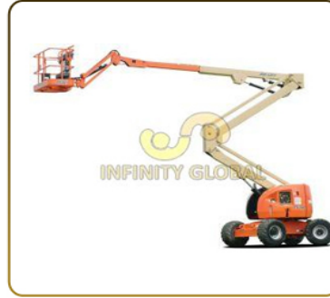
Articulating Boom Lift