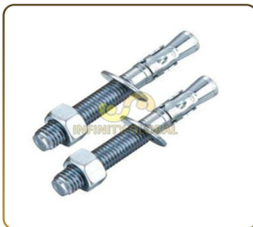
Stainless Steel Anchor Bolt