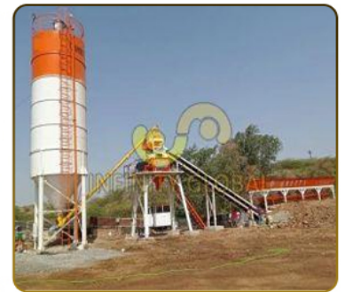
Electric Stationary Concrete Batching Plant