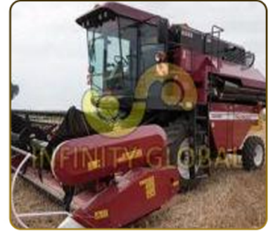
Crop Combine Harvester