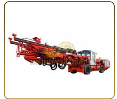
Jumbo Drill Machine