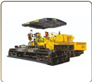
Asphalt Paver Machine