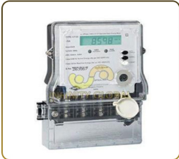
Digital Energy Meter