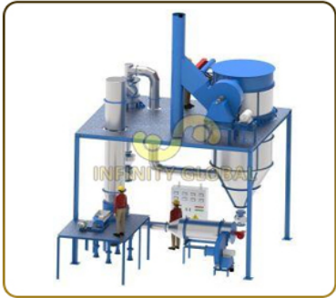
Agitated Swirl Spin Flash Dryer