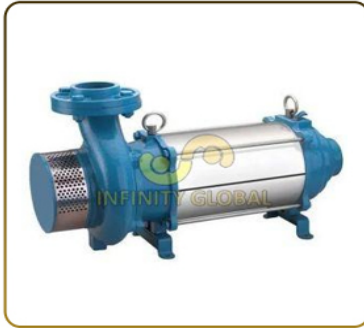
Agriculture Water Pump