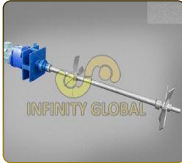
Agitator Leaching Units