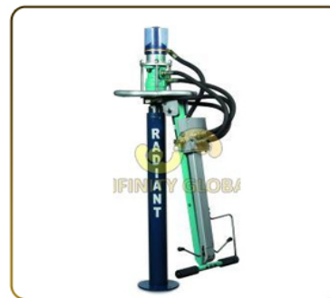
Hydraulic Roof Bolting Machine