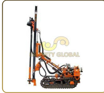
Pneumatic Drilling Rig