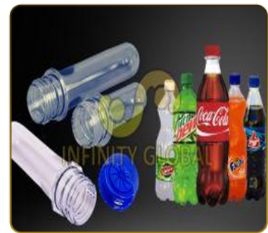
PET Preforms for Soft Drinks