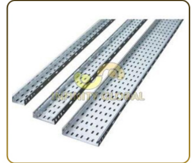
Electrical Cable Tray