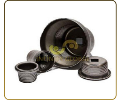
Pressed Steel Thread Protector