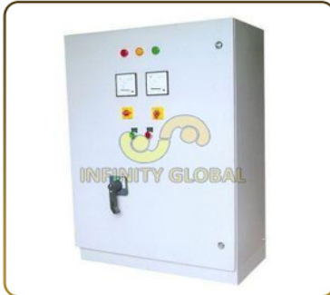
Electric Control Panel