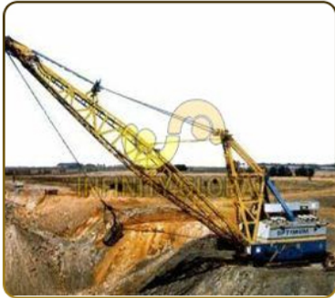
Dragline Excavator Machine