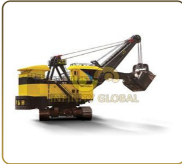
Electric Rope Shovel