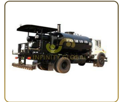
Bitumen Spray Truck