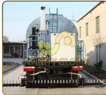
Automatic Electric Asphalt Distributor