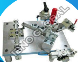
Mobile Jig Fixture