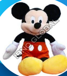
Mickey Mouse Soft Toy