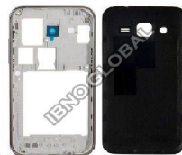
Mobile Body Panel