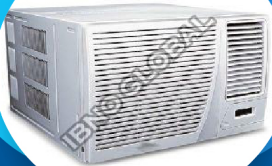
Window Air Conditioner