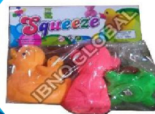
PVC Squeeze Toy