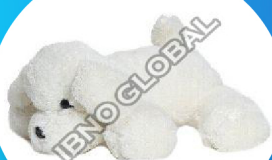
Lazy Dog Soft Toy