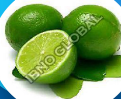
Fresh Green Lemon