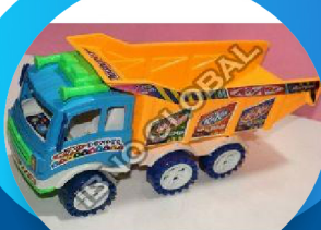
Plastic Dumper Toy