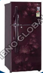
Double Door Refrigerator