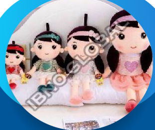
Musical Doll Soft Toy