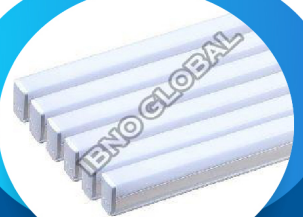
LED Tube Light