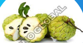
Fresh Custard Apple