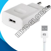
Mobile Phone Charger