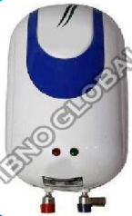
Electric Water Geyser