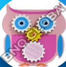
Owl Gear Toy