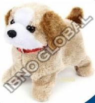
Jumping Puppy Toy