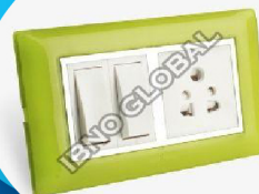
Electrical Switch Boards