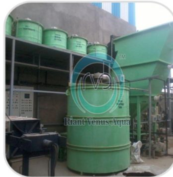
Waste Water Effluent Treatment Plant