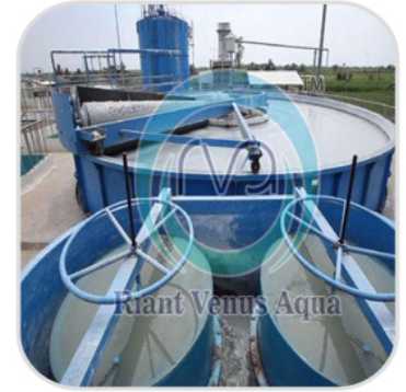
Milk Dairy Effluent Treatment Plant