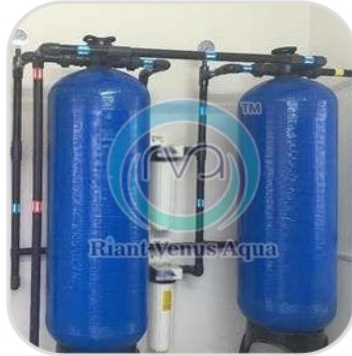
Domestic Water Treatment Plant