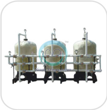
Commercial Water Softening Plant