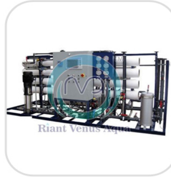
4000 LPH Industrial RO Plant