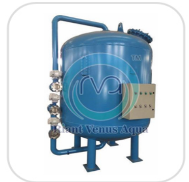
Pressure Sand Filter