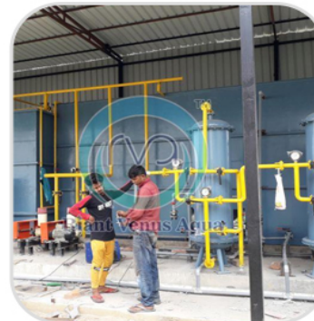
Mall Sewage Treatment Plant