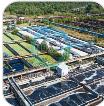
FAB Sewage Treatment Plant