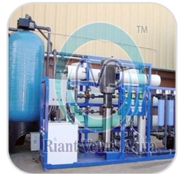
Industrial RO Water Treatment Plant