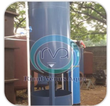
Containerized Effluent Treatment Plant