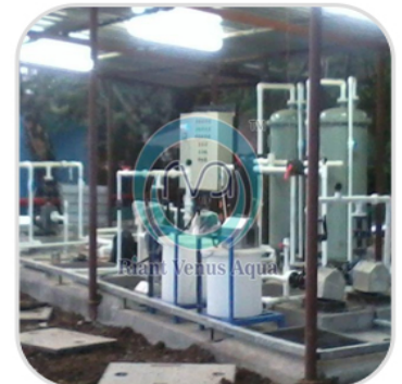
Housing Society Sewage Treatment Plant