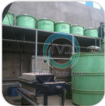
Packaged Effluent Treatment Plant