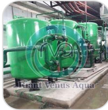
Industrial Water Softener