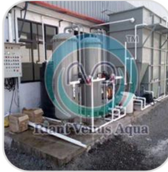
Commercial- Sewage Treatment Plant