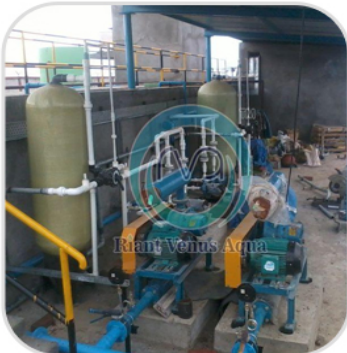
Conventional Sewage Treatment Plant