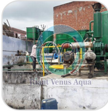
Industrial Effluent Water Treatment Plant