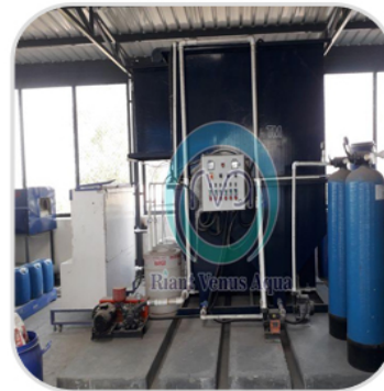
Compact Effluent Treatment Plant