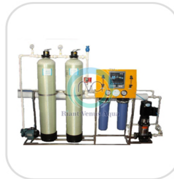
2000 LPH Industrial RO Plant