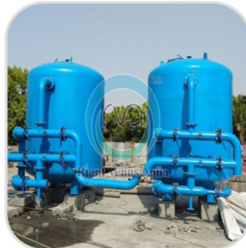
Water Filtration Plant