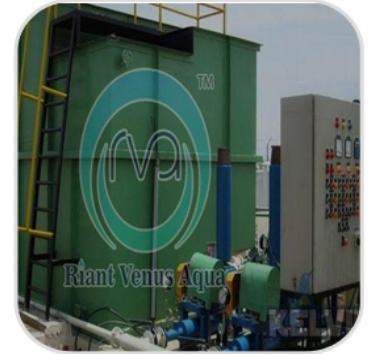
Containerized Sewage Treatment Plant