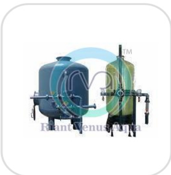
Activated Carbon Filter