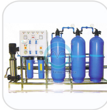
Industrial Water Softening Plant