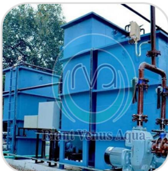
Industrial Sewage Treatment Plant