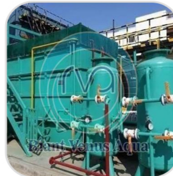
Domestic Sewage Treatment Plant