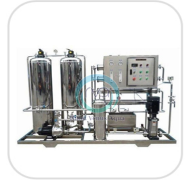
Stainless Steel RO Plant