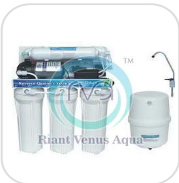
Domestic RO Water Purifier