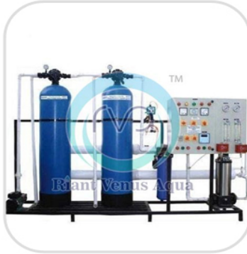
3000 LPH Industrial RO Plant