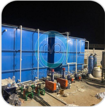
Automatic Sewage Treatment Plant