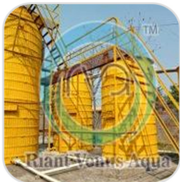
Anaerobic ETP Treatment Plant