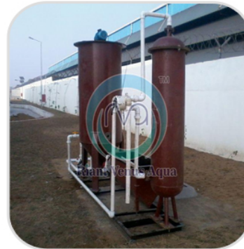
Prefab Effluent Treatment Plant