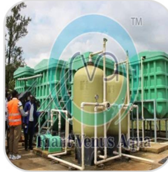
Compact Sewage Treatment Plant