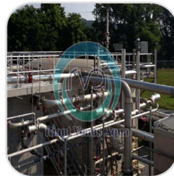
Biological Effluent Treatment Plant