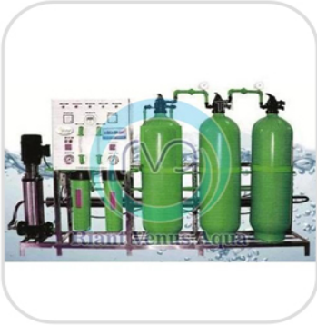
Mineral Water Filtration Plant