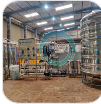
Packaged Drinking Water Plant