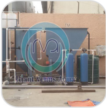
ETP Plant for Hospitals