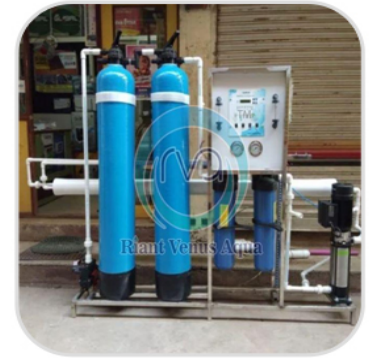
500 LPH Commercial RO Plant