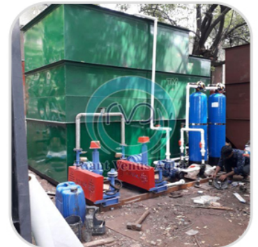
Mobile Sewage Treatment Plant