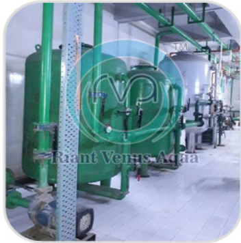
Commercial Water Treatment Plant