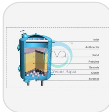
Dual Media Filter