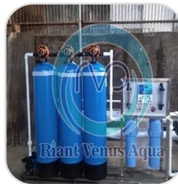
FRP Ro Plant