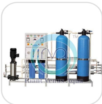
1000 LPH Commercial RO Plant