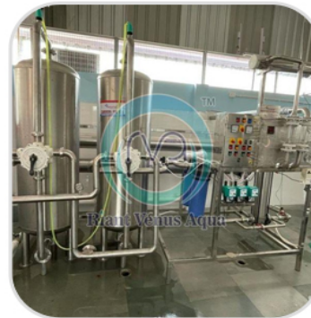
Commercial Reverse Osmosis Plant