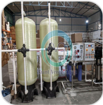
5000 LPH Commercial RO Plant