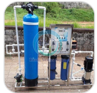
250 LPH Commercial RO Plant