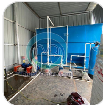
Institutional Sewage Treatment Plant