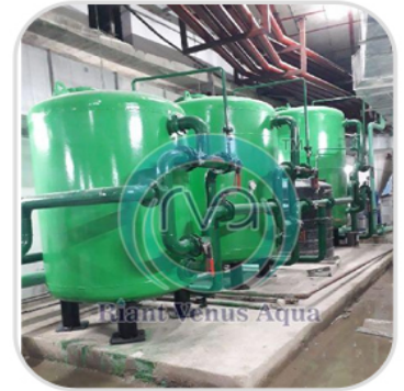
Industrial Water Treatment Plant