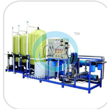
5000 LPH Industrial RO Plant