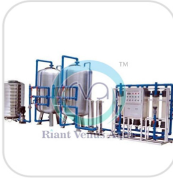
Mineral Water Plant