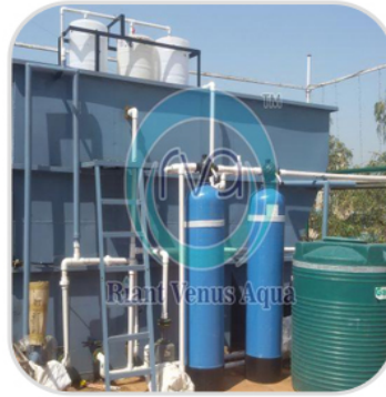
Industrial ETP Plant