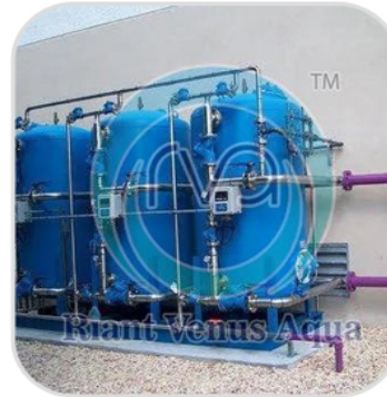
Domestic Water Softening Plant