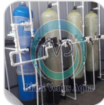
Raw Water Treatment Plant