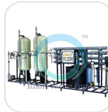
Industrial RO Water Purifier