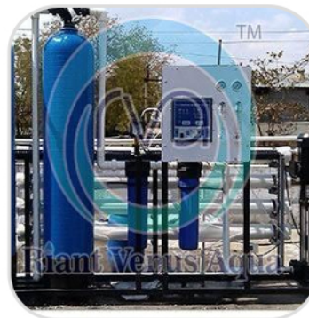
2000 LPH Commercial RO Plant