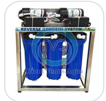
Commercial RO Water Purifier