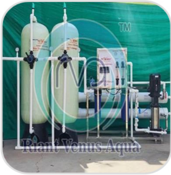
3000 LPH Commercial RO