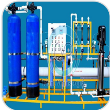
Packaged Water Treatment Plants