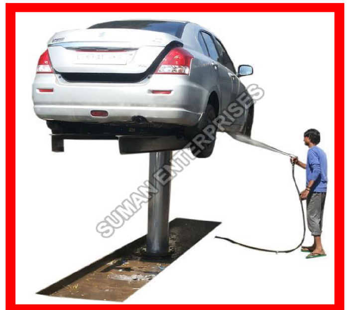
Hydraulic Washing Lift