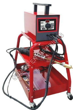
Car Dent Puller