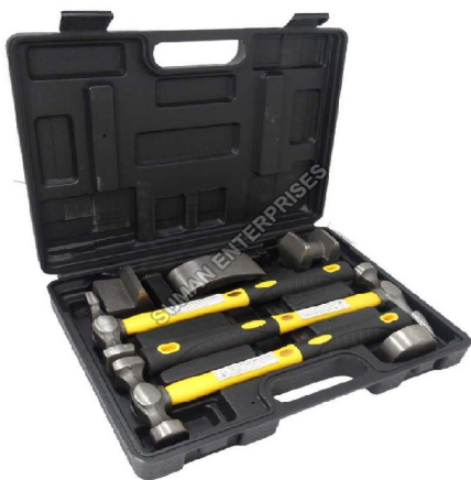
Denter Dolly Set