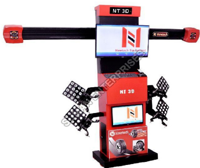
3D Wheel Alignment Machine