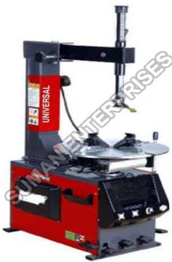
Tyre Changer Machine