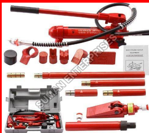
Body Repair Jack