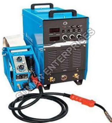
MIG Welding Machine