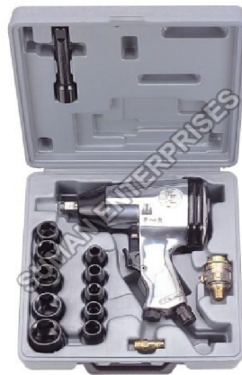
Pneumatic Impact Wrench