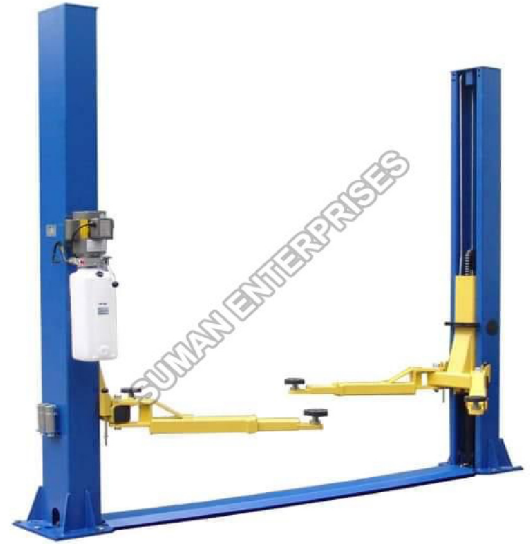
Two Post Lift