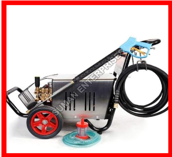
High Pressure Car Washer