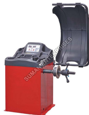
Digital Wheel Balancer