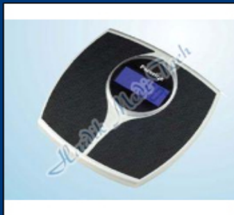
Prestige EB6571 Weighing Scale