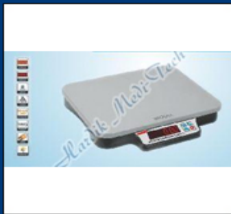
Prestige HM 0030 Weighing Scale