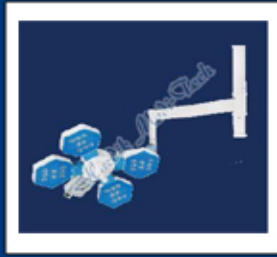
Sparx LED 07 Shadowless Lamp