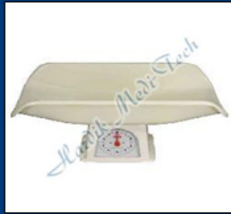
Prestige HM 0024 Weighing Scale