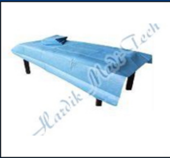
Disposable Bed Sheet