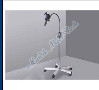
Focusable Halogen Examination Light