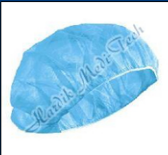
Disposable Bouffant Cap