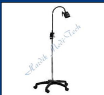
LED Examination Light