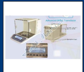
Semi Micro Balance