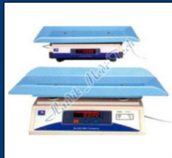
Digital Baby Weighing Scale With Dual Digital Display