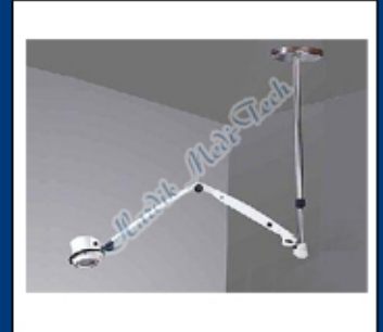
Ceiling Model Halogen Examination Light