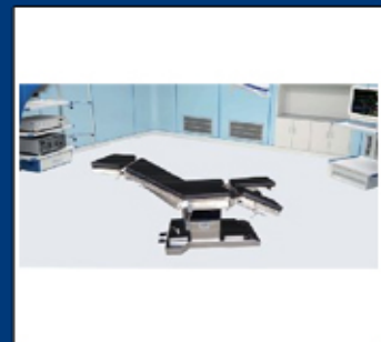
Electro Hydraulic Operation Theater