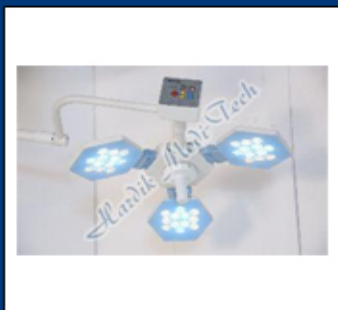
LED Surgical Light