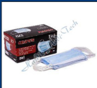
3 Ply Face Mask