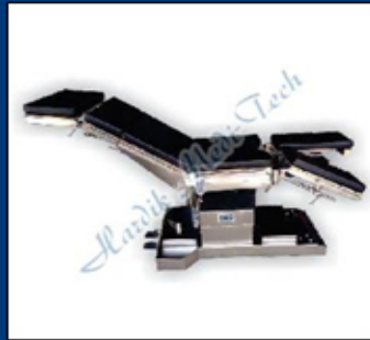
Electro Hydraulic Operating Table