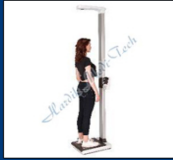
Ultrasonic Height Body Fat Analyzer