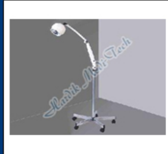
Floor Model Halogen Examination Light