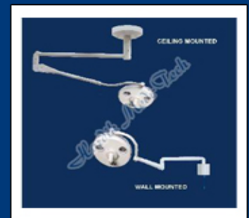
LED Operating Light