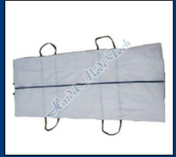
Dead Body Bag