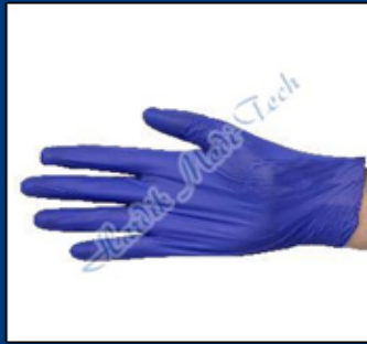
Medical Examination Gloves