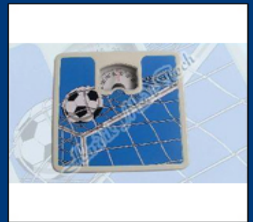
Prestige Sporty Weighing Scale