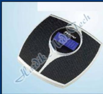
Prestige 150 Weighing Scale