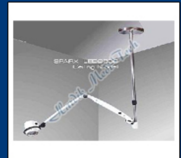
Ceiling Model LED Examination Light