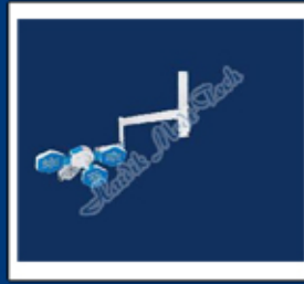
Sparx LED 05 Shadowless Lamp