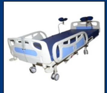
Digital Baby Weighing Scale