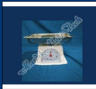
Prestige HM 0025 Weighing Scale