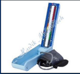
Blood Pressure Apparatus