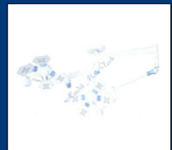
Sparx LED 04-05 Led Surgical Light