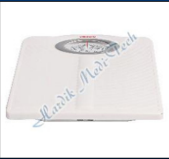
Crown Weighing Scale