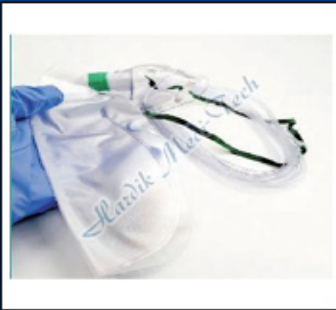
Non-Rebreathing Oxygen Mask