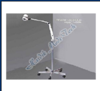
Floor Model LED Examination Light