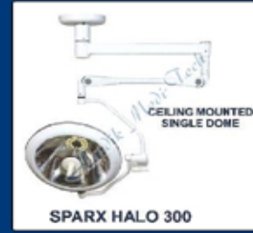
Sparx HALO 300 Shadowless Lamp