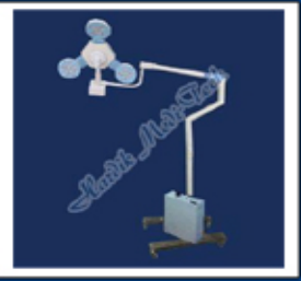
Sparx LED 06 Shadowless Lamp