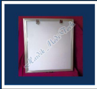
X Ray View Box