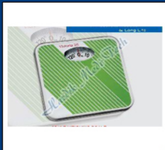
Prestige Victoria DX Weighing Scale