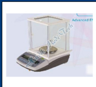
High Precision Balance