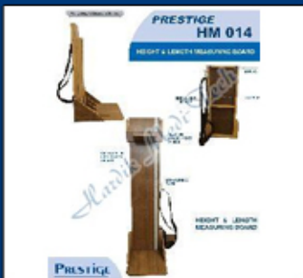
Height Measuring Board