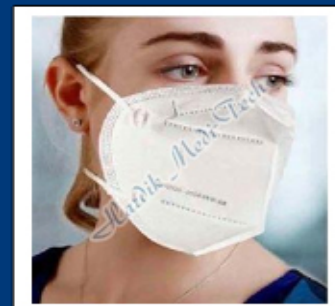
N95 Face Mask