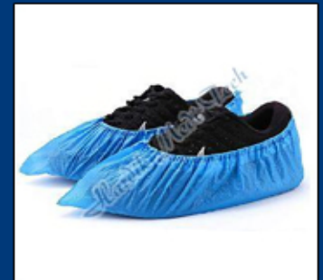
Disposable Shoe Cover