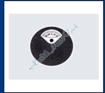
Prestige Classic Weighing Scale