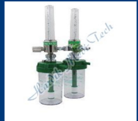
Oxygen Flow Meter