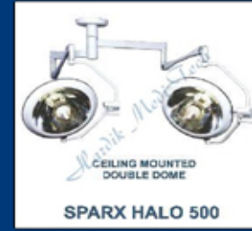
Sparx Halo 500 Shadowless Lamp