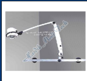
Railing Model LED Examination Light