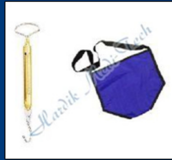
Prestige Hanging Weighing Scale