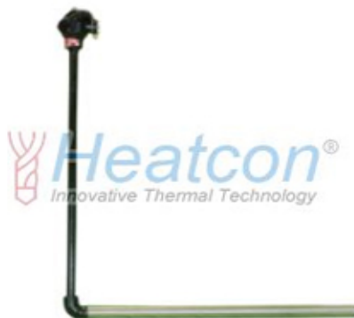
Cast Iron Thermocouple