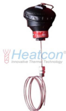
Mineral Insulated Thermocouple