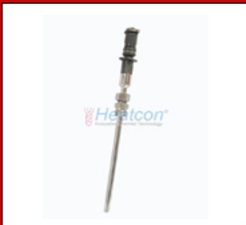
Diesel Locomotive Temperature Sensor