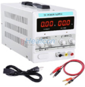
Power Supply Devices