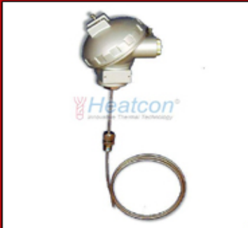
Mineral Insulated Resistance Temperature