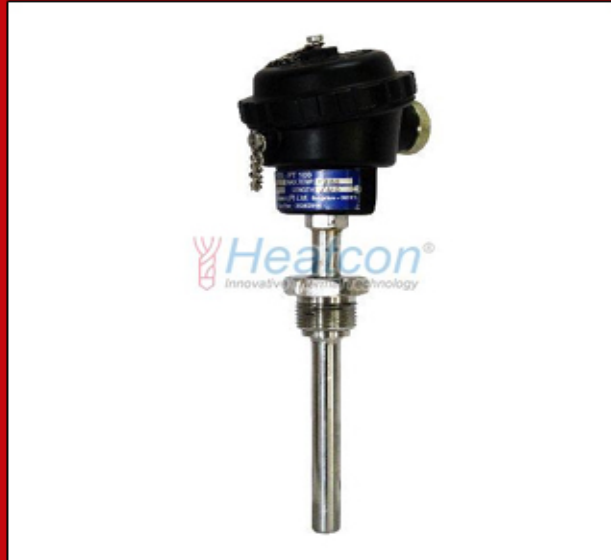
Bearing Resistance Temperature Detector