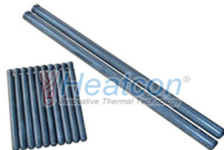
Silicon Nitride Thermocouple