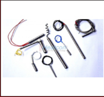
High Density Cartridge Heater