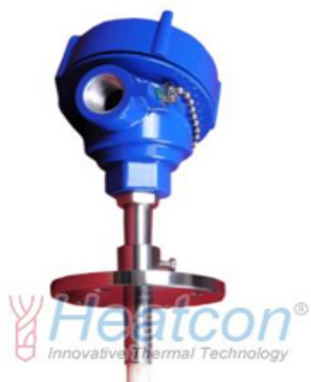
Noble Metal Thermocouple