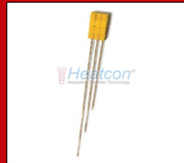
Nuclear Industry Temperature Sensor