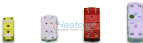
Thermocouple and RTD Connectors