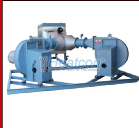
Hot Air Blower