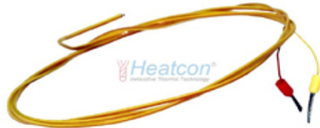
Thermocouple and RTD Cables