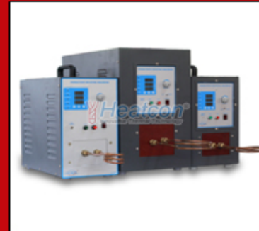
Induction Heating Machine