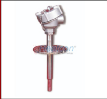
Resistance Temperature Detector