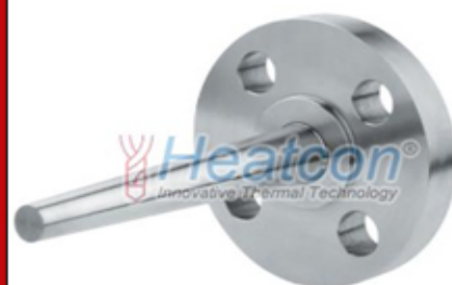
Thermocouple with Thermowell