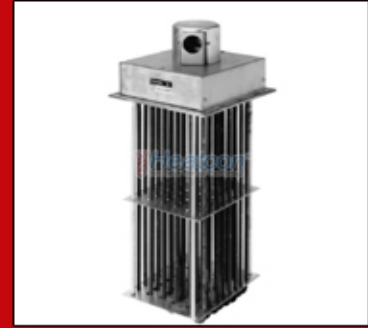
Duct Heater with Flameproof Enclosure