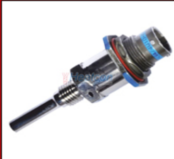
Aeronautical Temperature Sensor