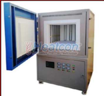
High Temperature Furnace