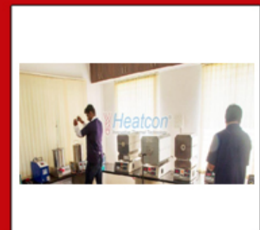
Thermocouple & RTD Calibration Lab Services