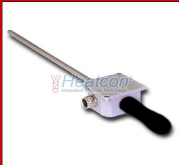
Research Application Temperature Sensor