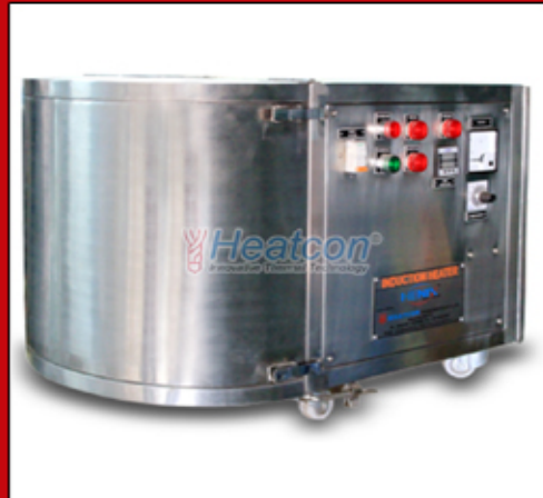
Induction Melting Furnace