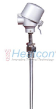
Base Metal Thermocouple