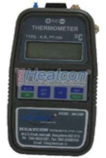
Handheld Temperature Indicator