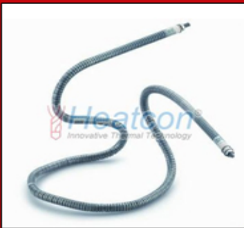
Flexible Tubular Heater