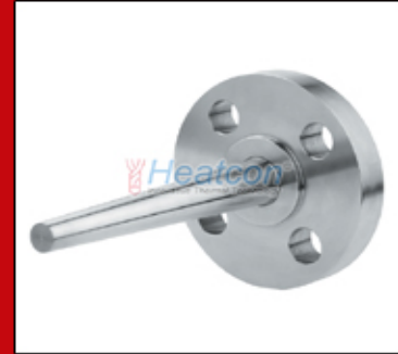
Resistance Temperature Detector with Thermowell