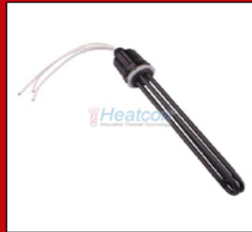
Teflon Coated Heater