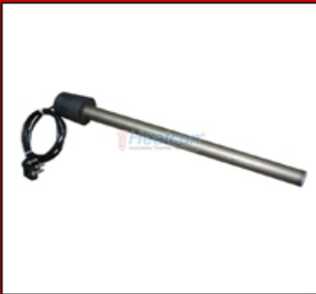
Chemical Immersion Heater