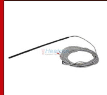
Slot Resistance Temperature Detector