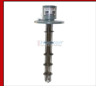
Flameproof Enclosure Heater