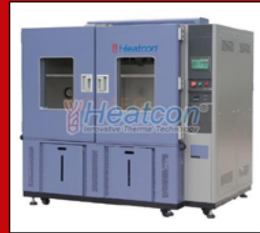
Temperature and Humidity Chamber