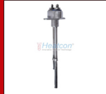
Turbine Temperature Sensor