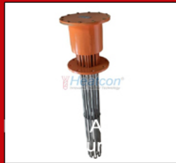
Immersion Heater with Flange