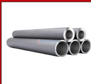
High Temperature Tubes