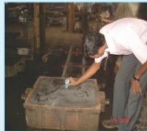
Mould Hardness Inspection