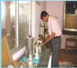
Sand Testing Lab