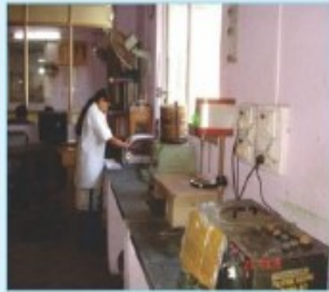
Sand Testing Lab