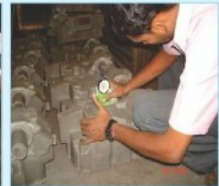
Core Scratch Hardness Inspection