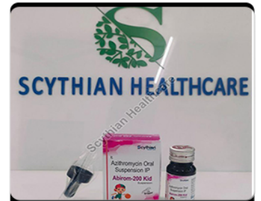
Abirom-200 Kid Suspension