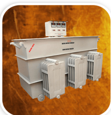
Three Phase Servo Voltage Stabilizer