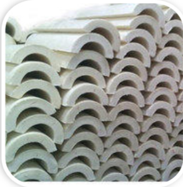
Puf Insulation Pipe Section