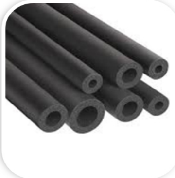
Cold Pipe Insulation Section