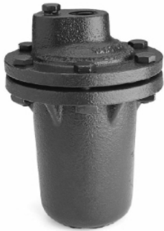
Inverted Bucket Steam Trap