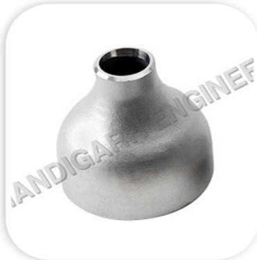
Pipe Concentric Reducer