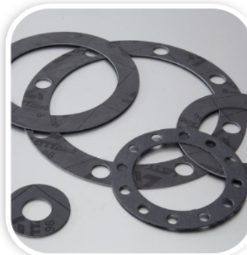
Metallic and Non Metallic Gaskets