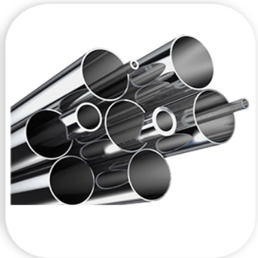
Stainless Steel Pipes