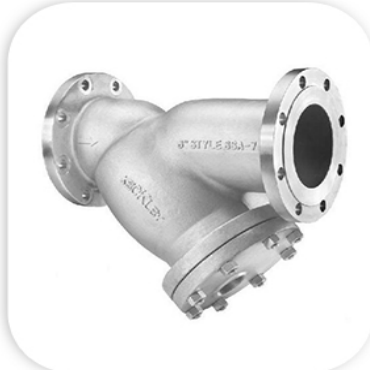
Y Strainer Valve