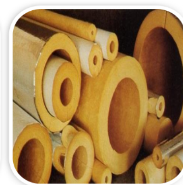
LRB Insulation Pipe Section