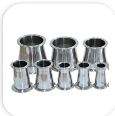
Stainless Steel TC End Reducer