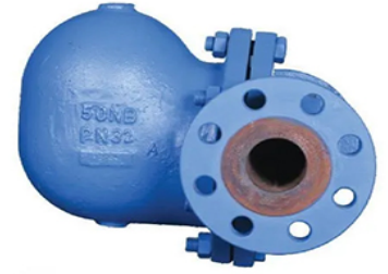
Ball Float Steam Trap