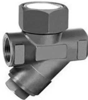
Thermostatic Steam Trap