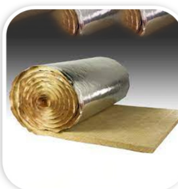
LRB Rockwool Insulation Mattress