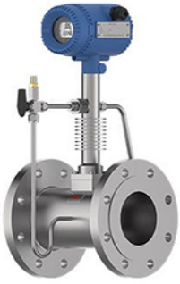
Vortex Steam Flow Meter