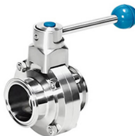
Sanitary Butterfly Valve