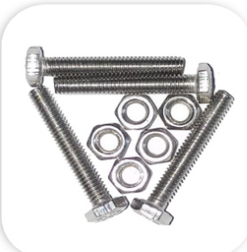
Stainless Steel Nut Bolts