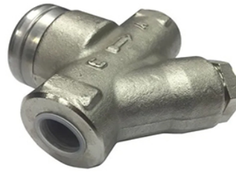
Thermodynamic Steam Trap