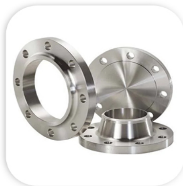
Weld Neck Flange