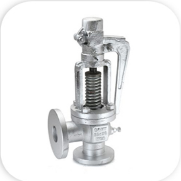
Safety Relief Valve