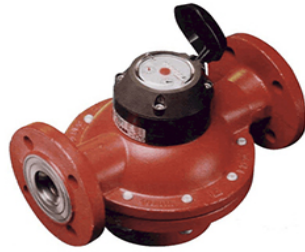
Oil Flow Meter