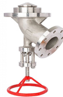
Flush Bottom Valve