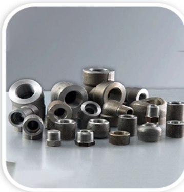
Forged Pipe Fittings