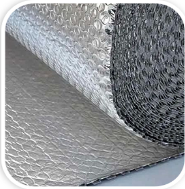
Aluminium Bubble Wrap Insulation