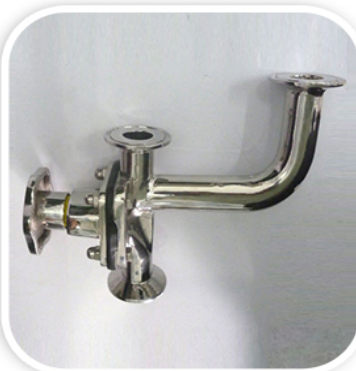
Zero Dead Leg Valve