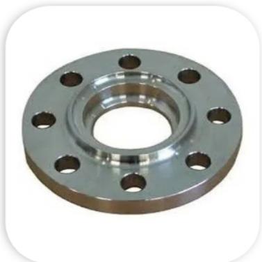
Socket Weld Flanges