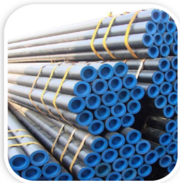
Galvanized Iron Pipes