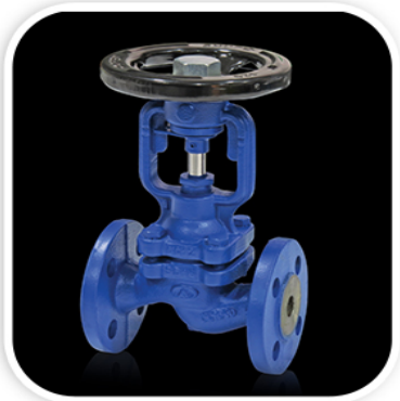
Bellow Sealed Valve