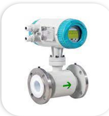
Electromagnetic Flow Meter