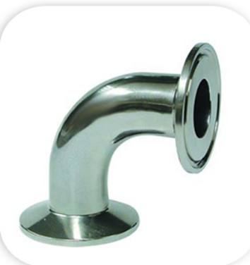
Stainless Steel TC End Elbow