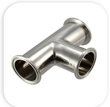
Stainless Steel TC End Tee