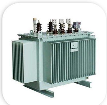
Step Up and Step Down Transformer