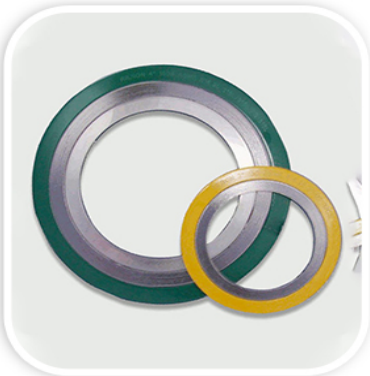
Spiral Wound Gasket