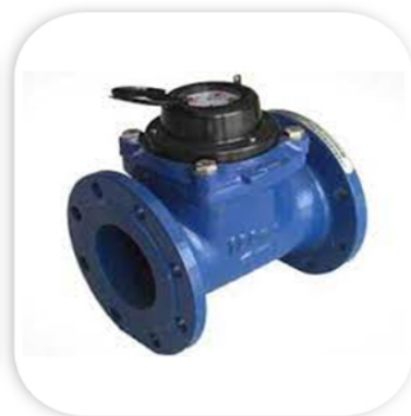
Woltman Type Water Meter