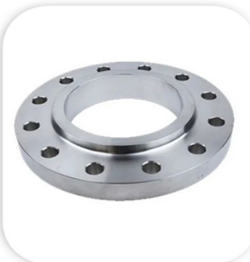
Slip On Flanges