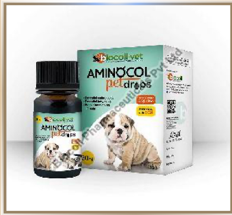
Aminocol Pet Drops