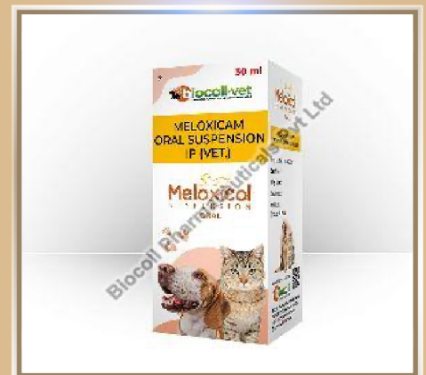
Meloxicol Oral Suspension