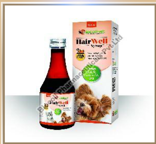
Hair Well Pet Syrup