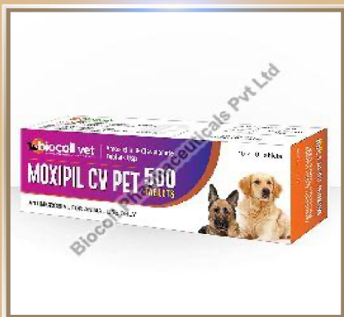
Moxipil CV Pet 500mg Tablets