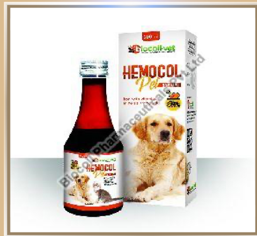
Hemocol Pet Syrup