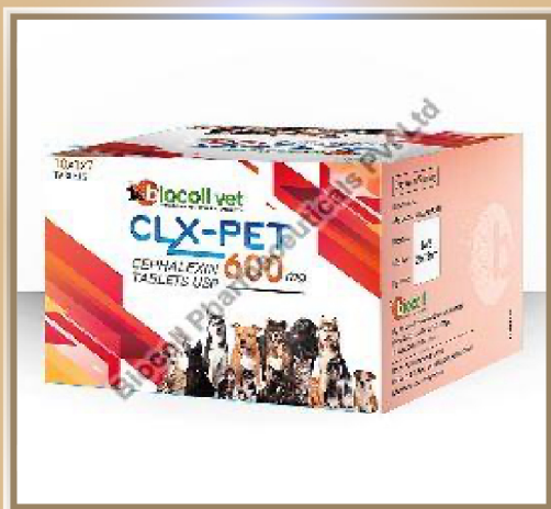
CLX-PET 600mg Tablets