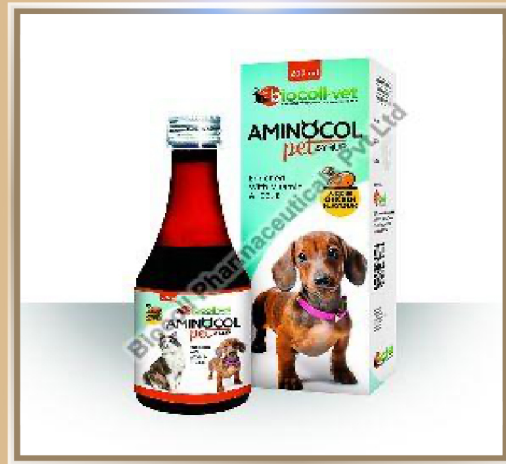
Aminocol Pet Syrup