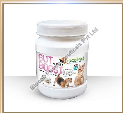
Gut Boost Fish Flavour Bowel Restorer Powder