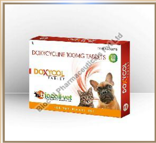
Doxycol 100mg Tablets