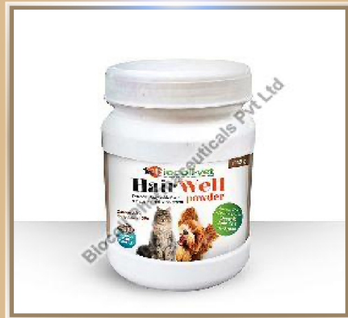
Hair Well Powder