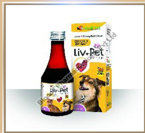
Liv+Pet 200ml Syrup