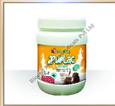
Puplac Puppy Milk