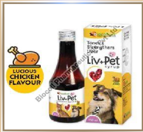
Liv+Pet 150ml Syrup