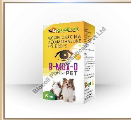
B-MOX-D Pet Eye Drops