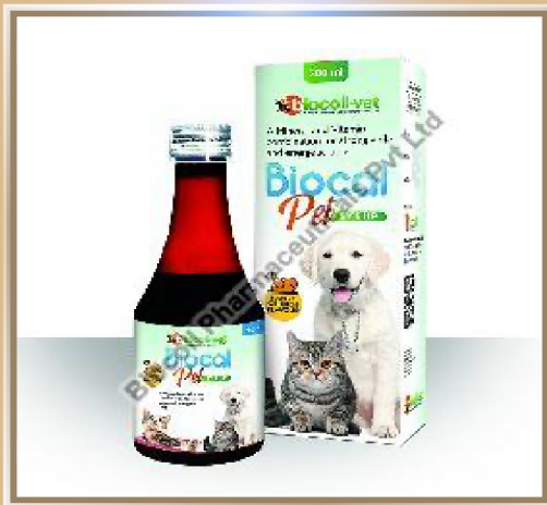
Biocal Pet Syrup