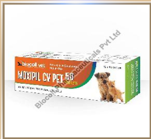
Moxipil CV Pet 50mg Tablets