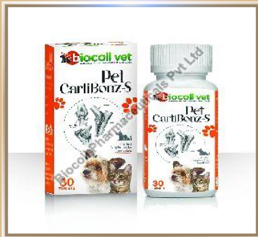
Pet Cartibonz-S Feed Supplement