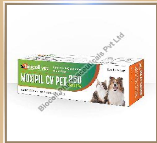
Moxipil CV Pet 250mg Tablets