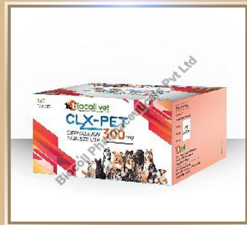
CLX-PET 300mg Tablets