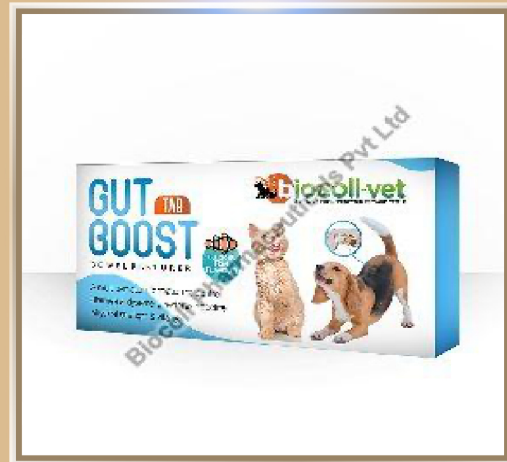
Gut Boost Bowel Restorer Tablets