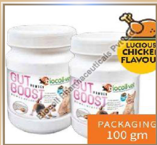
Gut Boost Chicken Flavour Bowel Restorer Powder