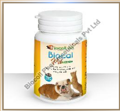
Biocal Pet Tablets