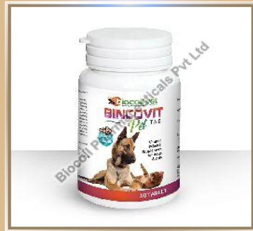
Bincovit Pet Tablets