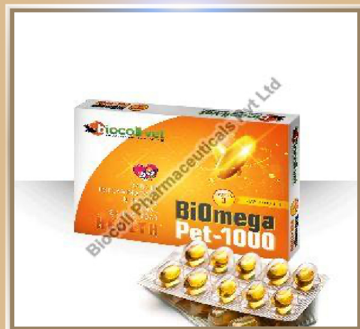
Biomega Pet-1000 Omega 3 Supplement