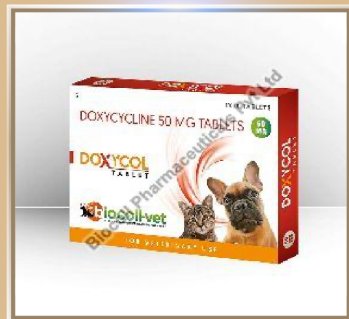
Doxycol 50mg Tablets