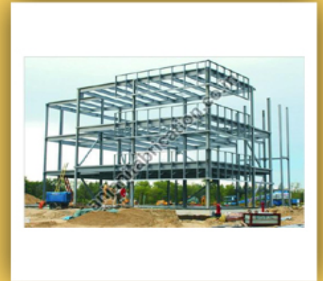
Building Fabrication Contractors