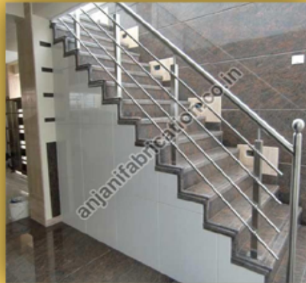
Stainless Steel Railing Fabrication Services