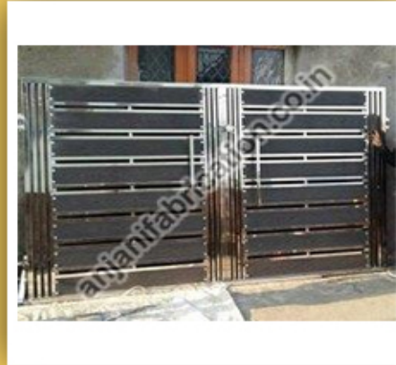
Gate Fabrication Services