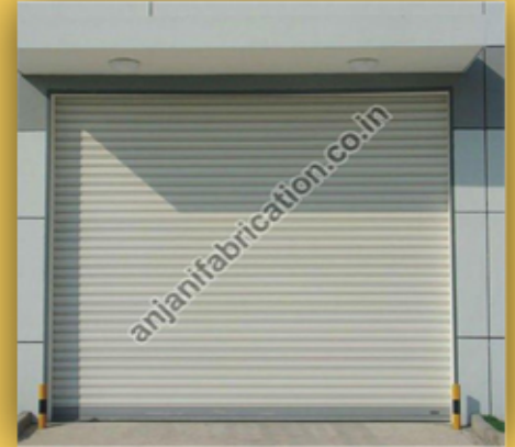
Shutter Fabrication Services