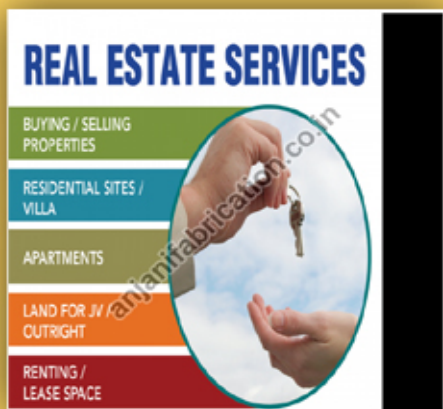
Real Estate Services