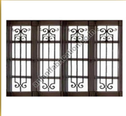
Grills Fabrication Services