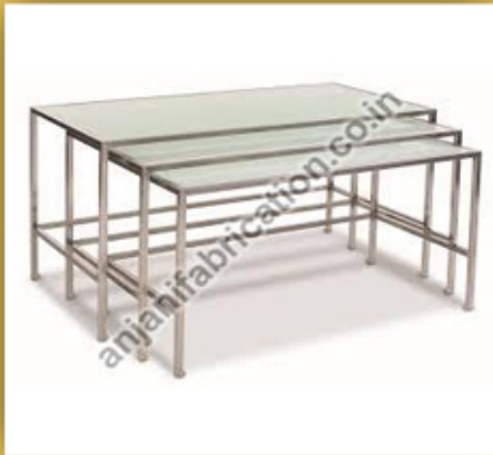
Buffet Table Fabrication Services