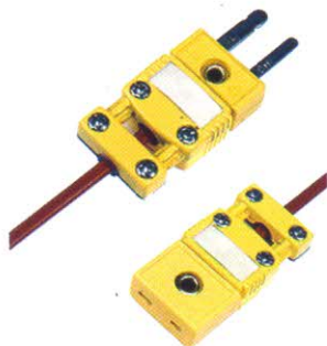
Thermocouple High Temperature Flat Pin - Connectors