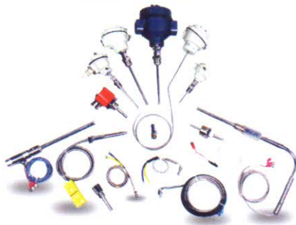
Thermocouples & RTDS