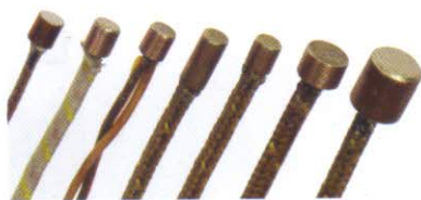
Customised Button Type Probes