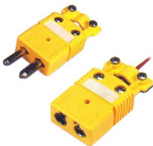
Very High Temperature Round Pin - Connectors