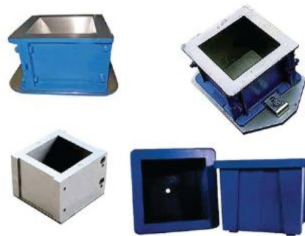
Cube Mould (Metal)