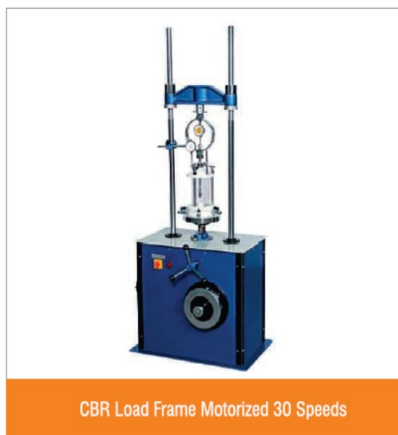
CBR Load Frame Motorized 30 Speeds