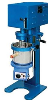
Mixer With Heating Jacket