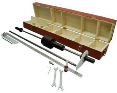
Dynamic Cone Penetrometer