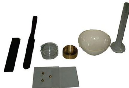
Shrinkage Limit Set