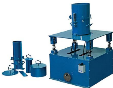
Relative Density Test