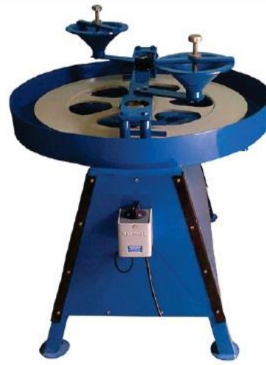
Dorry Abrasion Testing Machine