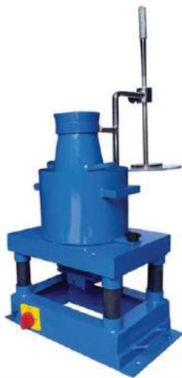
Vee Bee Consistometer