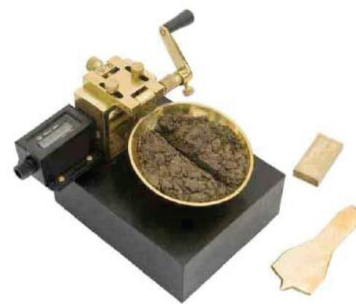
Liquid Limit Device With Counter