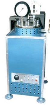
Laboratory Cement Autoclave