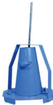
Slump Test Apparatus