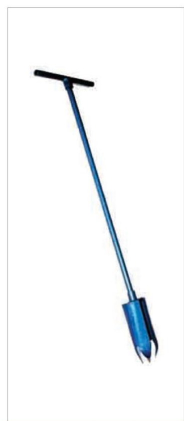
Auger Posthole Type