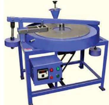
Tile Abrasion Testing Machine