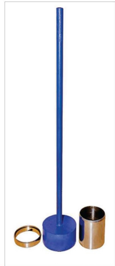
Dolly Core Cutter