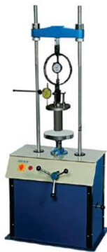
Unconfined Compression Tester (Motorized)