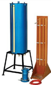
Permeability Apparatus (Falling & Constant Head Permeability)