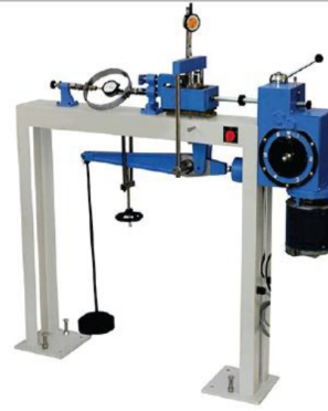
Direct Shear Test Apparatus