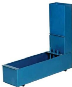
L - Shape Box Apparatus