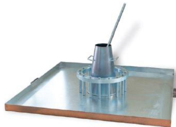
J - Ring, Narrow Gap