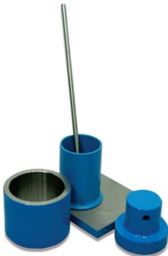
Aggregate Crushing Value Apparatus

S.N Scientific Solution, provides a complete selection of aggregate testing equipment for classifying and evaluating construction materials in accordance with ASTM, AASHTO and other standards. This includes: material splitters; sieves; screen shakers, as well as Aggregate Impact Value Testing Machine, Buoyancy Balance, Cylindrical Metal Measure, Density Basket, Deval Abrasion Testing Machine, Elongation Gauge, Flakiness Gauge, Jaw Crusher Laboratory type, Los Angeles Abrasion Testing Machine, Riffle Sample Divider, Sand Absorption Cone and Tamper, Sieve Shaker- Gyrotary, Sieve Shaker-Hand Operated, Sieve Shaker-rotap etc.. From ASTM testing sieves to moisture testers.