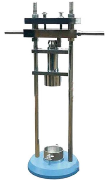
Aggregate Impact Tester With Blow Counter