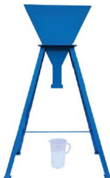
V - Funnel