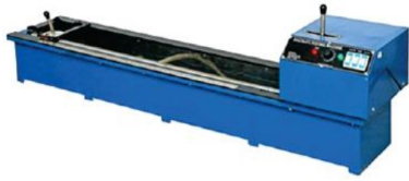
Ductility Testing Apparatus