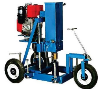
Pavement Core Drilling Machine

S.N Scientific Solution provides wide array of modular Bitumen Testing Equipment to accomplish these needs. S.N Scientific Solution, Geotechnical testing equipment includes We Supplied comprehensive range of bitumen testing equipment, asphalt testing instruments comprises of Ductility testing machine, Rolling thin film oven, Core Drilling machine, Ductility Testing Apparatus, Bitumen penetrometer, Bitumen/Centrifuge Extractor – Hand Operated, Bitumen/Centrifuge Extractor – Motorized, Kinematic viscosity bath, Standard Penetrometer, Marshall stability test apparatus, Automatic marshal compactor, water bath for penetration test etc.