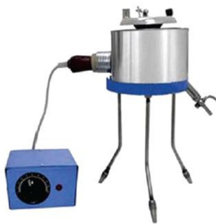
Standard Tar Viscometer