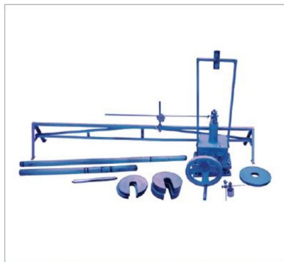
California Bearing Ratio Test (Field Type)