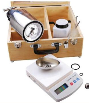
Speedy Moisture Meter