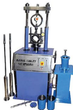
Marshall Stability Test Apparatus