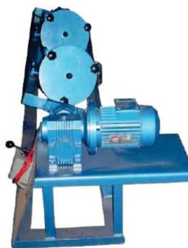
Deval Attrition Tester