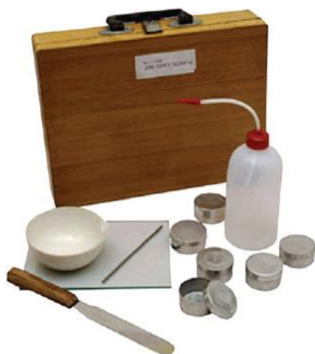
Plastic Limit Set