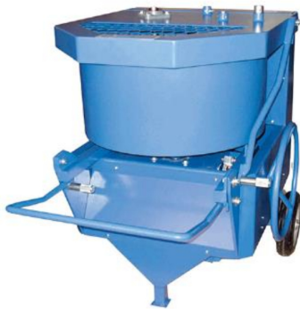
Laboratory Concrete Pan Mixer Machine (Capacity 40 Ltrs.)