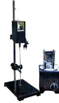
Ring And Ball Apparatus Electrical