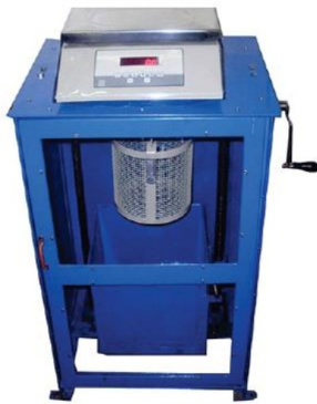
Specific Gravity And Water Absorption Of Aggregates