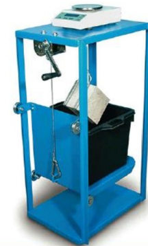
Density of Fresh And Hardened Concrete