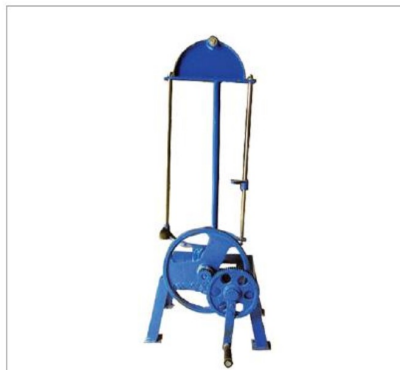
Sieve Shaker Hand Operated