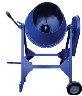
Laboratory Concrete Mixer (Motorized)