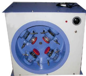
Stripping Value Apparatus