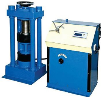
Digital Compression Testing Machine Channel and Pillar Type