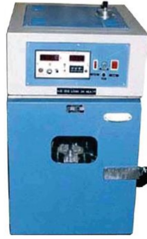
Loss On Heating / Thin Film Oven