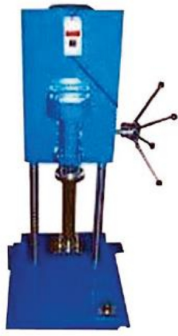
DLC Vibrating Hammer