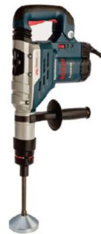
DLC Vibrating Hammer For Concrete Moulds