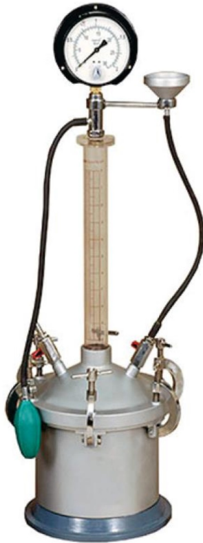
Air Entrainment Meter