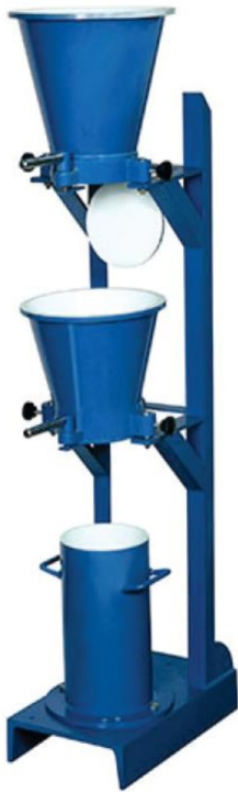
Compaction Factor Apparatus

S.N Scientific Solution provides wide array of modular Concrete Testing Equipment to accomplish these needs. S.N Scientific Solution Geotechnical testing equipment includes We Supplied modular and mobile NDT Testing instruments such as Ultrasonic Pulse Velocity Meter, Concrete Cover Meter, Concrete Test Hammer, Cement Testing Instruments, Cement Testing Equipment, Non-Destructive Testing Equipment, NDT Testing Equipment etc.