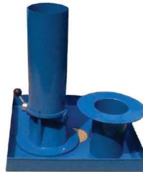
Sand Pouring Cylinder