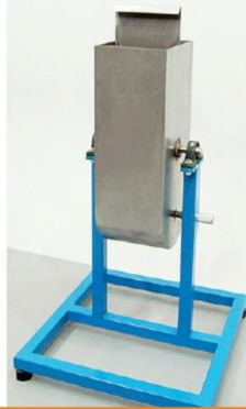
U-Shape Box Apparatus