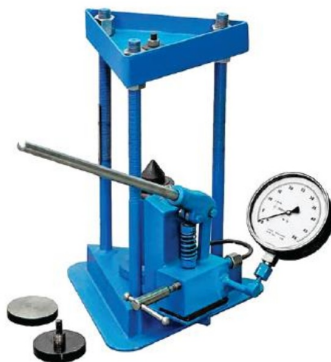
Point Load Index Tester