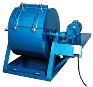
Los Angeles Abrasion Testing Machine