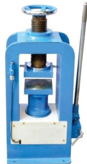
Compression Testing Machine Channel Type Load Frame Hand Operate