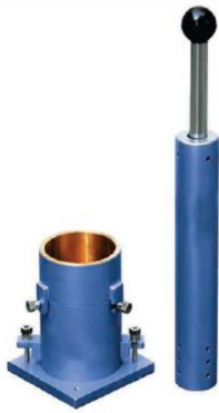
Standard Compaction Test