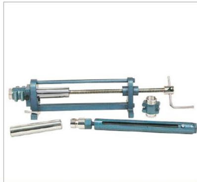
Extractor Frame Universal (Screw Type)