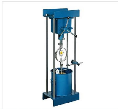
Swell Test Apparatus