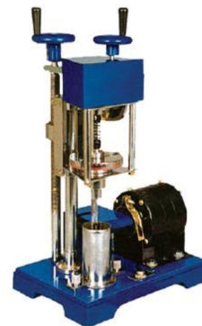
Laboratory Vane Shear Apparatus (Motorized)