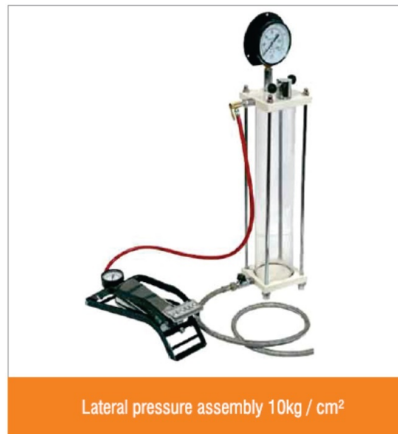
Lateral pressure assembly 10kg / cm 2