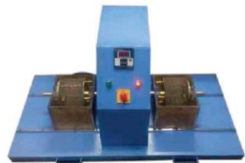
Slake Durability Apparatus