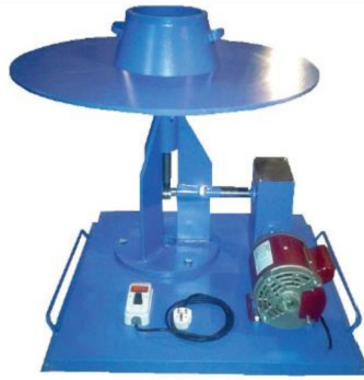
Flow Table Motorized