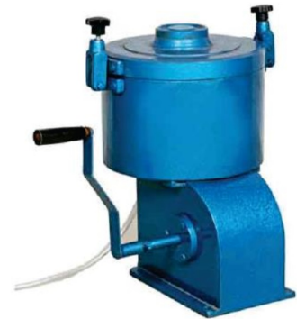
Centrifuge Extractor Hand Operated