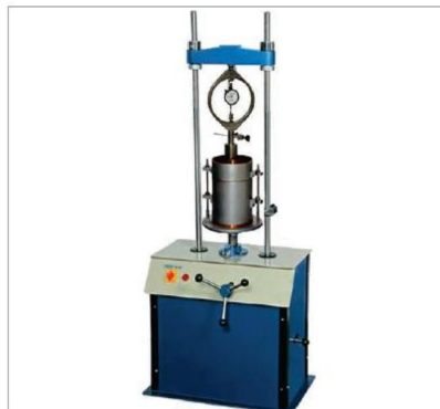
Laboratory California Bearing Ratio Apparatus, Motorized