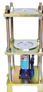
Universal Extruder Frame Hydraulic