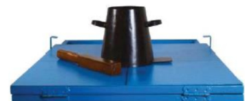
Concrete Flow Table Test Set