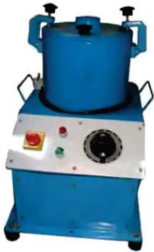
Bitumen Extractor Electrically Operated