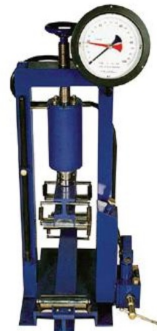
Flexure Testing Machine Hand Operated