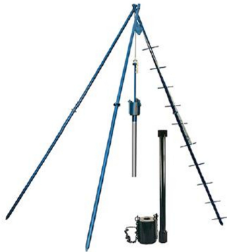
Standard Penetration Test