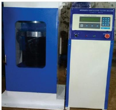
Fully Automatic Compression Testing Machine with Pace Rate Controller