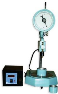
Semi Automatic Cone Penetrometer