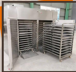
Industrial Tray Dryer