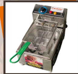
5 L Electric Deep Fryer