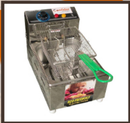
14 L Electric Deep Fryer