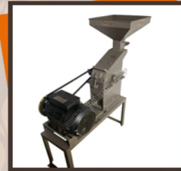
Black Salt Grinding Machine