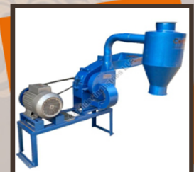
2 HP Chili Grinder