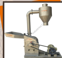
15 HP Chilli Grinding Machine