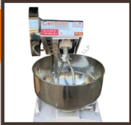
15 Kg Flour Mixing Machine