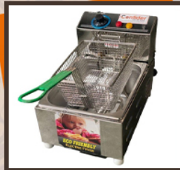
5 L Commercial Deep Fryer