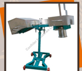
Nylon Sev Making Machine