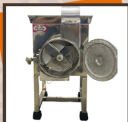
Semi Automatic Vegetable Chopping Machine