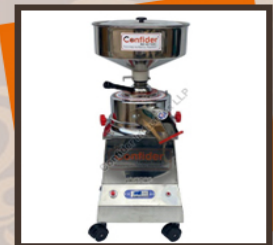
Square 1.25 HP Table Top Flour Mill