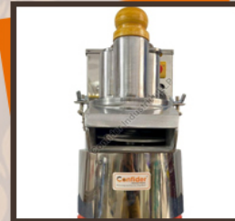
1 HP Vegetable Cutting Machine