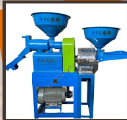
Rice Mill with Normal Motor (Milling and Grinding)