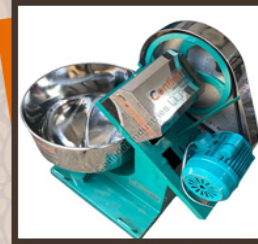
25 Kg Flour Mixing Machine