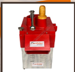
Heavy Duty Vegetable Cutting Machine