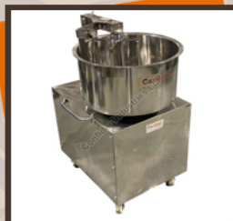
Chutney Making Machine