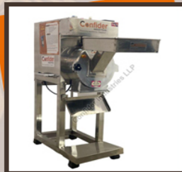
10 Kg/Hr Dry and Wet Pulverizer