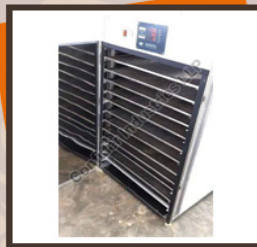
12 Trays Fruit and Vegetable Tray Dryer