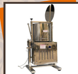
10 Litre Tilting Wet Grinder