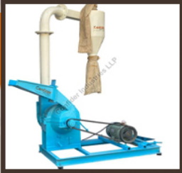
10 HP Blower Pulverizer