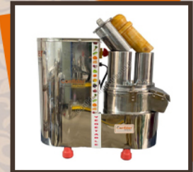
Commercial Vegetable Cutting Machine