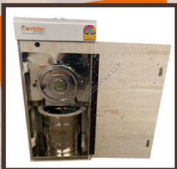
2 HP Domestic Flour Mill