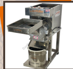
15 Kg/Hr Dry and Wet Pulverizer