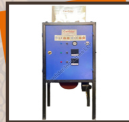
100 Kg/Hr Dry Garlic Peeling Machine