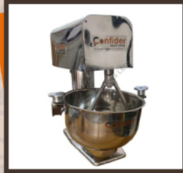
2 Kg Flour Mixing Machine