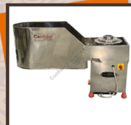
Banana Chips Making Machine