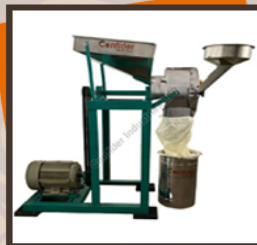
5 HP Double Stage Pulverizer With Motor