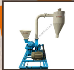
15 HP Impact Pulverizer