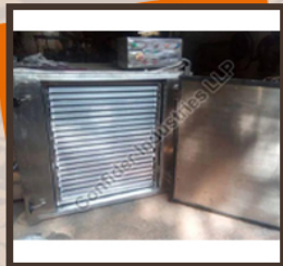
Electric Tray Dryer