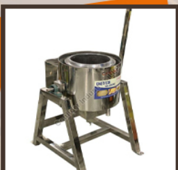
OWD2T Oil Dryer Machine