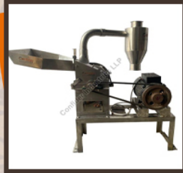
2 HP Spice Grinding Machine