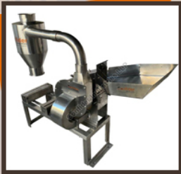
5 HP Chilli Grinding Mill