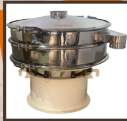
VSM48 Vibro Sifter Machine