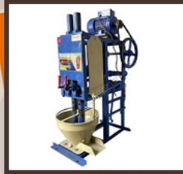
2 Bar Kandap Machine