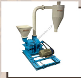
Heavy Duty Cyclone Pulverizer