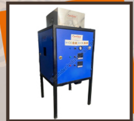
30 Kg/Hr Dry Garlic Peeling Machine