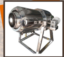
Gas Fired Roasting Machine