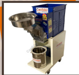
Mild Steel 2 in 1 Pulverizer Machine