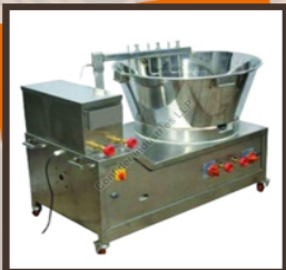
100 L Khoya Making Machine