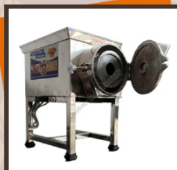
Dry Fruit Chips Machine