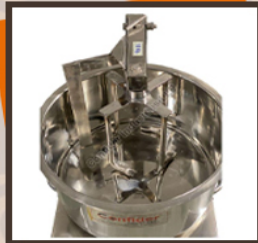
Stainless Steel Flour Mixing Machine