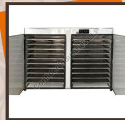
20 Trays Fruit and Vegetable Tray Dryer