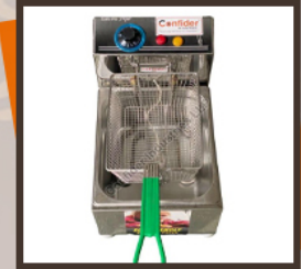
14 L Commercial Deep Fryer