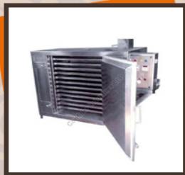
10 Trays Electric Tray Dryer Machine