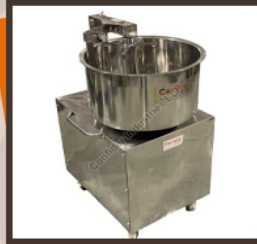
20 Kg Besan Mixing Machine