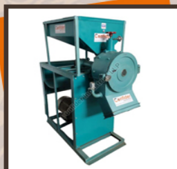
Double Chamber Pulverizer Machine