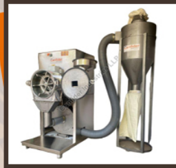
10 HP Double Chamber Pulverizer With Cyclone