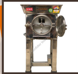
1 HP Gravy Machine