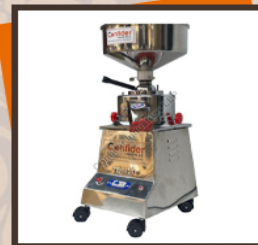
Square 1 HP Table Top Flour Mill