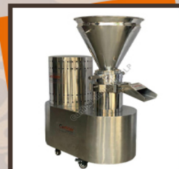
Commercial Peanut Butter Machine