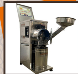
Stainless Steel 2 in 1 Pulverizer Machine