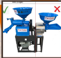
Rice Mill with Standard Motor (Milling)