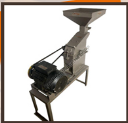
SLG2WO Salt Grinding Machine