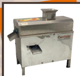
200 Kg Mango Pulp Making Machine