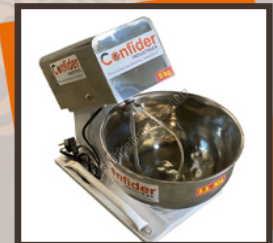
10 kg Flour Mixing Machine