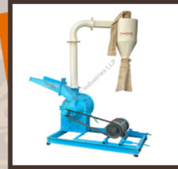
5 HP Double Chamber Blower Pulverizer