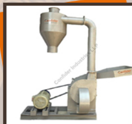
10 HP Chilli Grinding Machine