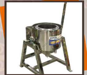
OWD2T Oil Dryer Machine