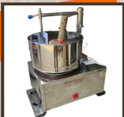
10 Litre Steady Type Wet Grinder