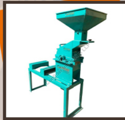
2 HP Sugar Grinding Machine Without Motor