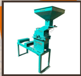
2 HP Sugar Grinding Machine with Motor