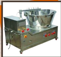
55 L Khoya Making Machine