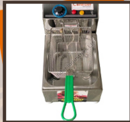
2L Electric Deep Fryer