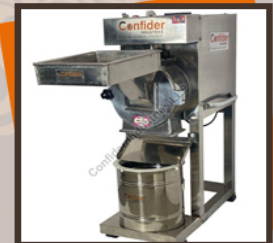
25 Kg/Hr Dry and Wet Pulverizer