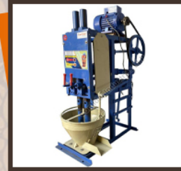
4 Bar Pounding Machine