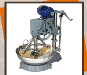
Kaju Musti Machine