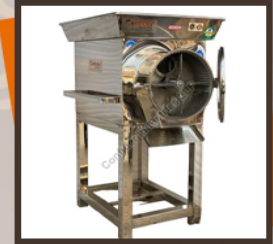
5 HP Gravy Machine