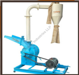
7.5 HP Double Stage Blower Pulverizer