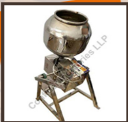
Nuts Roasting Machine