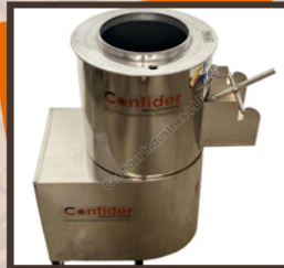
15 KG Potato Peeling Machine