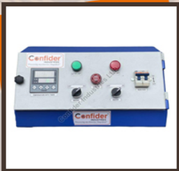
5 Trays Electric Tray Dryer Machine