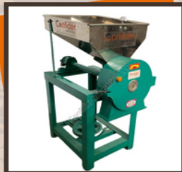
3 HP Hammer Pulverizer Machine Without Motor