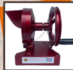
Manual Cashew Nut Cutting Machine