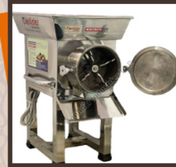
2 HP Gravy Machine