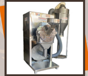
5 HP Double Chamber Cyclone Pulverizer