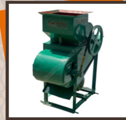
100 Kg/Hr Garlic Bulb Breaker Machine