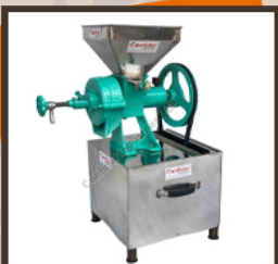
Wet Dal Machine