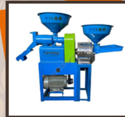
Mini Rice Mill Without Motor