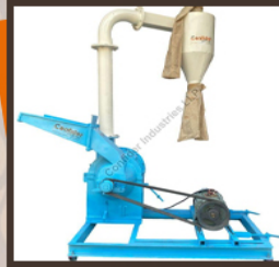
15 HP Double Chamber Blower Pulverizer