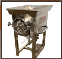
Hammer Mill Type Gravy Machine