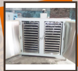
24 Tray Vegetable Dehydration Machine