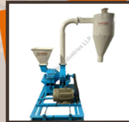
7.5 HP Ultrafine Impact Pulverizer Machine