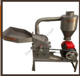
10 HP Spice Grinding Machine