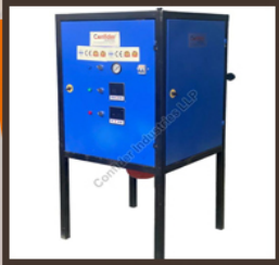
50 Kg/Hr Dry Garlic Peeling Machine