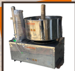
7 Litre Steady Type Wet Grinder