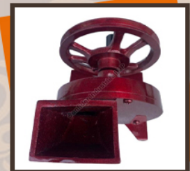
Manual Dry Fruit Cutting Machine