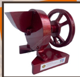
Manual Almond Cutting Machine