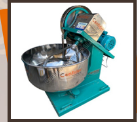
30 Kg Flour Mixing Machine