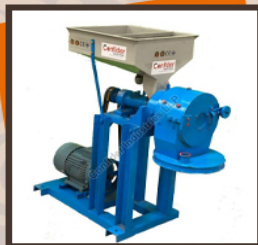
10 HP Double Stage Pulverizer With Motor