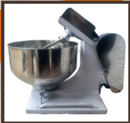
50 Kg Flour Mixing Machine