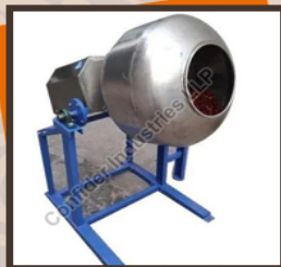
Spices Roasting Machine