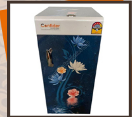
1 HP Domestic Flour Mill