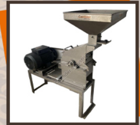
Rock Salt Grinding Machine