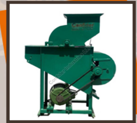
400 Kg/Hr Garlic Bulb Breaker Machine