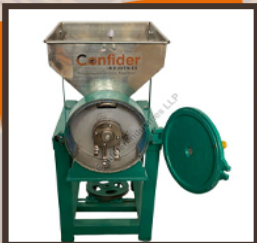
2 HP Hammer Pulverizer Machine With Motor