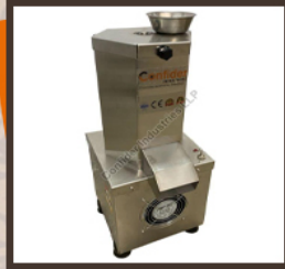
Automatic Garlic Peeling Machine