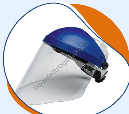
Cryo Face Shield