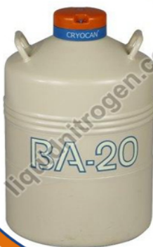
Cryocan BA-20 Liquid Nitrogen Container