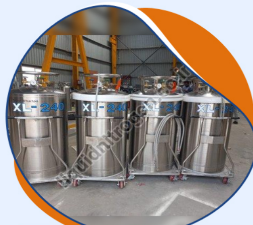
240L 1.5 Bar Low Pressure Dura Cylinders