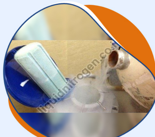
Liquid Nitrogen For Artificial Insemination Of Cattle