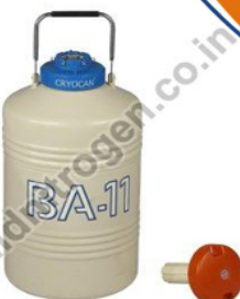
Cryocan BA-11 Liquid Nitrogen Container