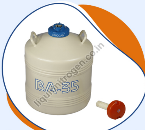
Liquid Nitrogen For Animal Husbandry