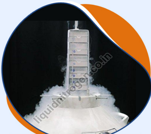
Stem Cells Liquid Nitrogen