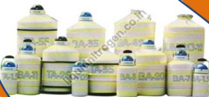
Liquid Nitrogen Containers