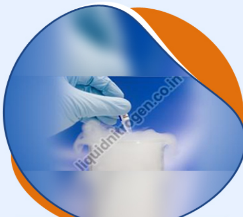
Chemical Reaction Nitrogen