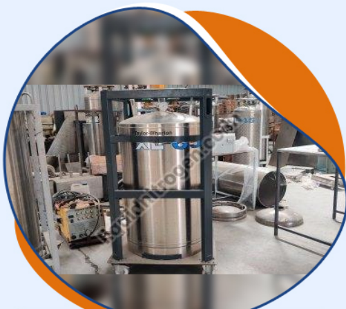
10000L Cryogenic Gas Cylinders