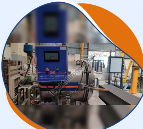
Stainless Steel Cryogenic Chamber