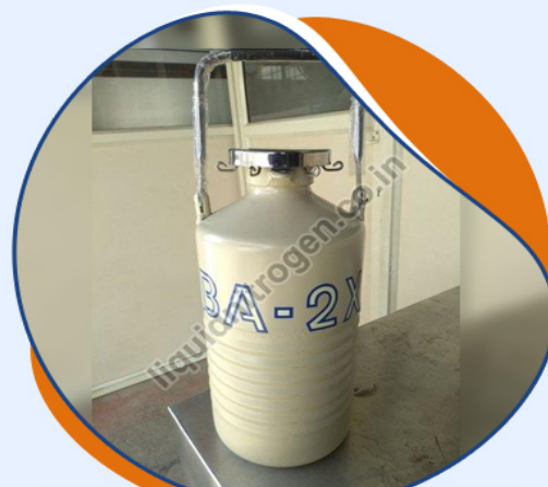
Cryogenic Container IOCL BA 2X (IBP)