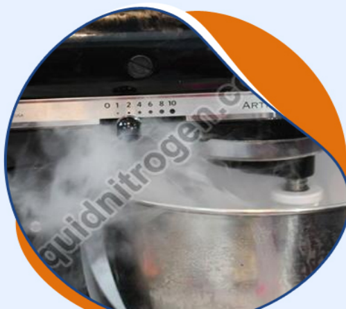
Liquid Nitrogen For Ice Cream