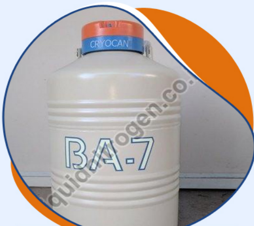
Cryocan BA-7 Liquid Nitrogen Container