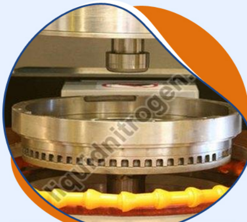
Cryogenic Shrink Fitting