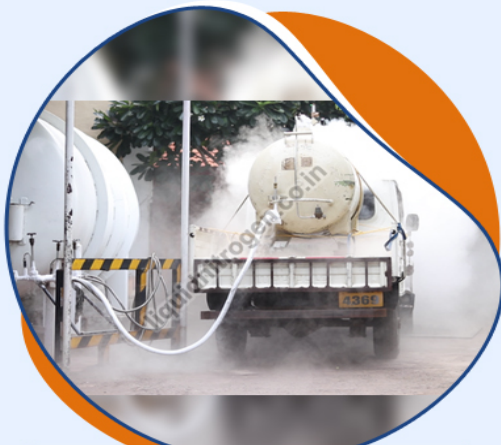
Liquid Industrial Oxygen