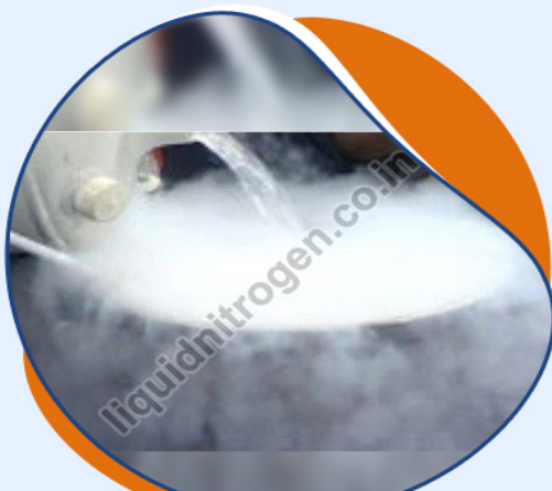
Laboratories Liquid Nitrogen