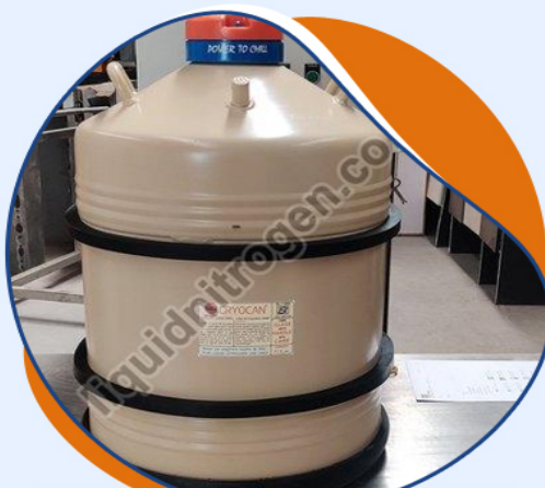
Cryocan TA-55 Liquid Nitrogen Container