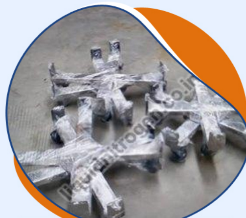
Transformers Base Rollers Liquid Nitrogen Container