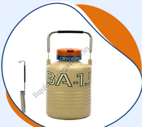
Liquid Nitrogen Cryogenic Containers BA 1.5