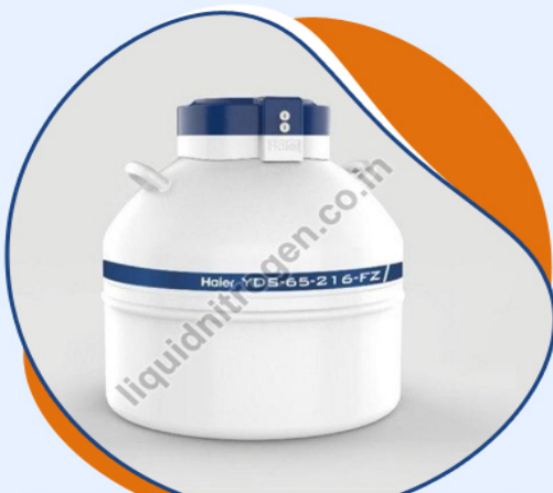
Liquid Nitrogen Dewar For Cryo Biological Transport