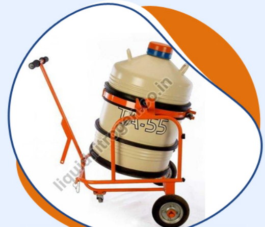
Tilting Cryogenic Trolley