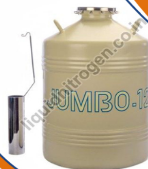
Liquid Nitrogen Cryogenic Containers Jumbo 12