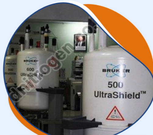
Chemical Reaction Liquid Nitrogen Gas