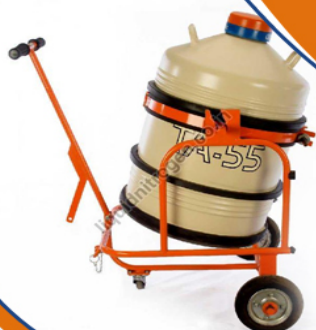
Liquid Nitrogen Container With Trolley