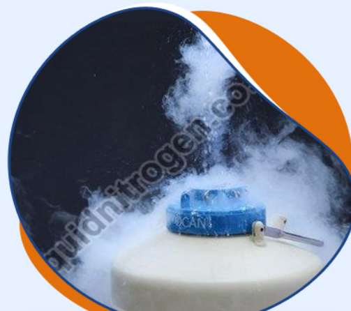
Liquid Nitrogen Tank