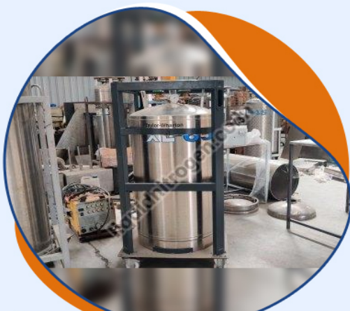
Pharmacy Liquid Nitrogen