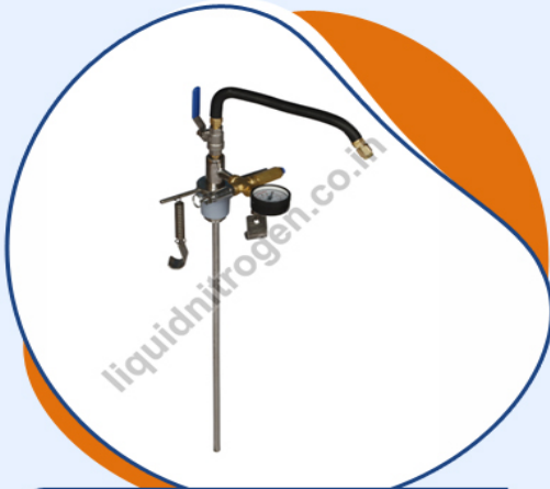
Liquid Nitrogen Pump