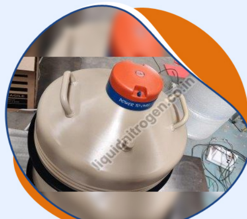
Cryocan BA-23 Cryogenic Containers