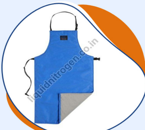
Frosters Cryo Aprons