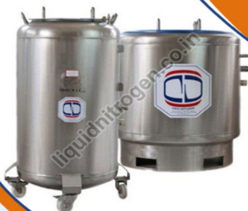
Cord Blood Dewar