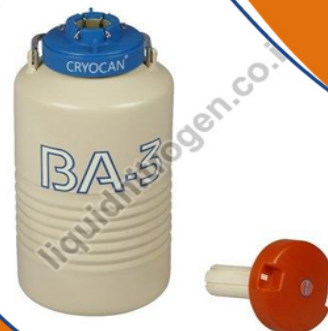
Cryocan BA-3 Liquid Nitrogen Container