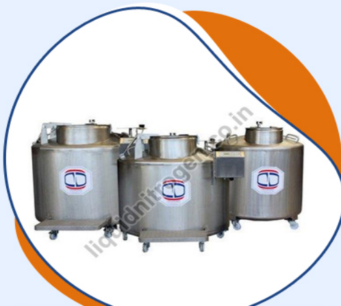
Liquid Nitrogen Dewar for Cord Blood