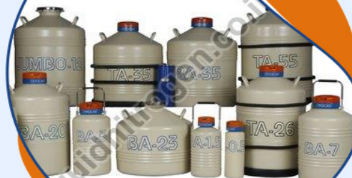
50L Liquid Nitrogen Containers