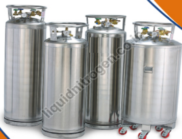
Pure Liquid Nitrogen